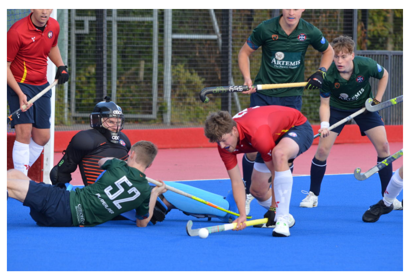
Another attack thwarted by ESM.