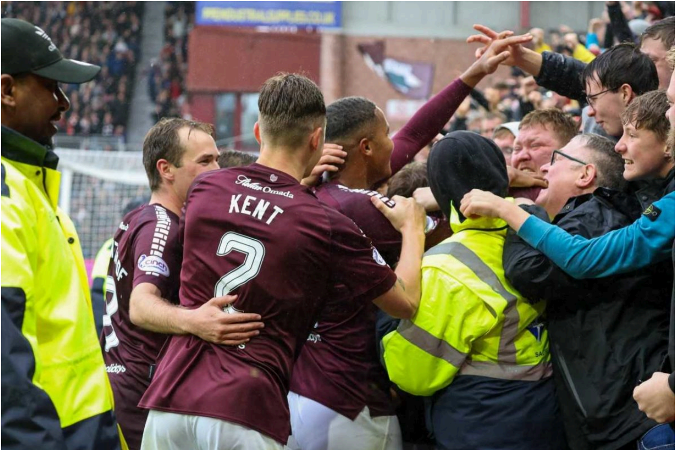
Celebration time after Hearts score at Tynecastle in Capital derby.