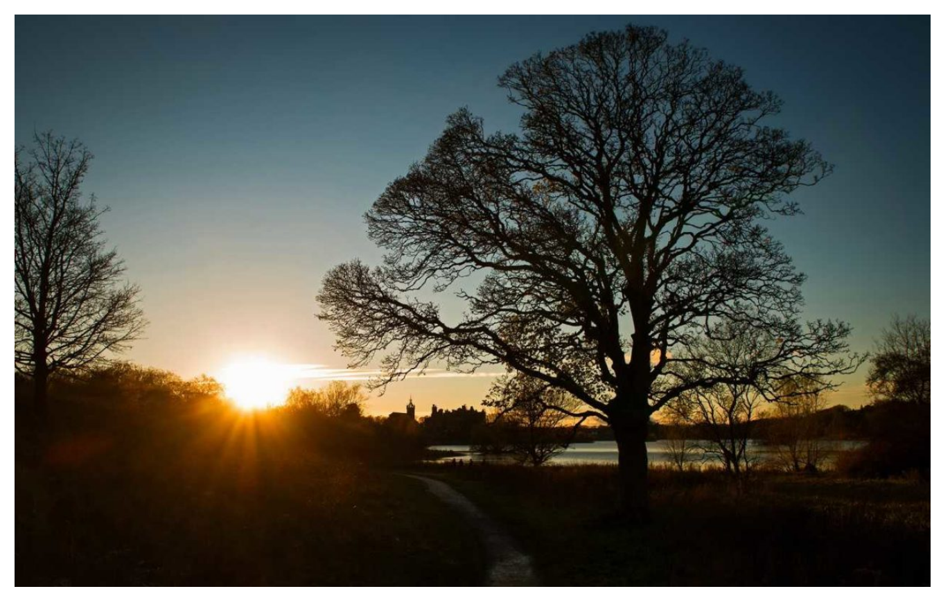
Linlithgow Loch at sunset