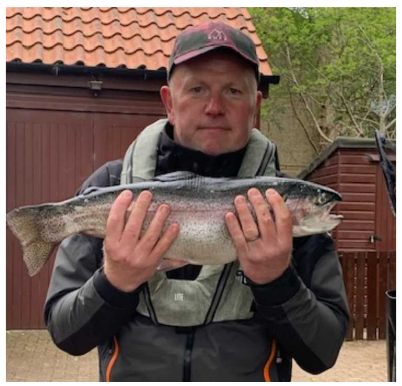
A proud angler holds a prize specimen hooked in Linlithgow Loch.