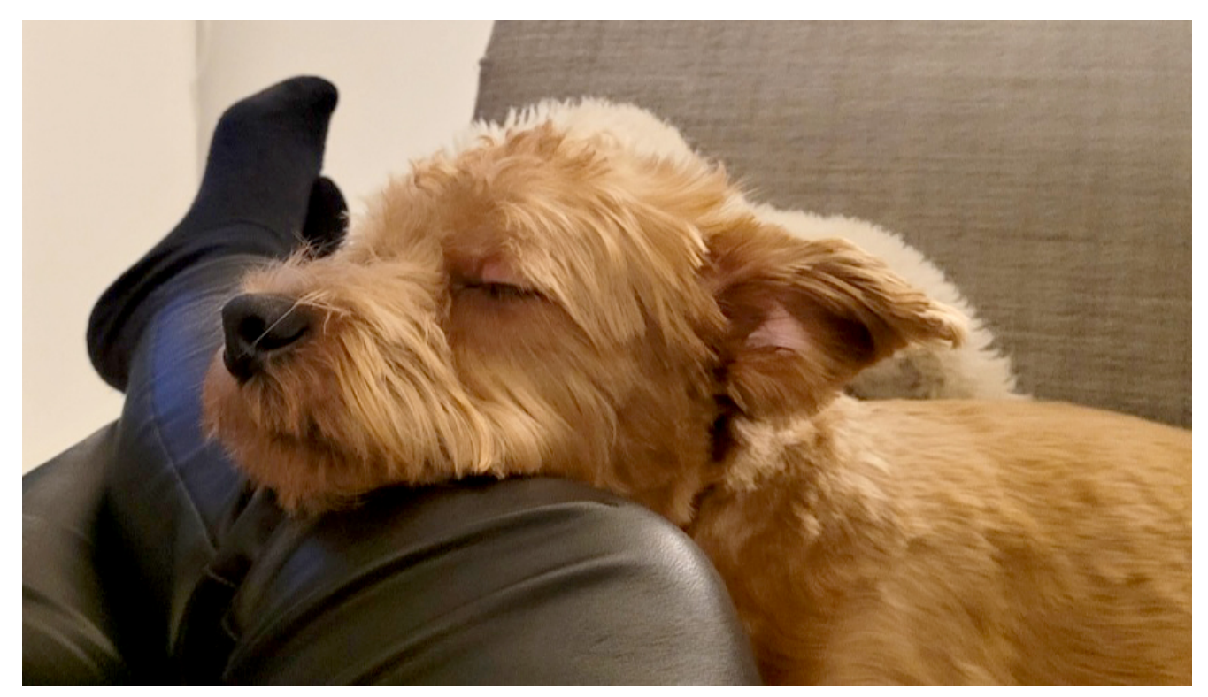
Monty the Westiepoo