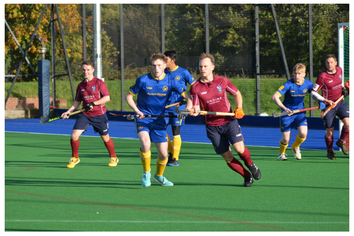
Uddingston visit Peffermill to play Watsonians.