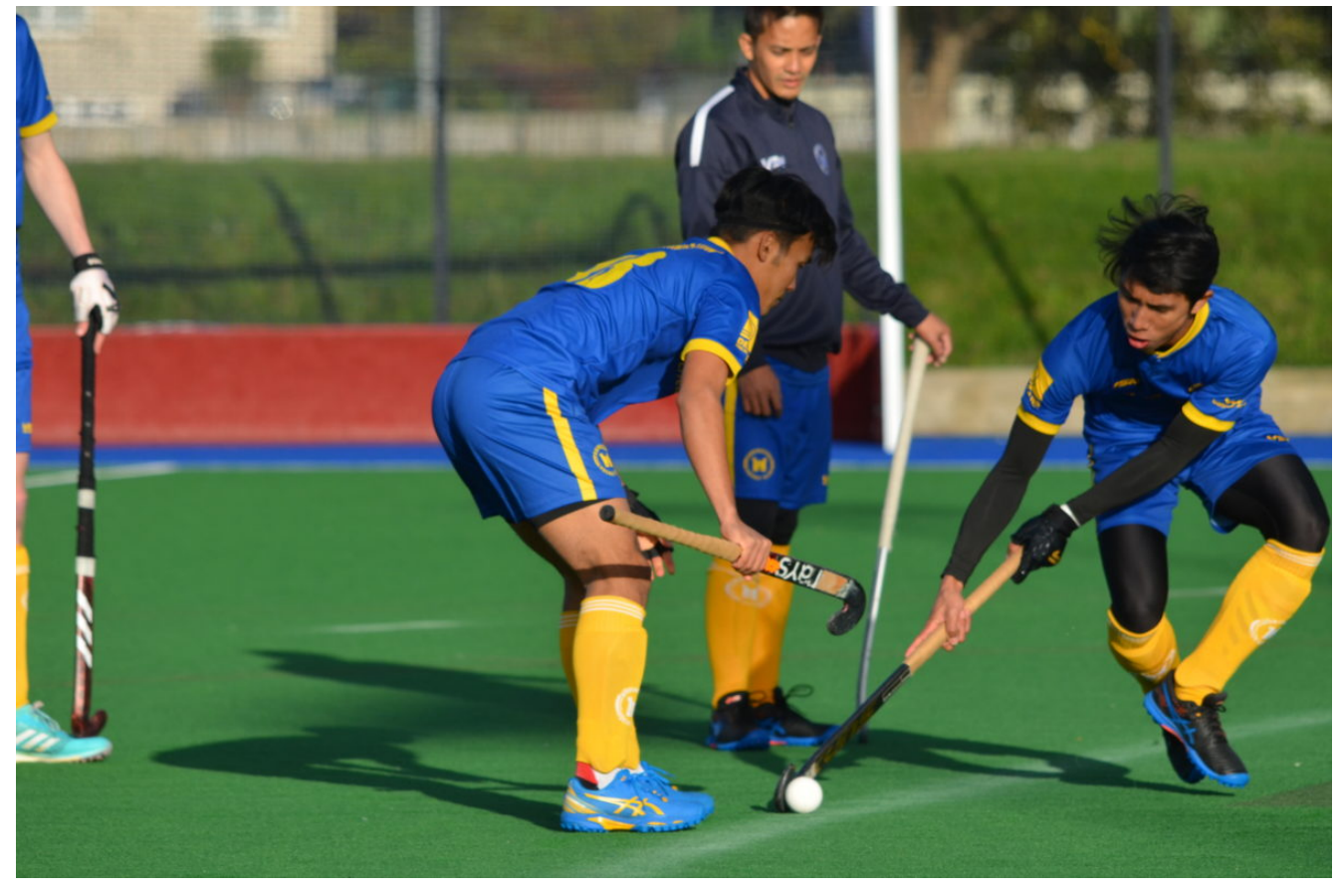
Warm-up for Uddingston at Peffermill