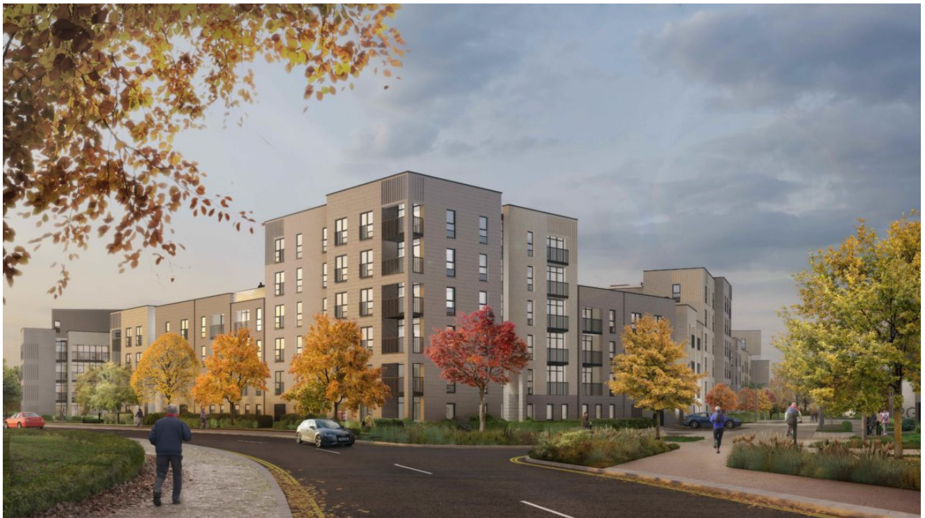
View from Marine Drive