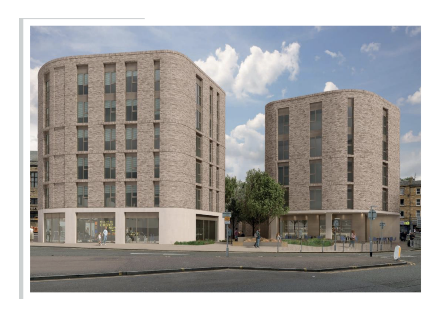
At the Lyceum