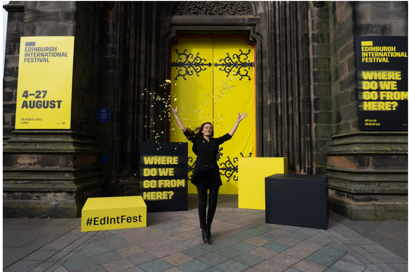
Nicola Benedetti, CBE, the Director of Edinburgh International Festival announcing her first programme for the 2023 Edinburgh International Festival