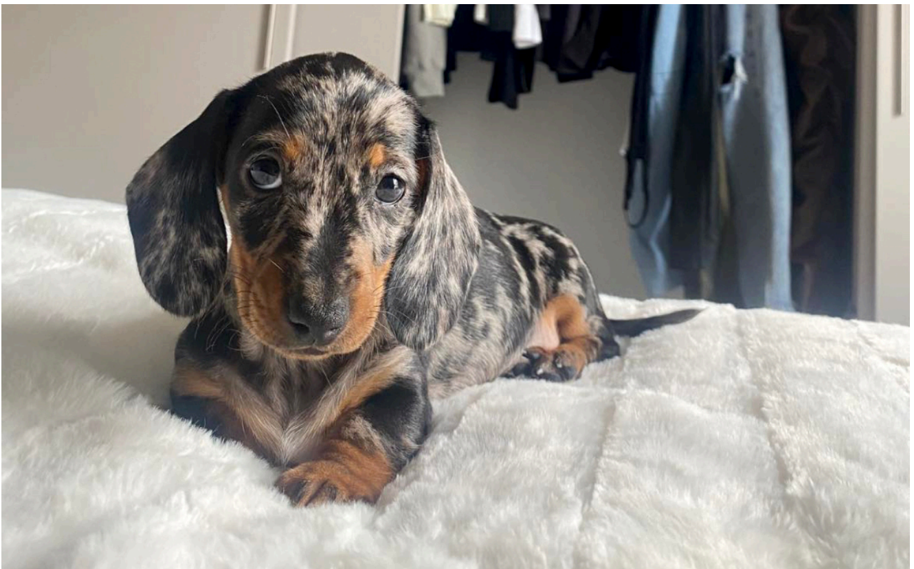
Sunny the dappled daschund