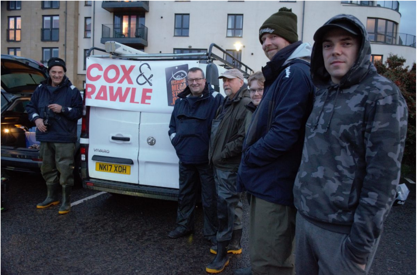
Registraton for the match in the car park.