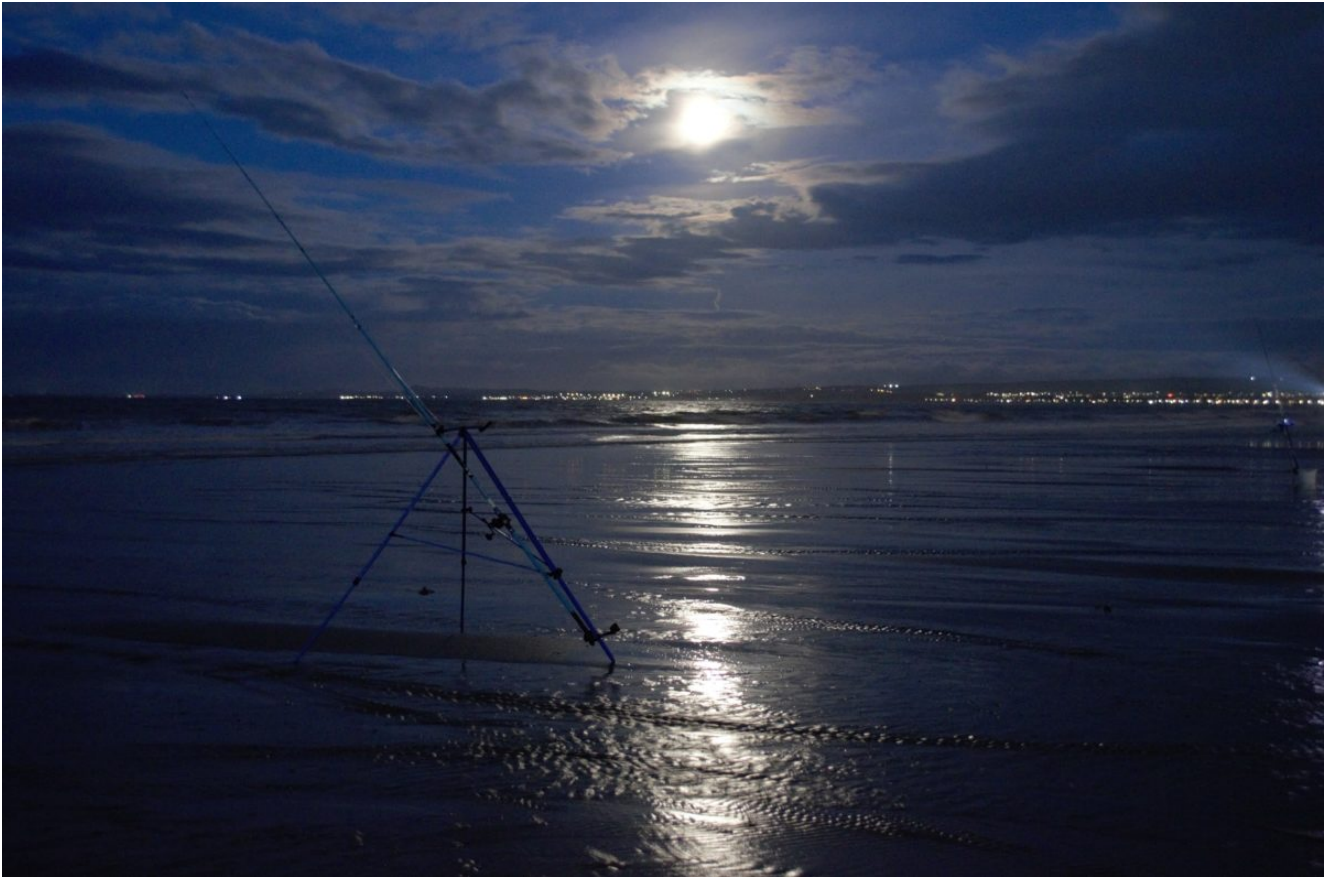
Night setting in quickly on the shoreline and the trap is set.