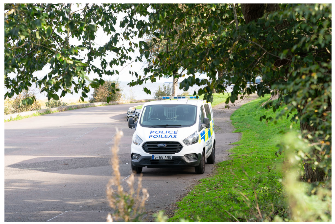
Police van at the western end of the cordon on Cramond foreshore