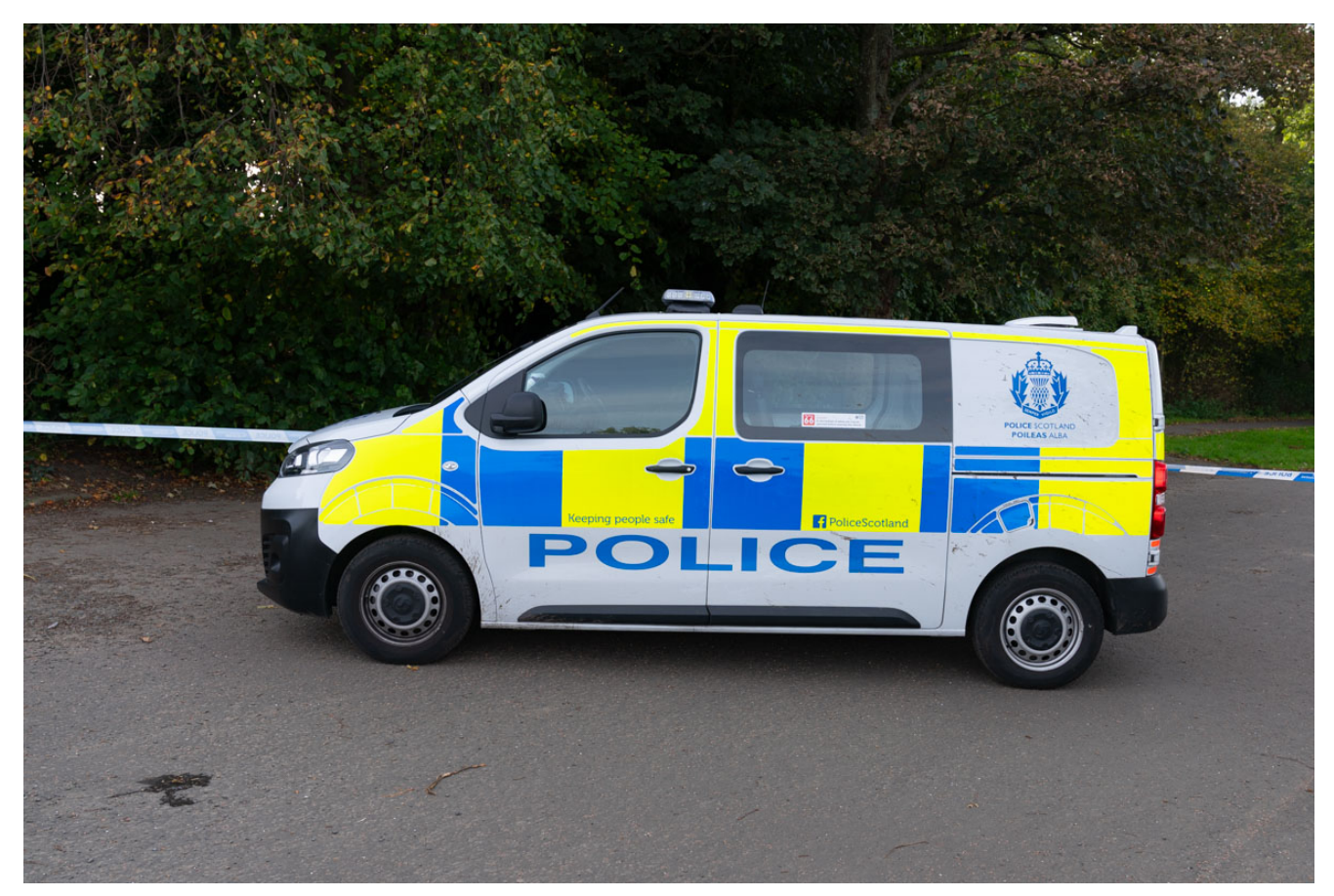
A police van blocked the way