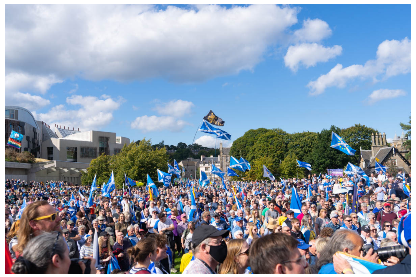
Believe in Scotland Rally 2 September 2023