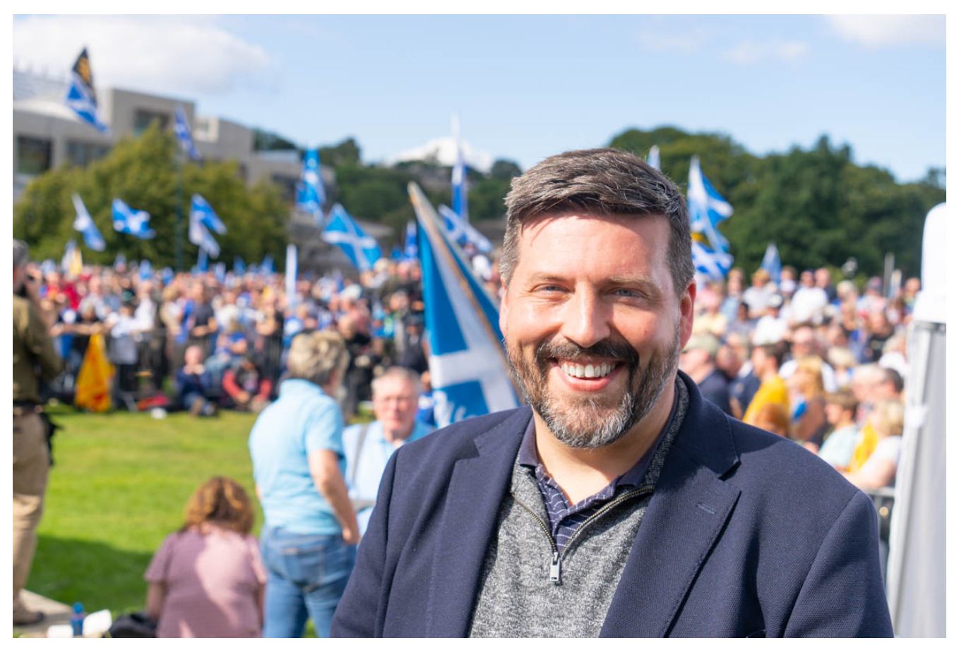
Minister for Independence Jamie Hepburn who addressed the Believe in Scotland Rally 2 September 2023

this matter because it serves to remind those who need reminding that we're still here. We are not going away. We're going to keep campaigning, we're going to make the case, we're going to be in every city, every town, every village, every hamlet, every community, every street, doorstep by doorstep making the case for independence until we win."