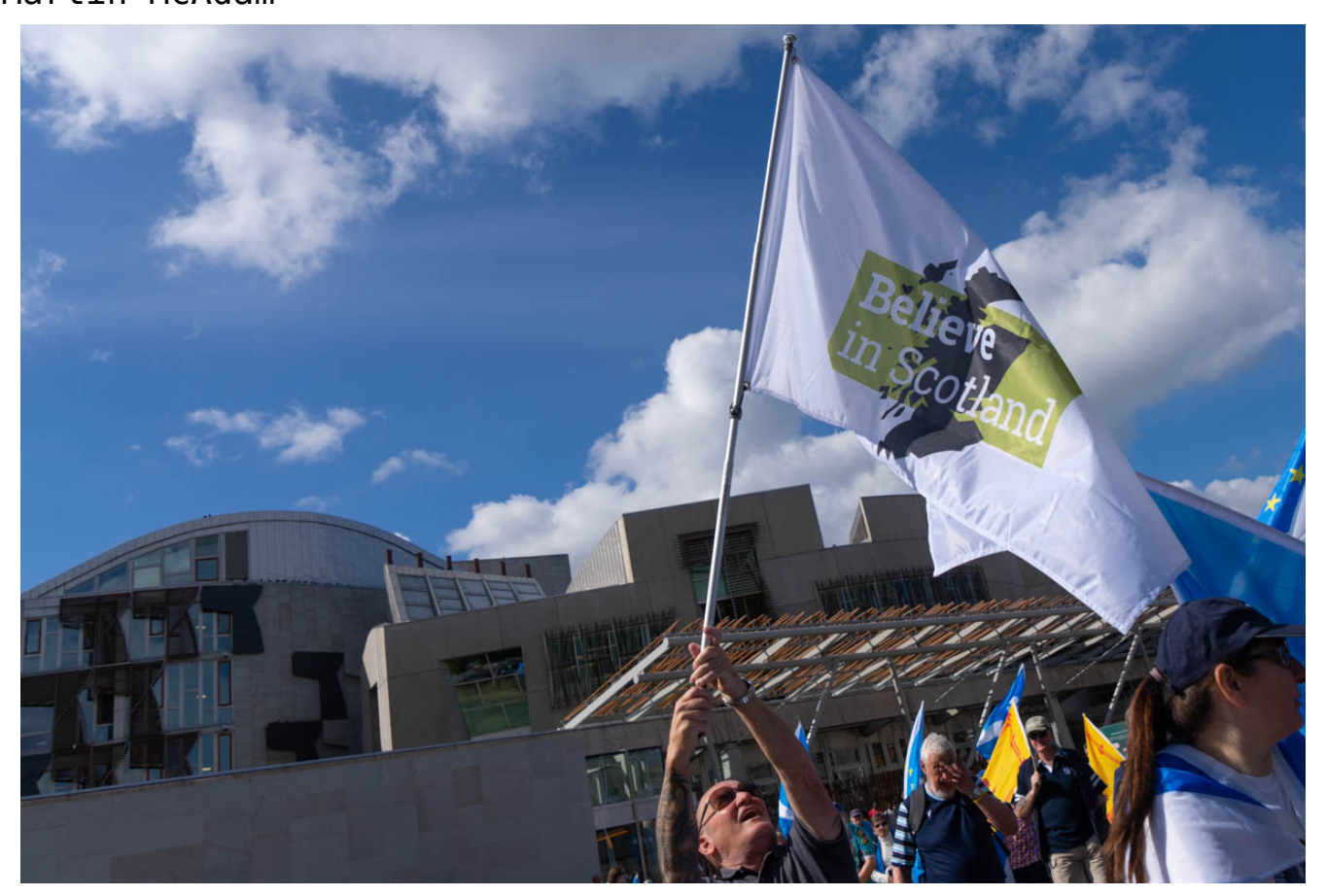
Believe in Scotland Rally 2 September 2023

Mr Yousaf marched with the crowds down the Royal Mile