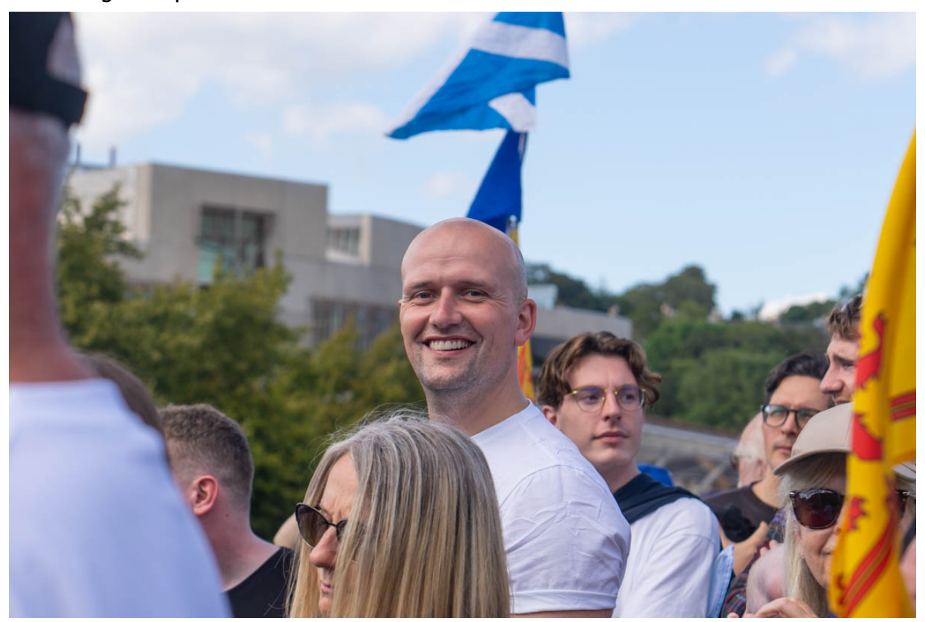
The SNP leader at Westminster, Stephen Flynn MP, attended the Believe in Scotland Rally 2 September 2023