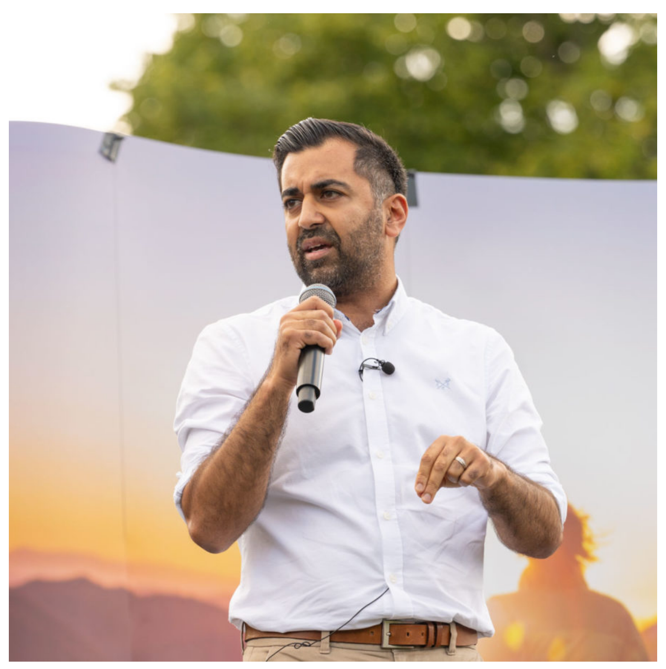
Humza Yousaf speaking at the Believe in Scotland rally

repeal the Act of the Union has been passed by a majority of that Scottish Parliament."