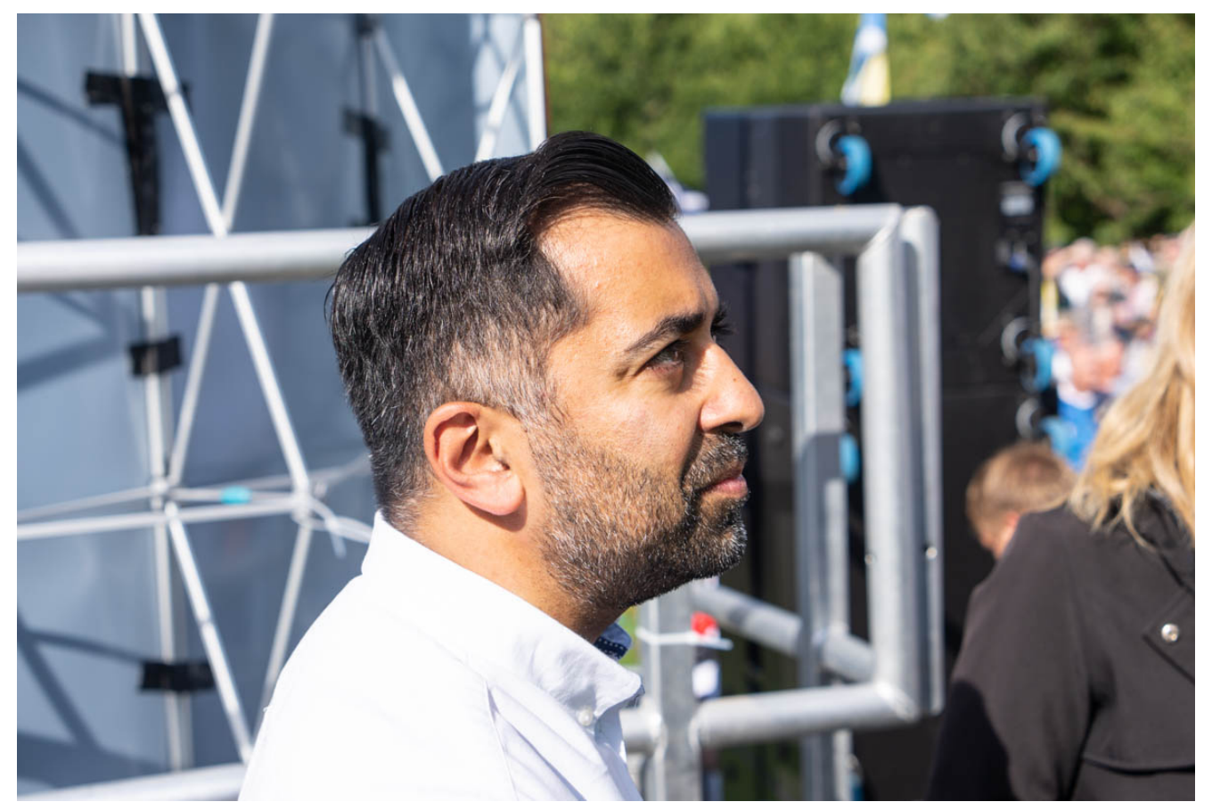
Humza Yousaf collects his thoughts before addressing the Believe in Scotland Rally 2 September 2023