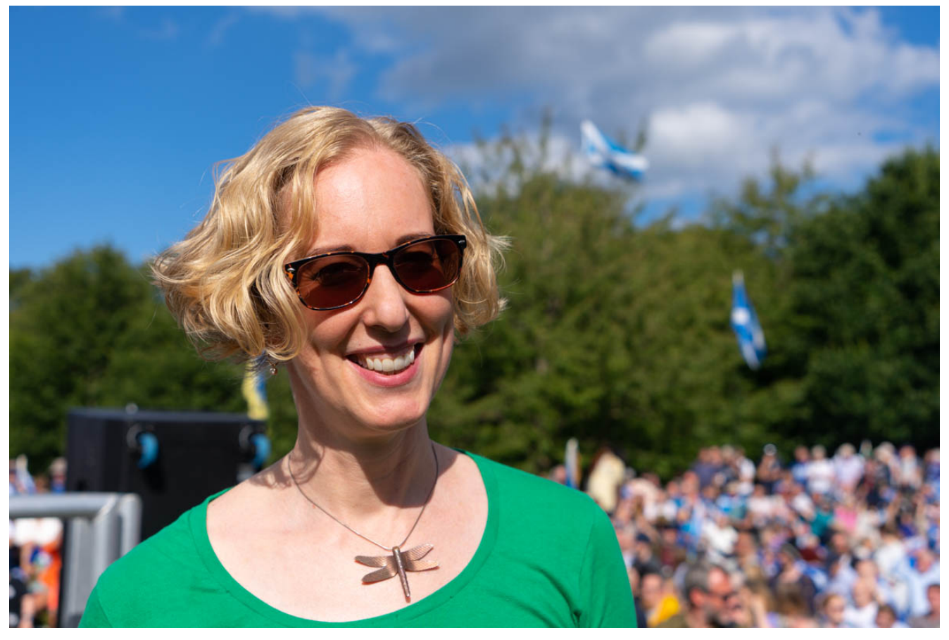
Lorna Slater MSP addressed the Believe in Scotland Rally 2