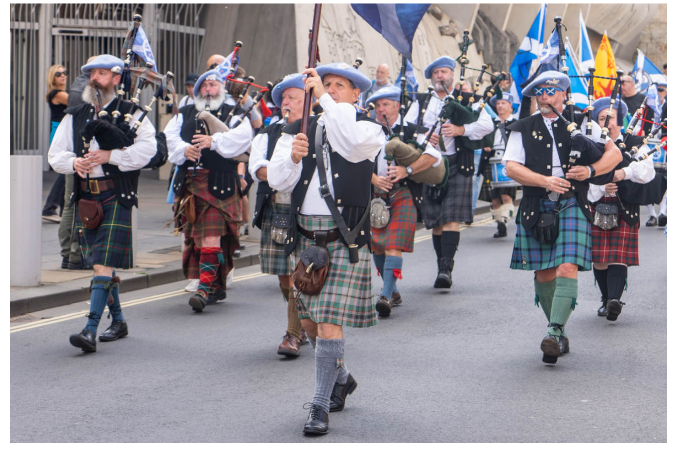
Believe in Scotland Rally 2 September 2023