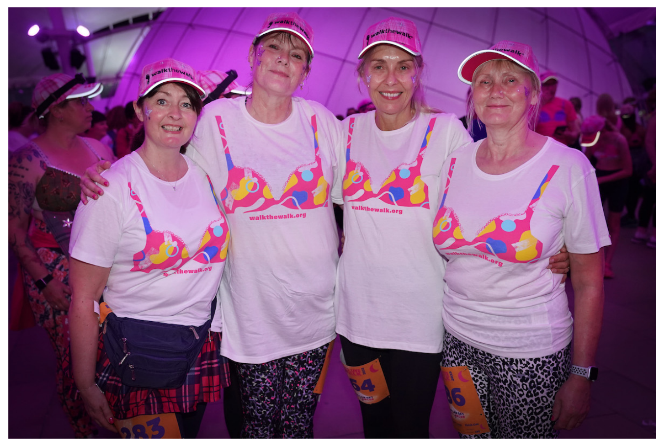
Moon Walk Scotland 2023

All images © Stewart Attwood Photography 2023.