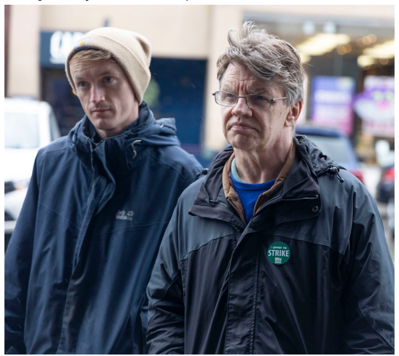
18/09/2023

are taking part in historic strike action throughout September. NUJ members delivered a clear mandate last month, when 78 per cent of journalists at the publisher voted in favour of strike action in the first ever company-wide ballot. In Edinburgh journalists from The Scotsman and Edinburgh Evening News joined the NUJ picket line.