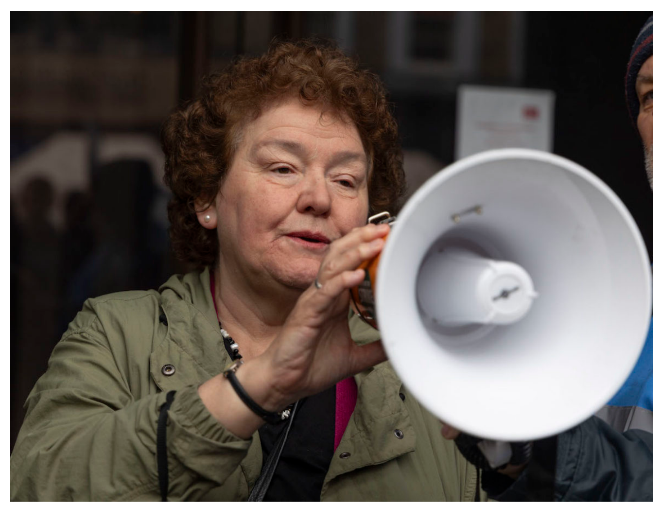
18/09/2023

In Edinburgh journalists from The Scotsman and Edinburgh Evening News joined the NUJ picket line.