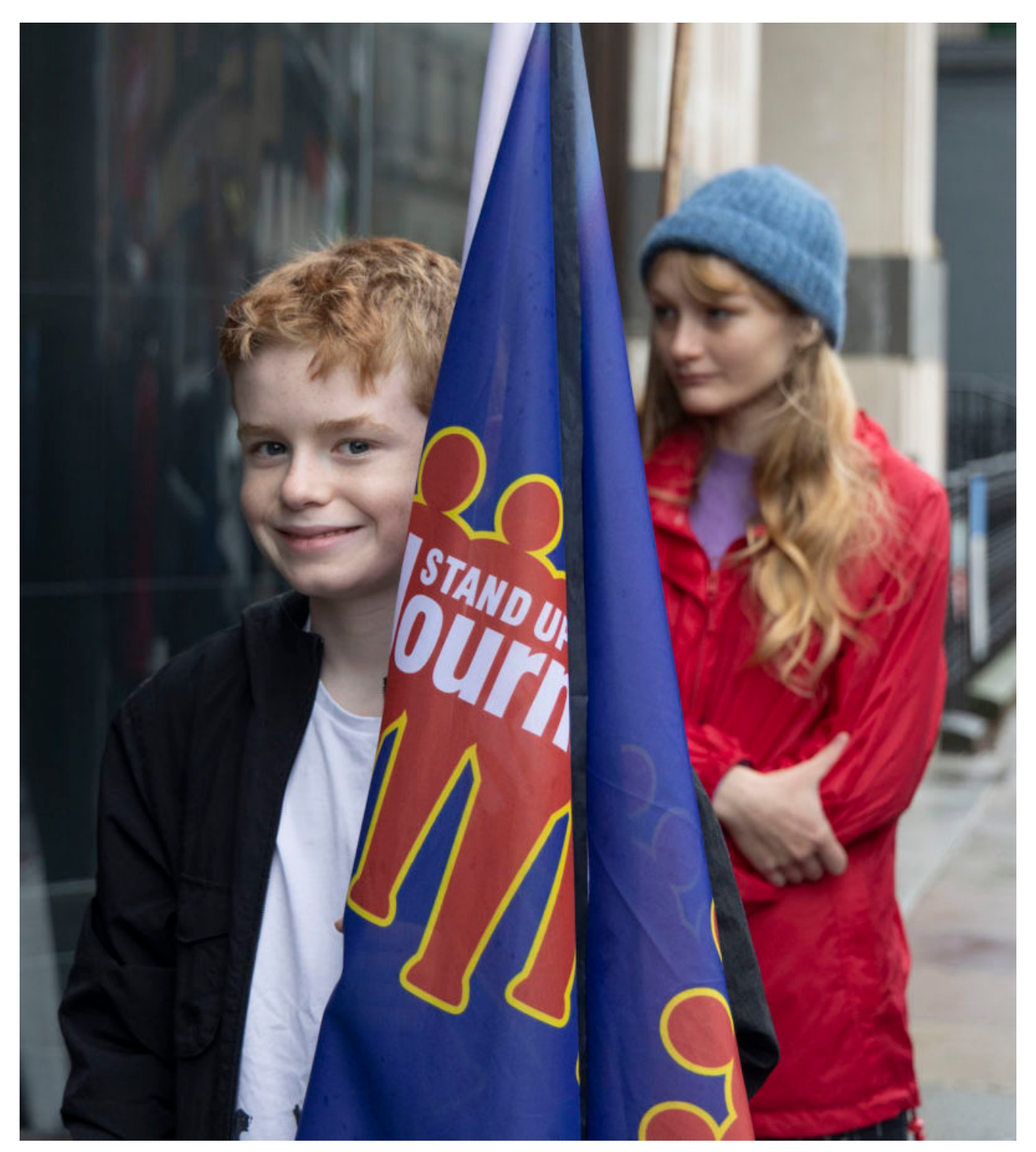
18/09/2023

In Edinburgh journalists from The Scotsman and Edinburgh Evening News joined the NUJ picket line.