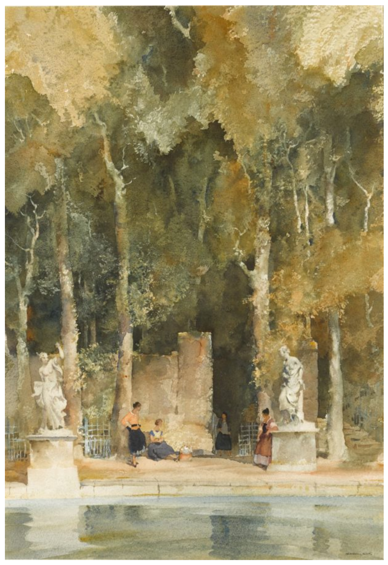
Sir William Russell Flint, Gossip in a Park, est. £5,000-7,000