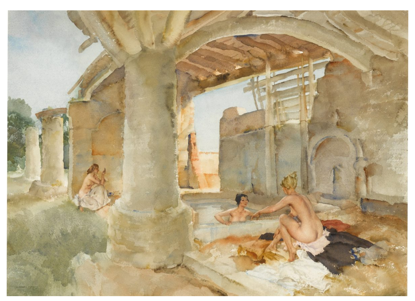
Sir William Russell Flint, Silver Shade, Languedoc, est. £15,000-20,000

Flint (1880-1969) was born and educated in Edinburgh. One of the greatest watercolourists of the last century, his prints adorned the walls of millions. His former studio in Camden Hill was only a ten minute walk from Mercury's home.