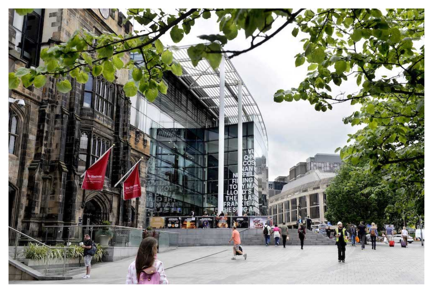
Vue Cinema Edinburgh Omni Centre