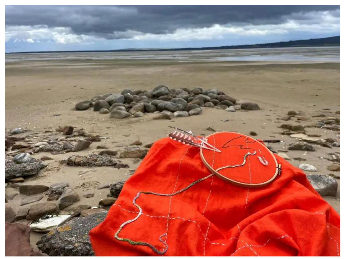
Tablecloth embroidery workshop