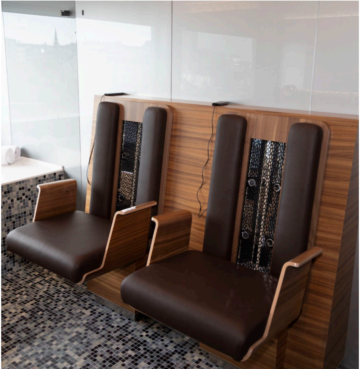
13/09/2023 Luxury Cruising Yacht Scenic Eclipse II at Ocean Terminal Dock Edinburgh.