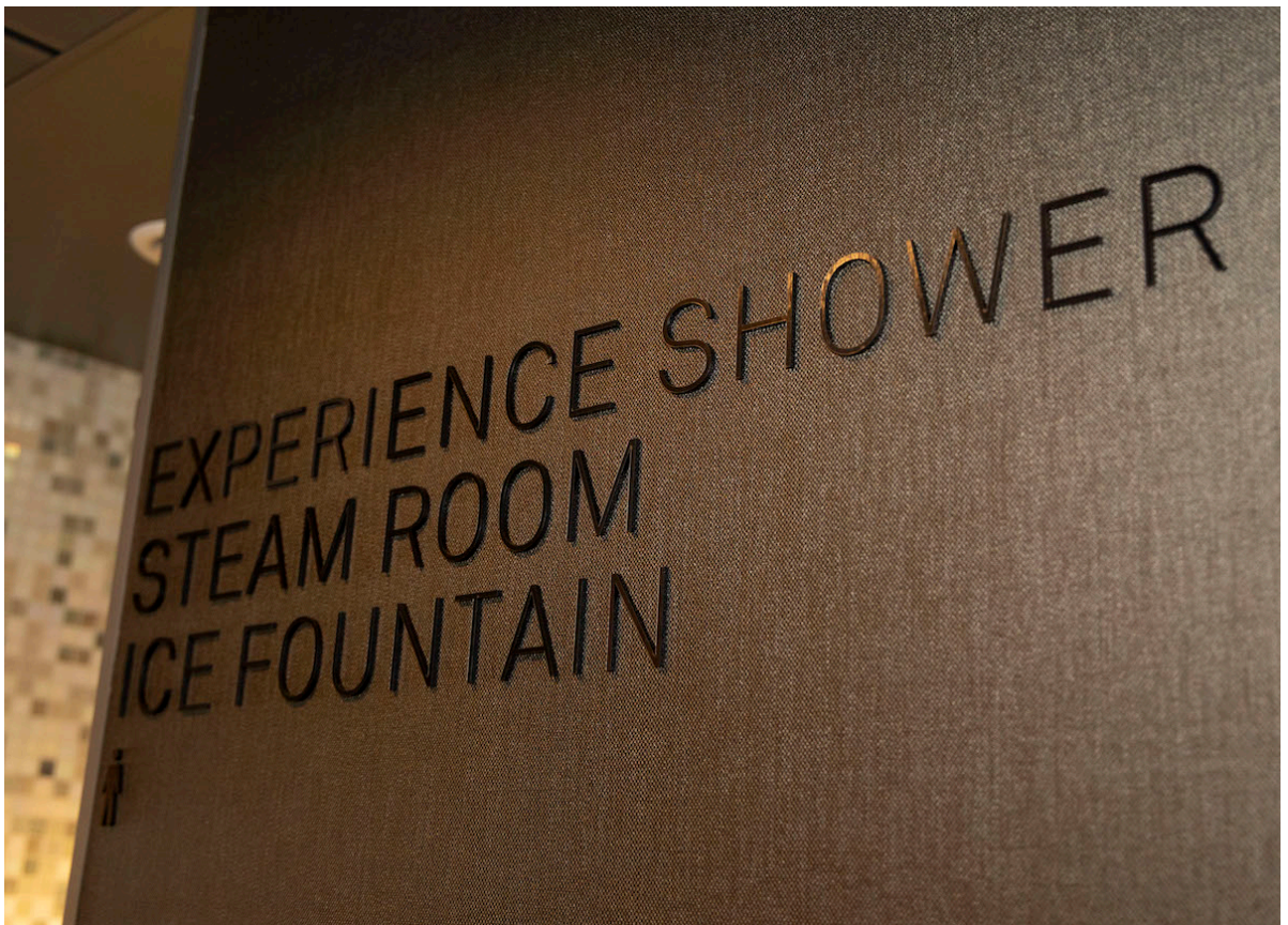
13/09/2023 Luxury Cruising Yacht Scenic Eclipse II at Ocean Terminal Dock Edinburgh.