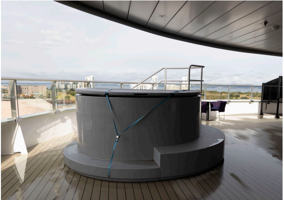
Owner's suite 13/09/2023 Luxury Cruising Yacht Scenic Eclipse II at Ocean Terminal Dock Edinburgh.