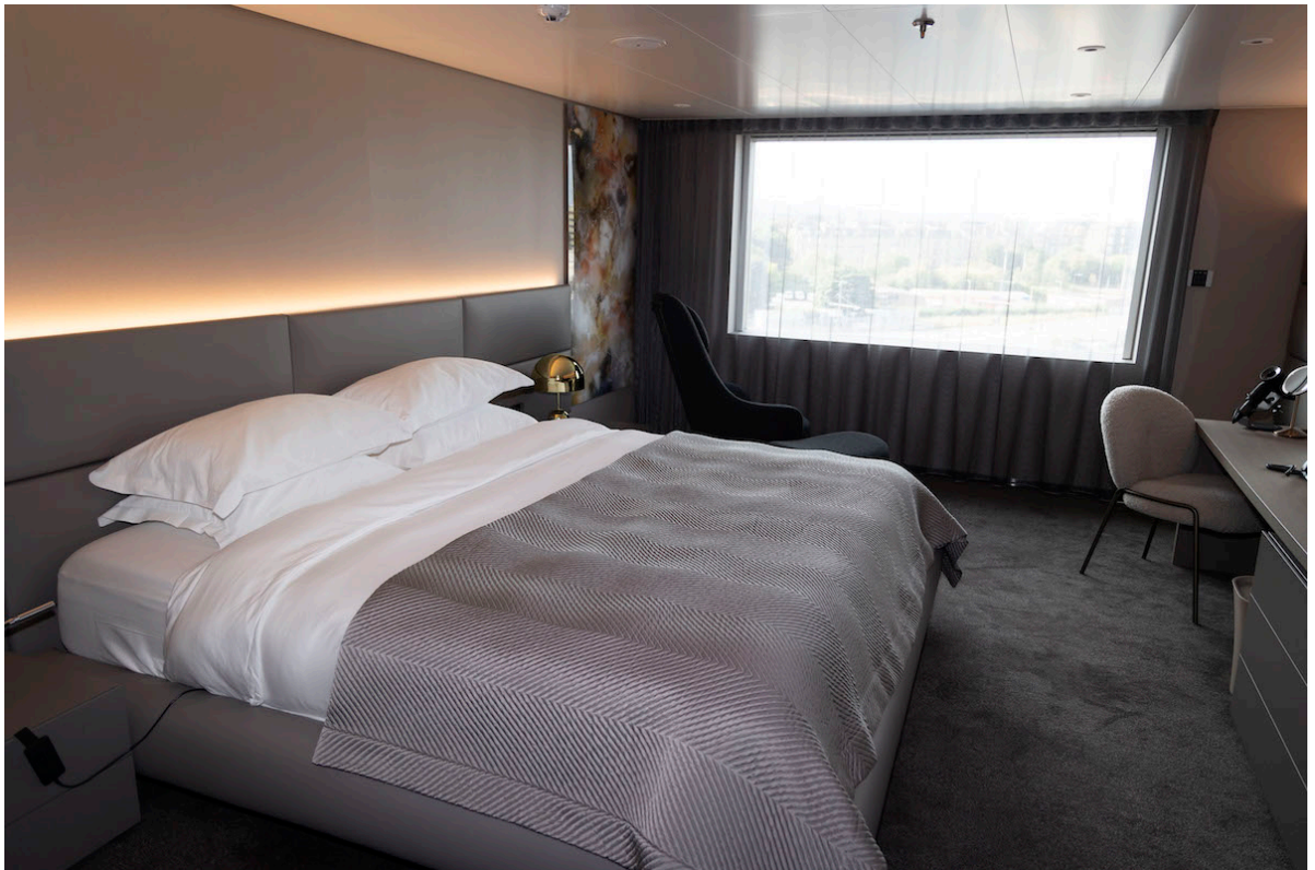
Owner's suite 13/09/2023 Luxury Cruising Yacht Scenic Eclipse II at Ocean Terminal Dock Edinburgh.