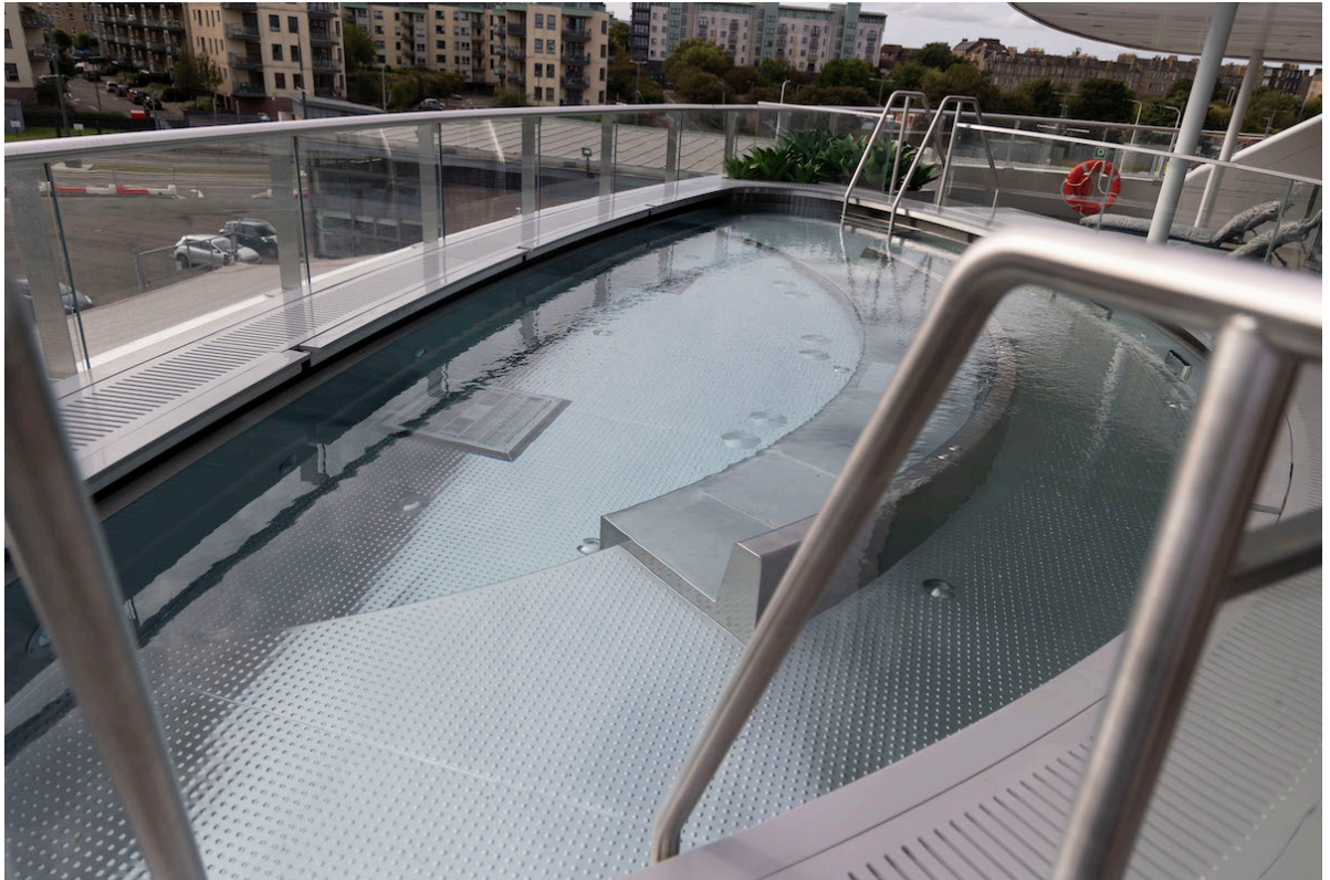
13/09/2023 Luxury Cruising Yacht Scenic Eclipse II at Ocean Terminal Dock Edinburgh.