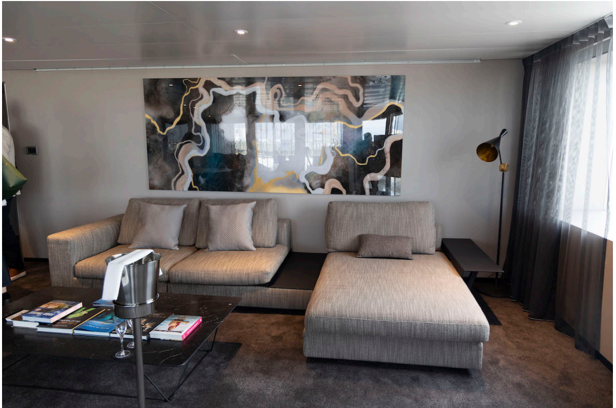
13/09/2023 Luxury Cruising Yacht Scenic Eclipse II at Ocean Terminal Dock Edinburgh.