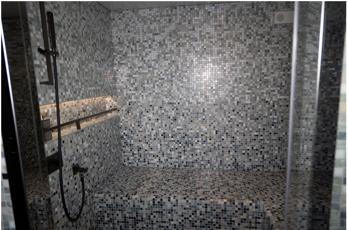
13/09/2023 Luxury Cruising Yacht Scenic Eclipse II at Ocean Terminal Dock Edinburgh.