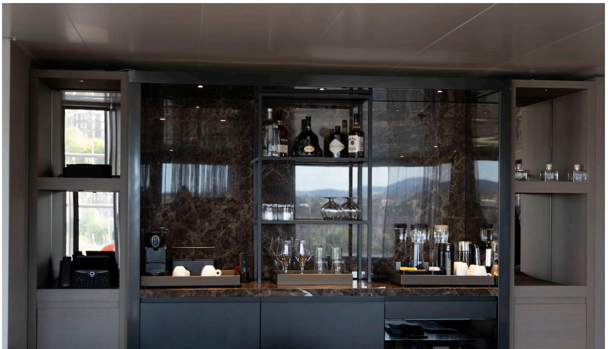
13/09/2023 Luxury Cruising Yacht Scenic Eclipse II at Ocean Terminal Dock Edinburgh.