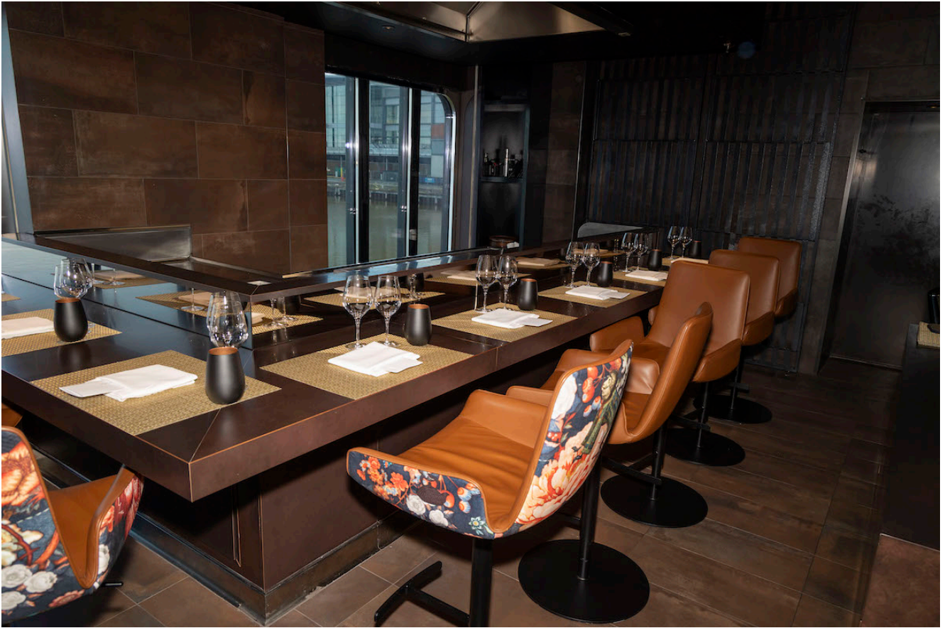
13/09/2023 Luxury Cruising Yacht Scenic Eclipse II at Ocean Terminal Dock Edinburgh. Night Market exclusive sushi dining.