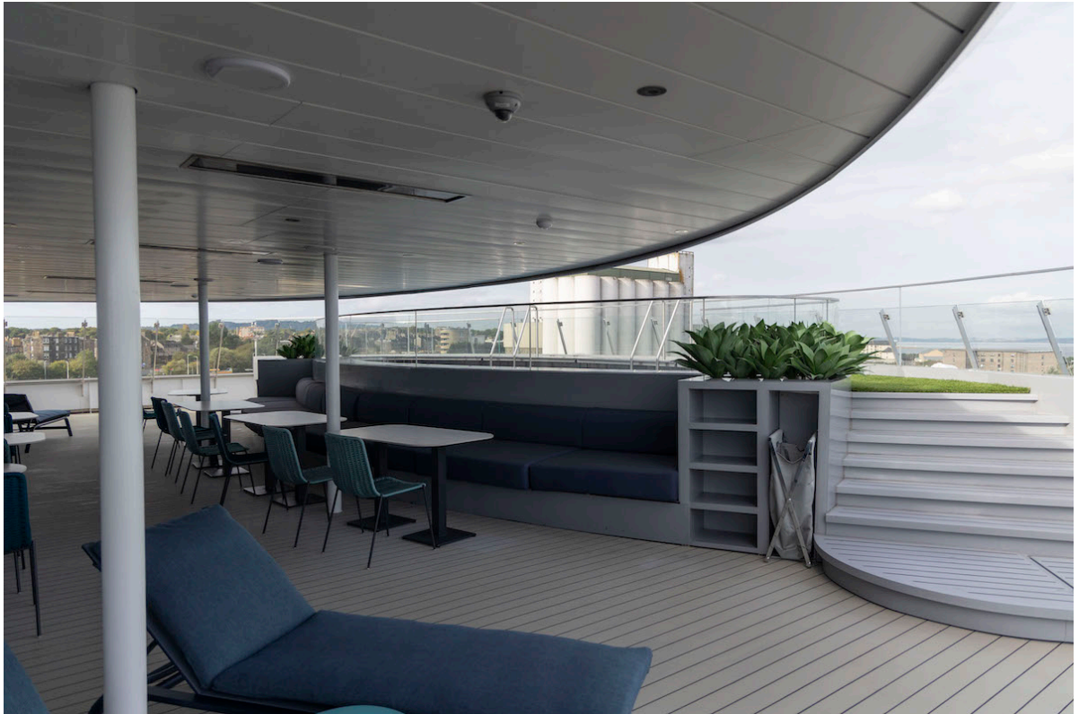
13/09/2023 Luxury Cruising Yacht Scenic Eclipse II at Ocean Terminal Dock Edinburgh.