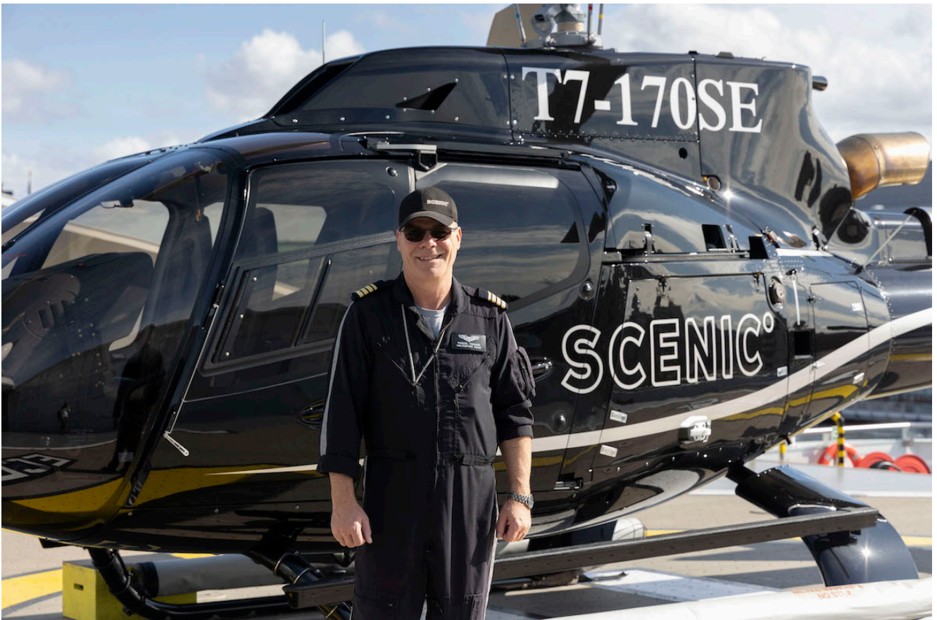
13/09/2023 Luxury Cruising Yacht Scenic