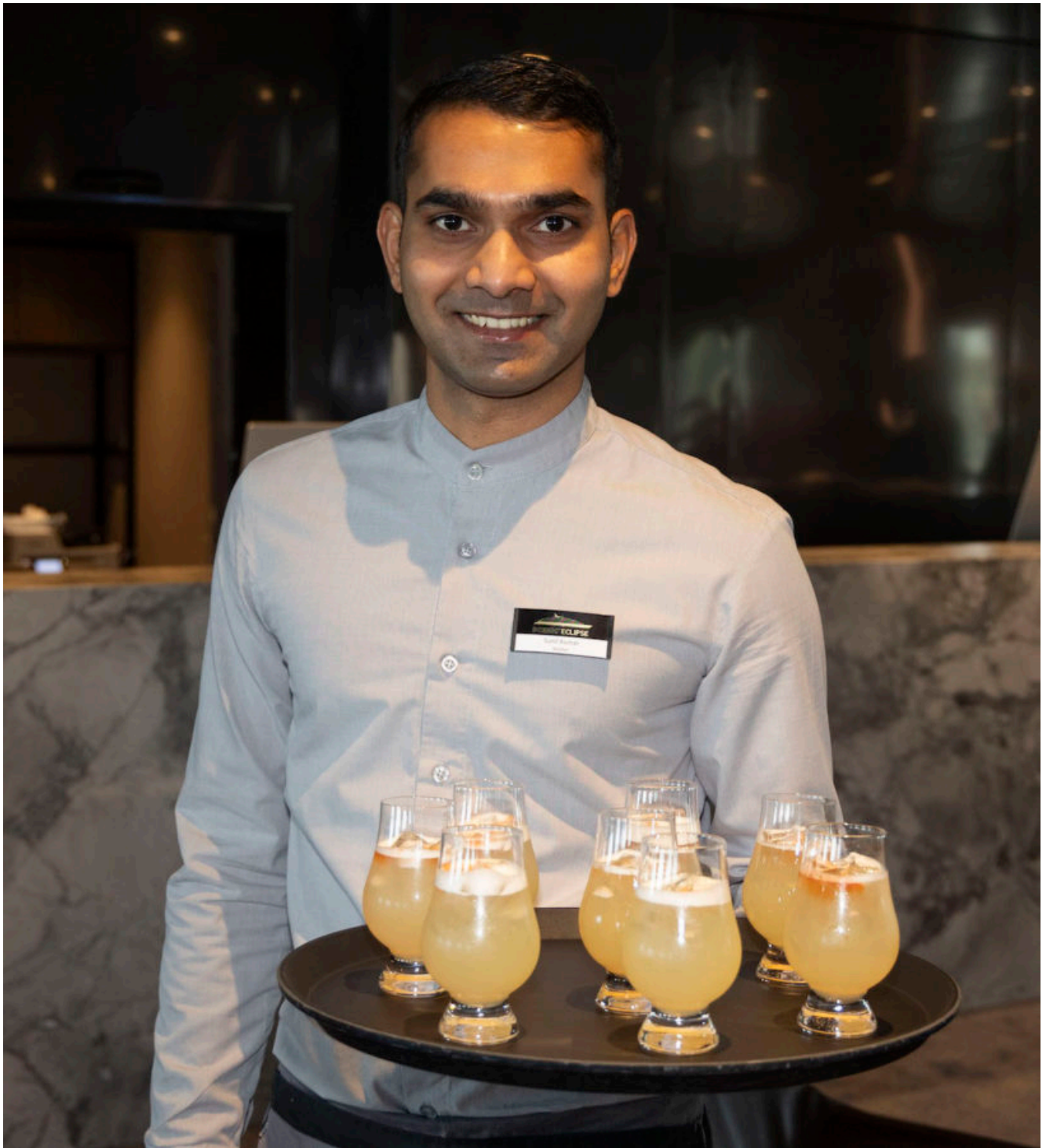
13/09/2023 Luxury Cruising Yacht Scenic Eclipse II at Ocean Terminal Dock Edinburgh. Sunil Kumar Waiter