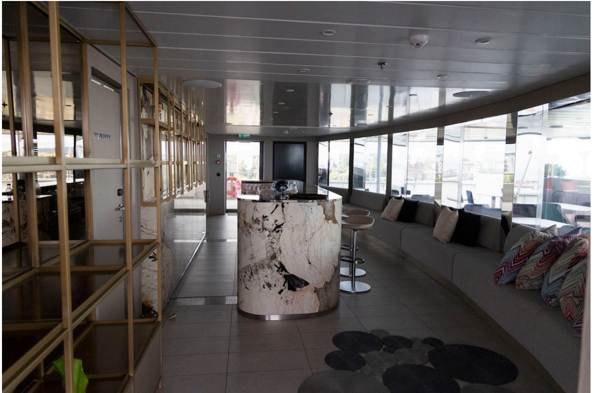
13/09/2023 Luxury Cruising Yacht Scenic Eclipse II at Ocean Terminal Dock Edinburgh.