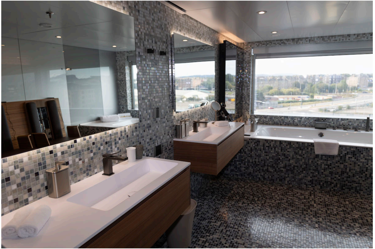
13/09/2023 Luxury Cruising Yacht Scenic Eclipse II at Ocean Terminal Dock Edinburgh.