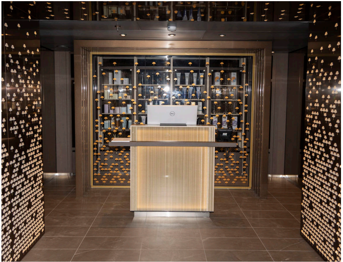
13/09/2023 Luxury Cruising Yacht Scenic Eclipse II at Ocean Terminal Dock Edinburgh.