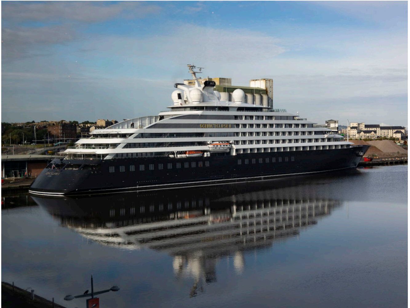
13/09/2023 Luxury Cruising Yacht Scenic Eclipse II at Ocean Terminal Dock Edinburgh.