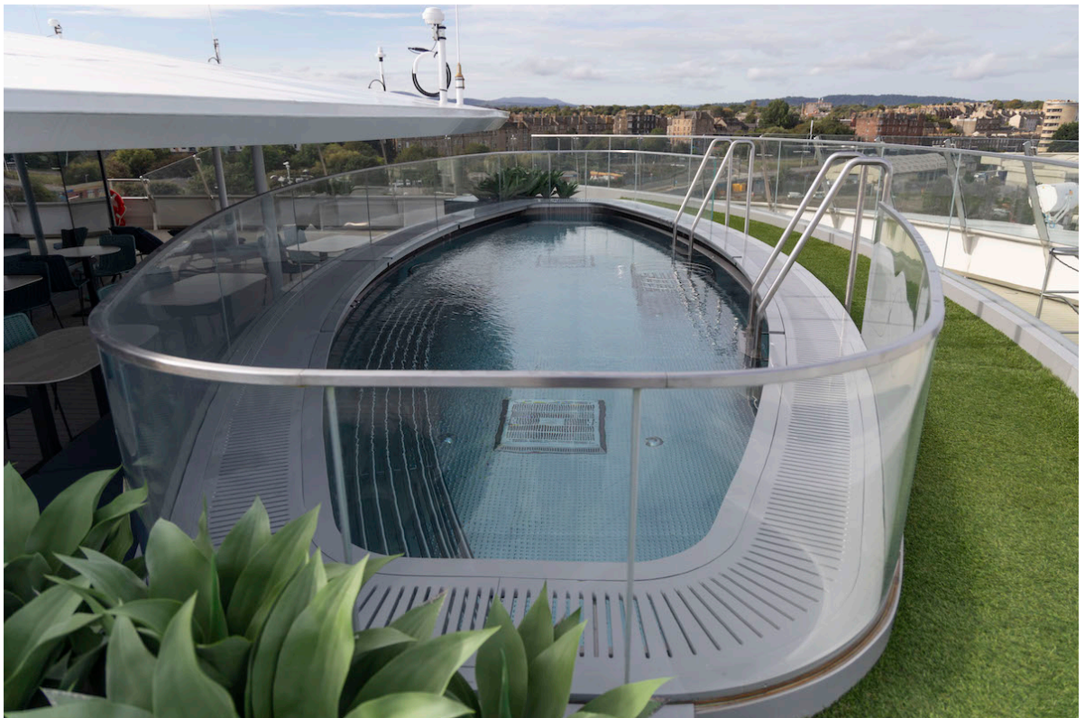
13/09/2023 Luxury Cruising Yacht Scenic Eclipse II at Ocean Terminal Dock Edinburgh.