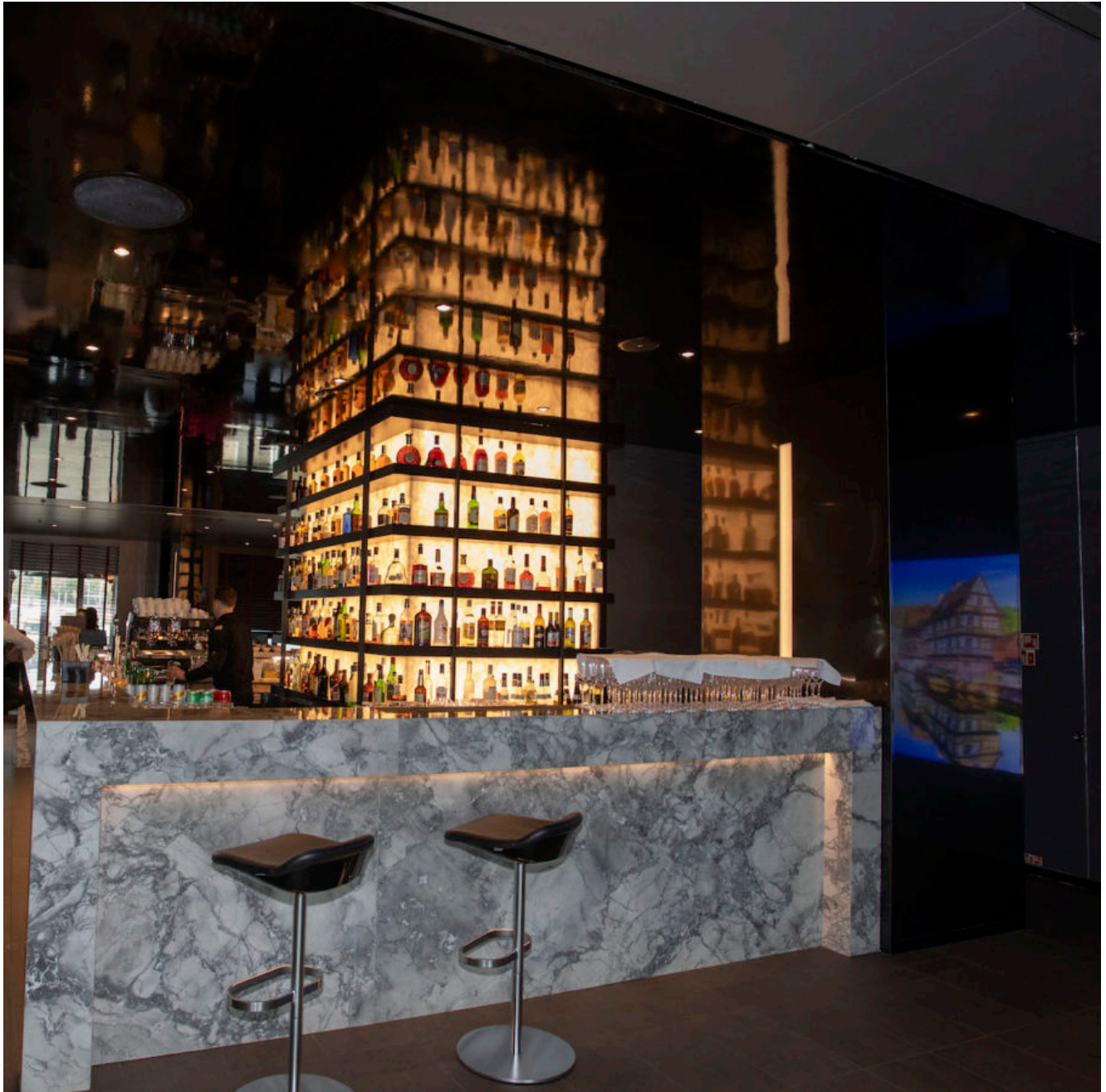
13/09/2023 Luxury Cruising Yacht Scenic Eclipse II at Ocean Terminal Dock Edinburgh. Bar

The Scottish Isles, Historic Trails and Wilderness Voyage will stop at Aberdeen, St Kilda, Stromness and Fort William.