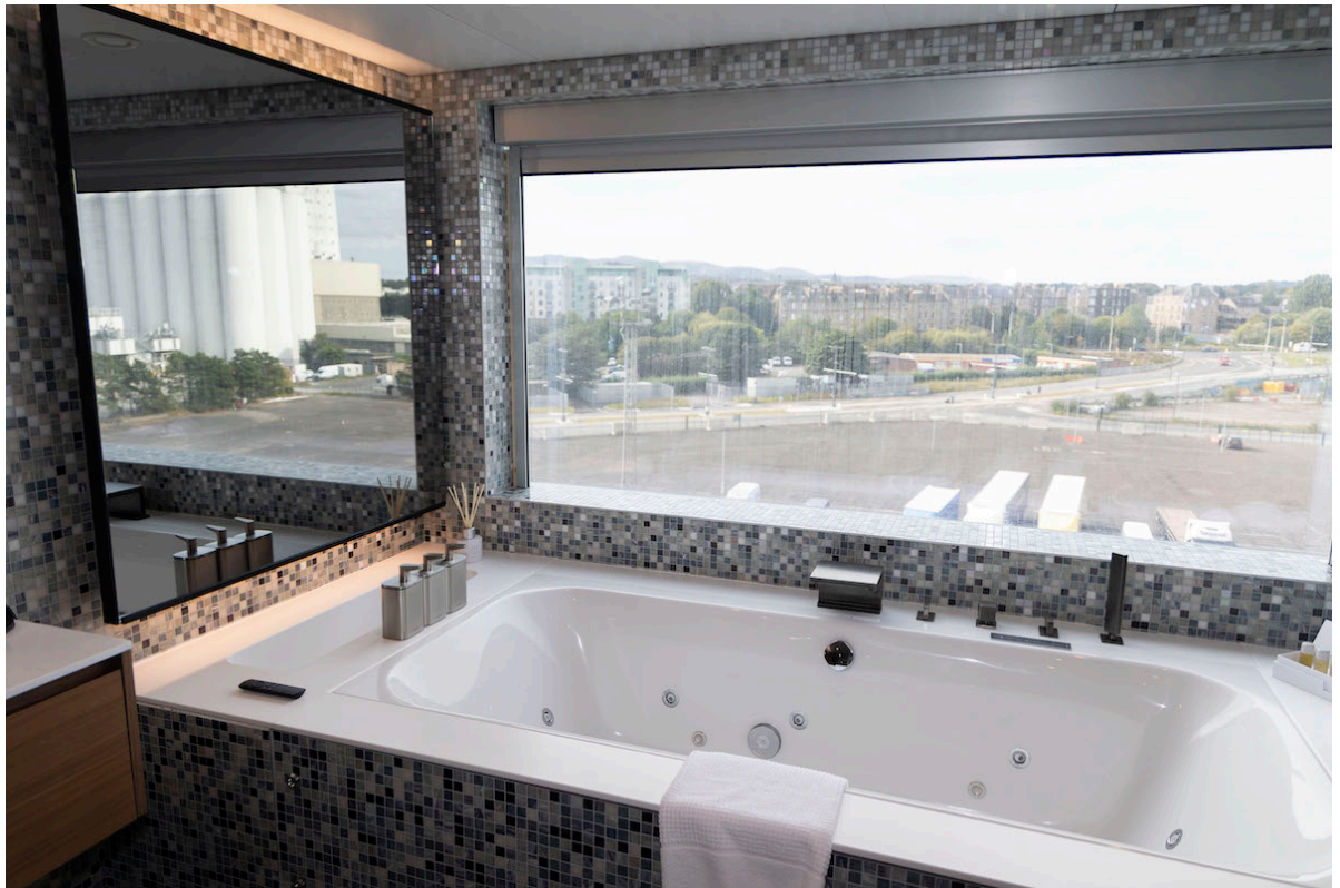
Owner's suite 13/09/2023 Luxury Cruising Yacht Scenic Eclipse II at Ocean Terminal Dock Edinburgh.