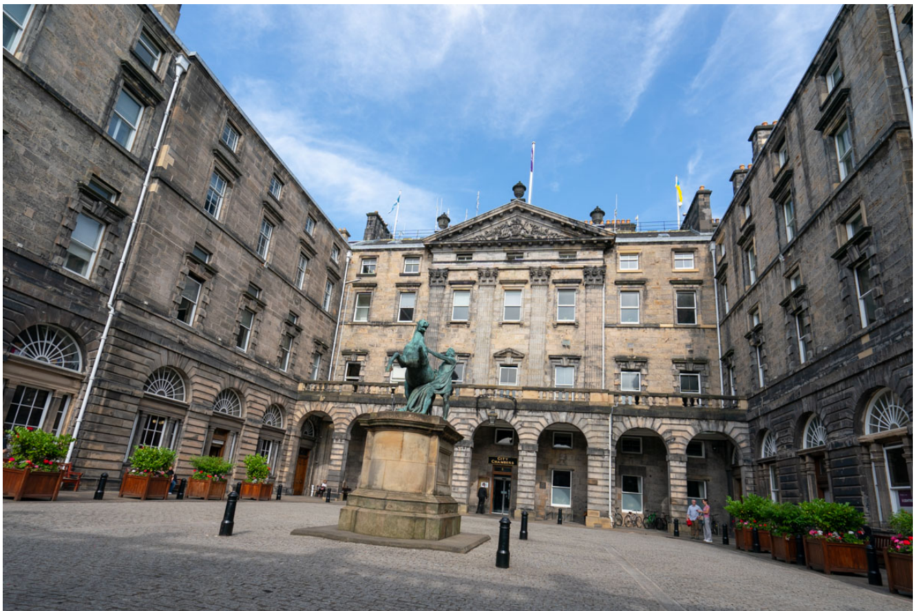
Edinburgh City Chambers.

Read the council papers and Watch the Finance Committee here.