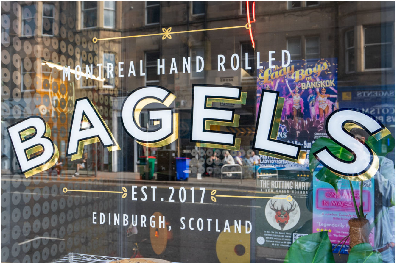
Bross Bagels Bruntsfield