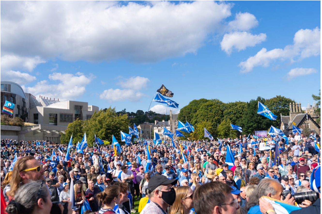
Believe in Scotland Rally 2 September 2023