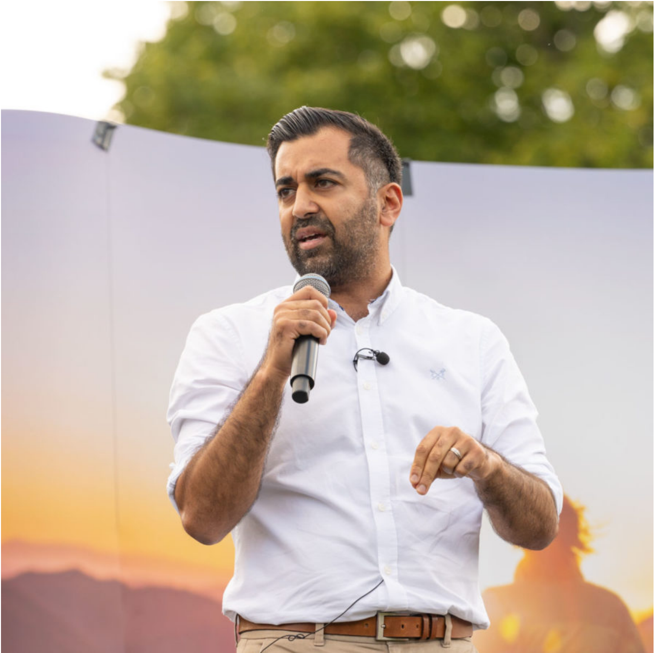
Humza Yousaf speaking at the Believe in Scotland rally