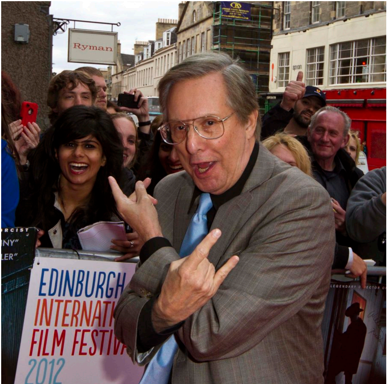
6//08/2023 William Friedkin Director of the Exorcist has died aged 87. Pictured with his wife Sherry Lansing in June 2012