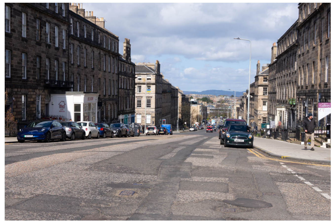
Looking down Dundas Street