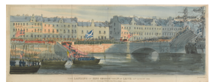
15th The Scott Monument