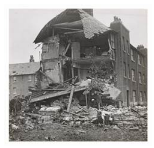
6th - Craigentinny

3 August Picture shows the original North Bridge during dismantling circa 1896