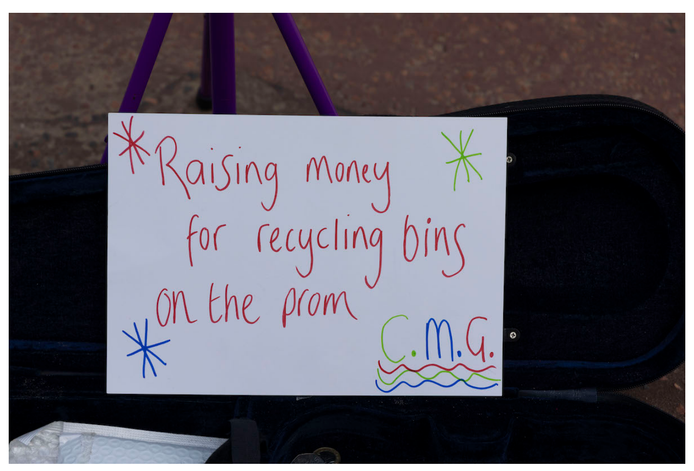
26/08/2023 Big Beach Busk Portobello Beach.