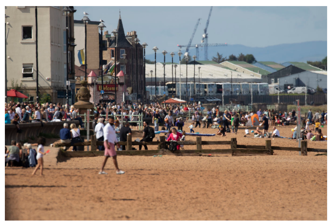
26/08/2023 Big Beach Busk Portobello Beach.