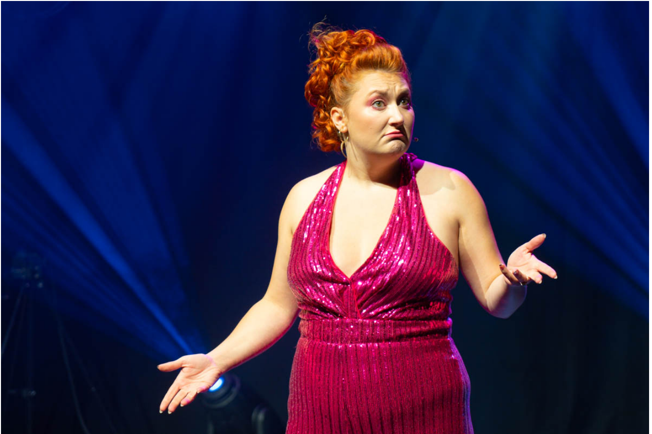
Pleasance launch