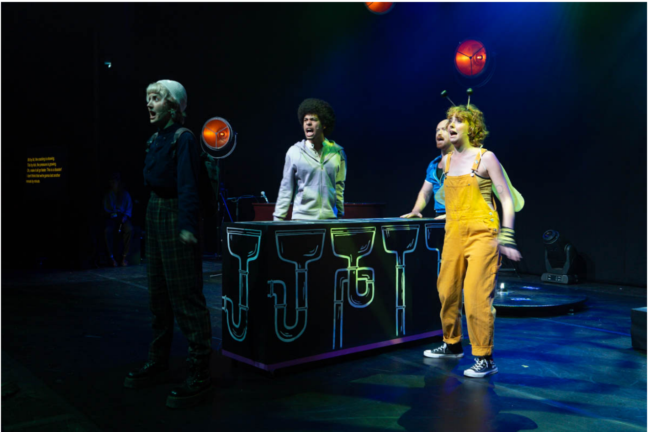
Public – The Musical Pleasance launch 5 August 2023