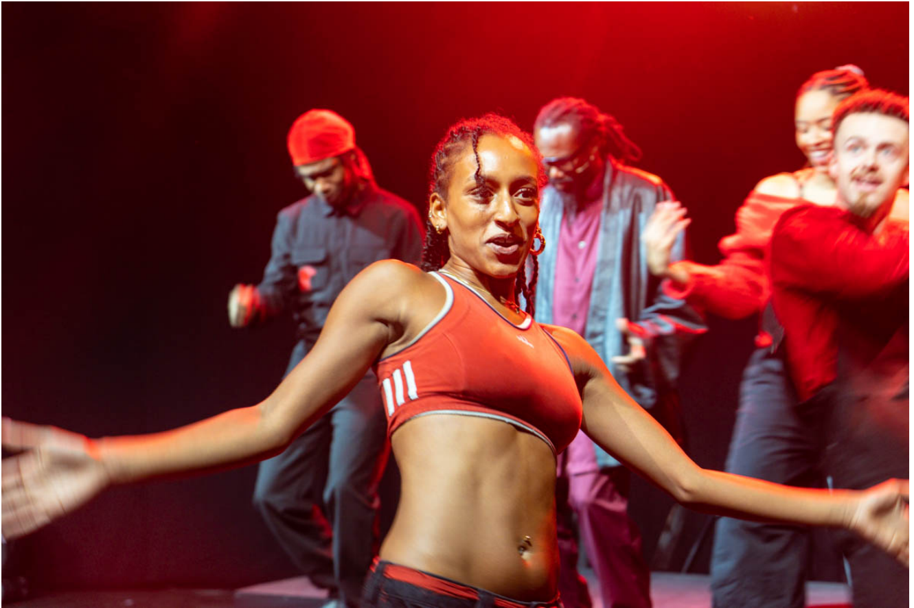
Pleasance launch