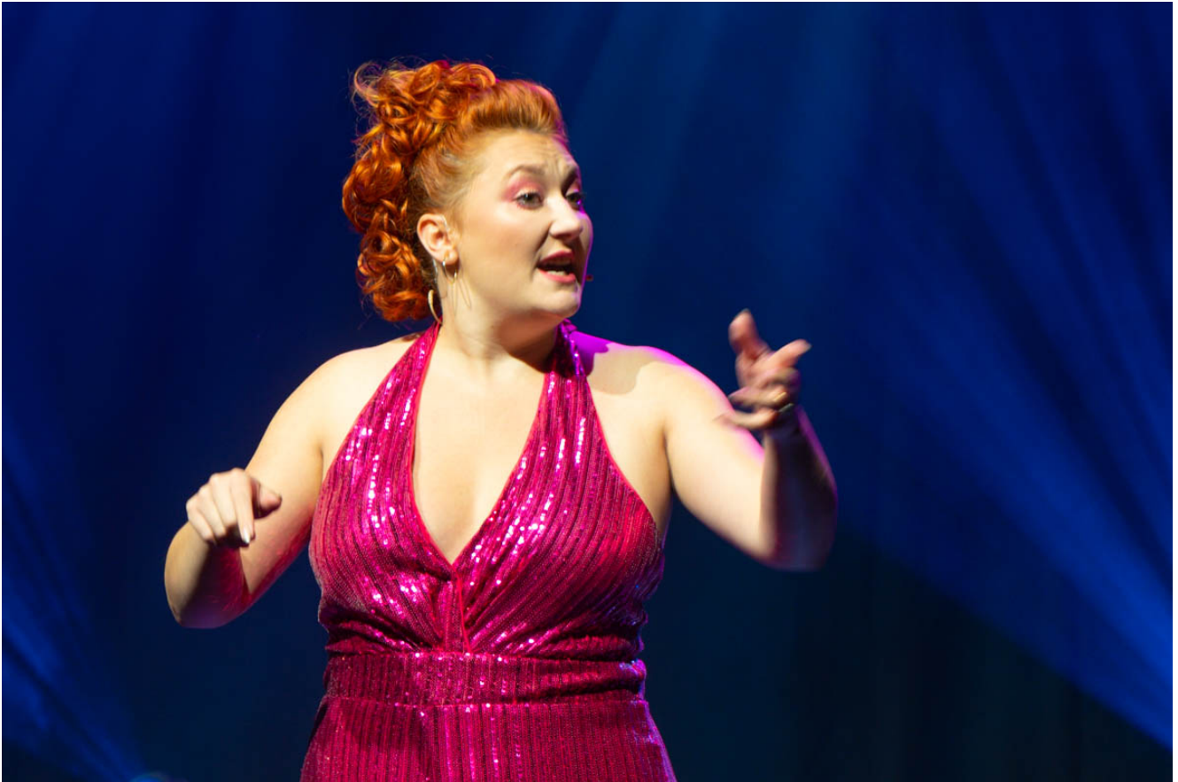
Flat & the Curves Pleasance launch 5 August 2023

The Chortle Award 2023 finalist, Flat and the Curves, bring you their glittery comedy cabaret of unbridled fun in Divadom! The comedy quartet delivers their self-penned songs celebrating sex and sisterhood in a bra-burning evening of mischief.