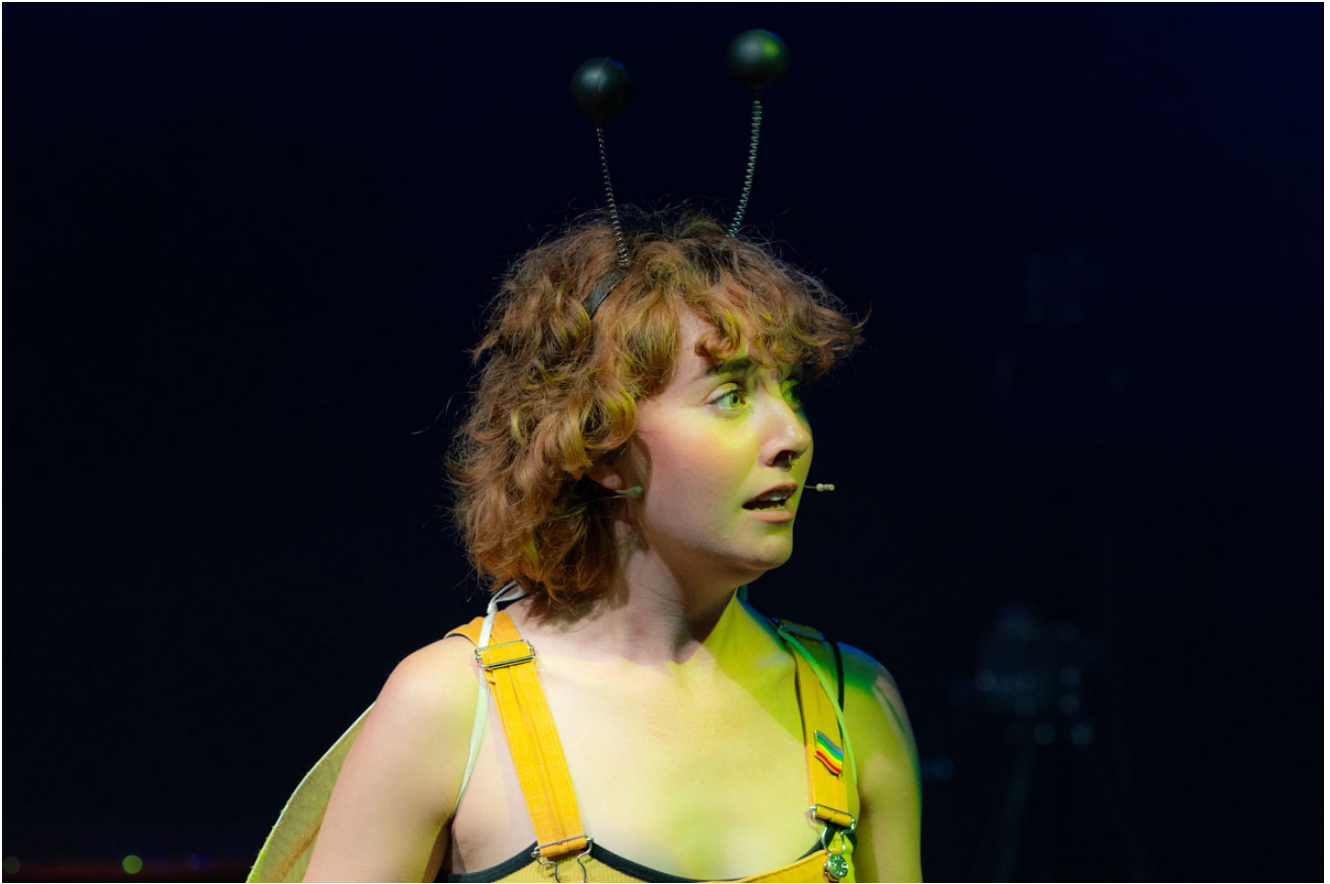
Public The Musical – why are you dressed like a bee?