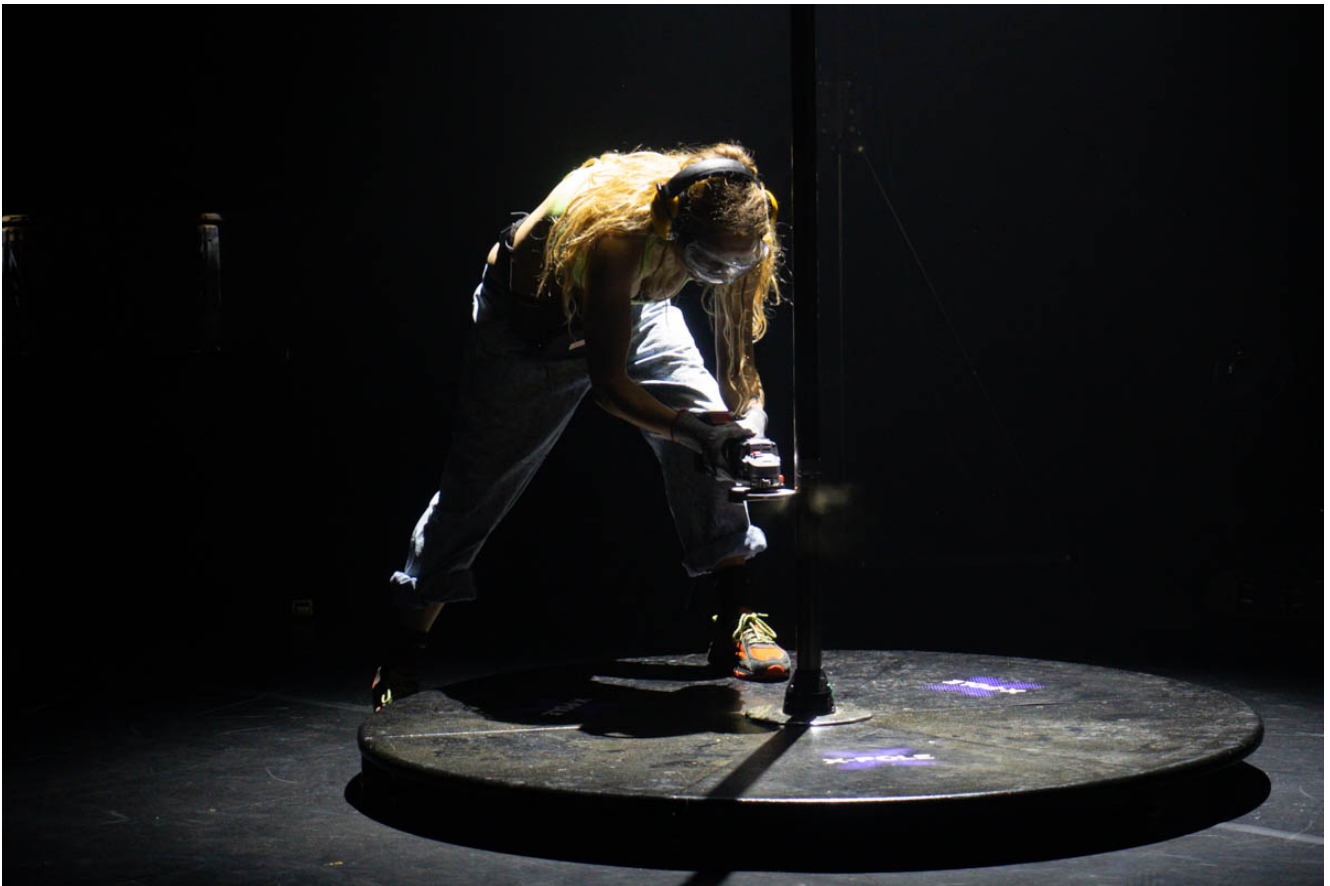
Pleasance launch