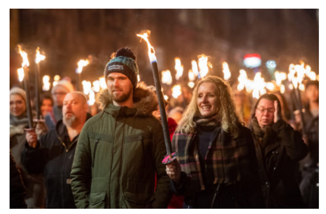
Edinburgh Hogmanay Torchlight Procession