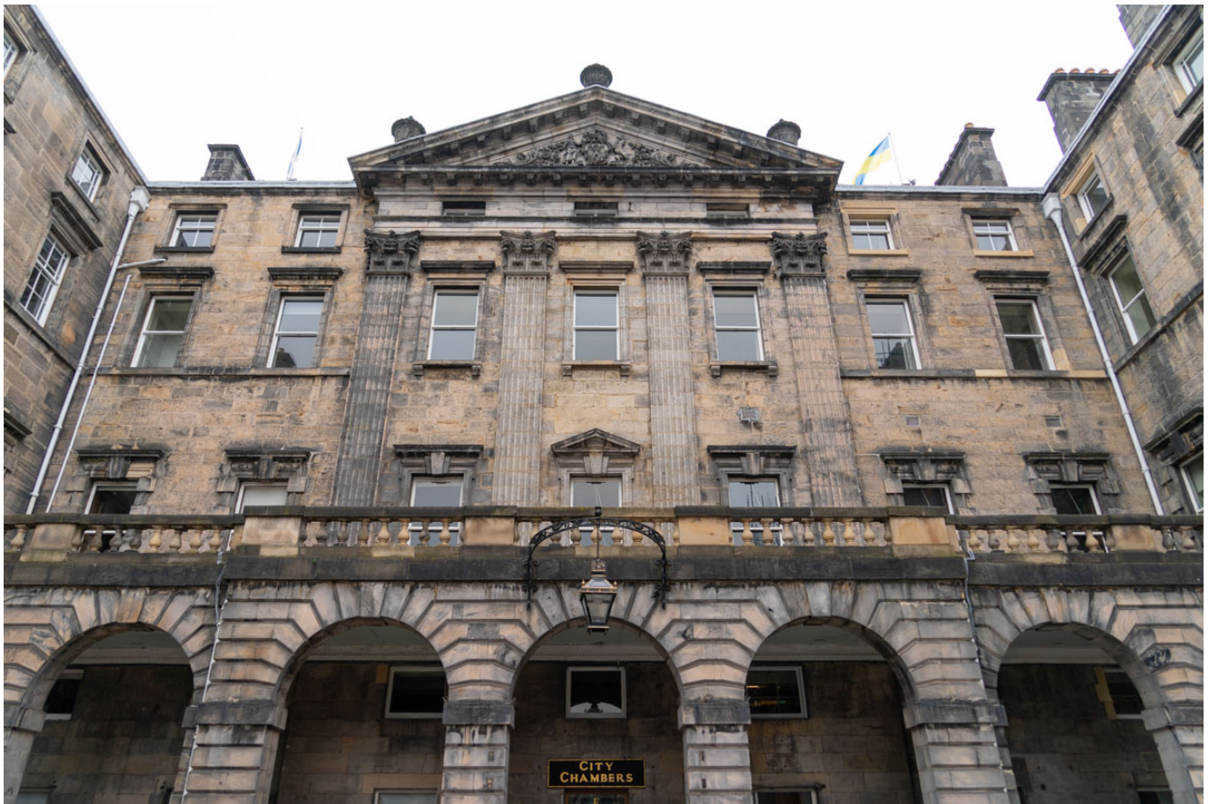
Edinburgh City Chambers.

All papers for the council meeting are here.