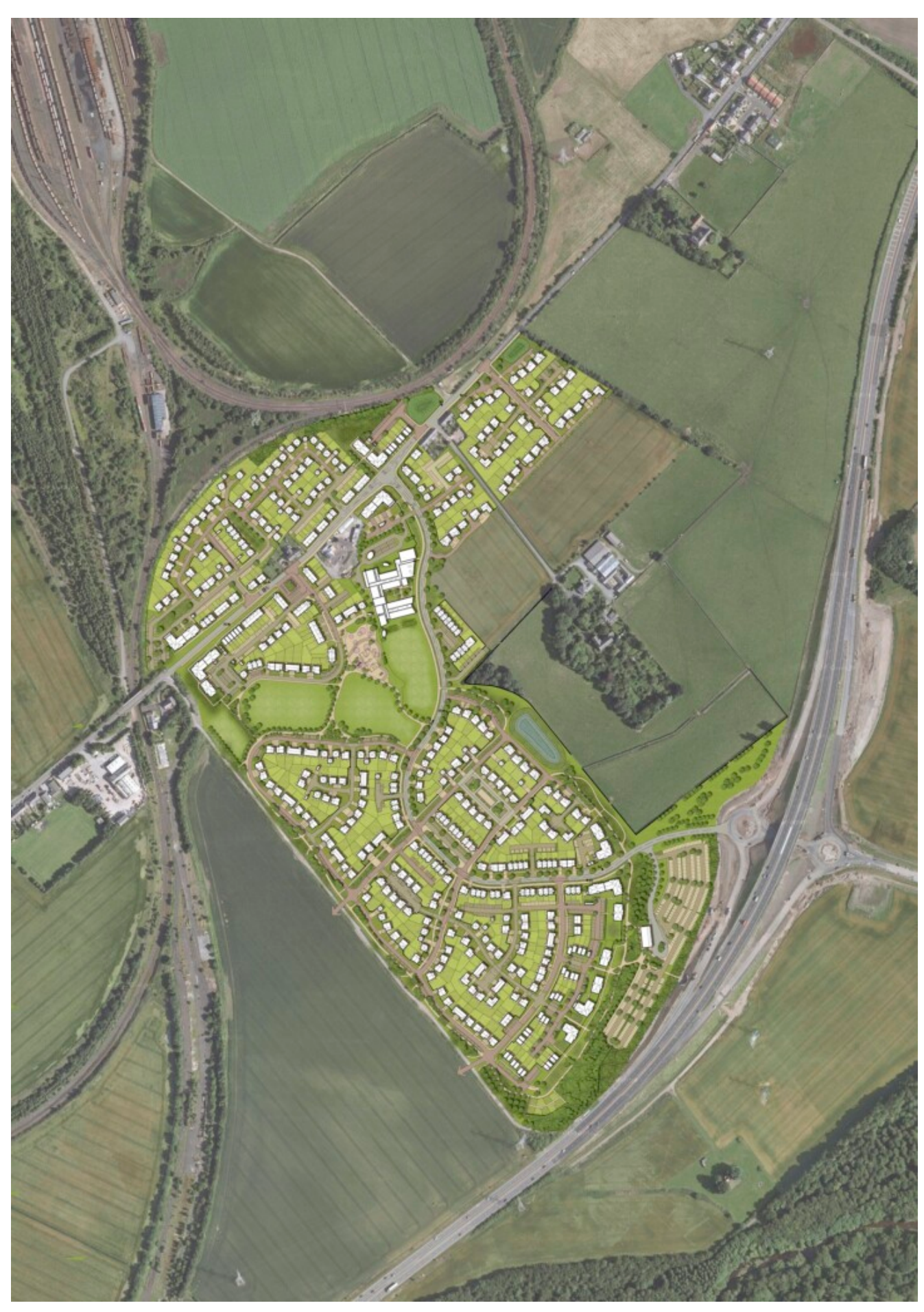
Old Craighall Road will undergo reconstruction as part of developer {\hbox{\tt Cala}} Homes' new 620-home site on land at Newton and