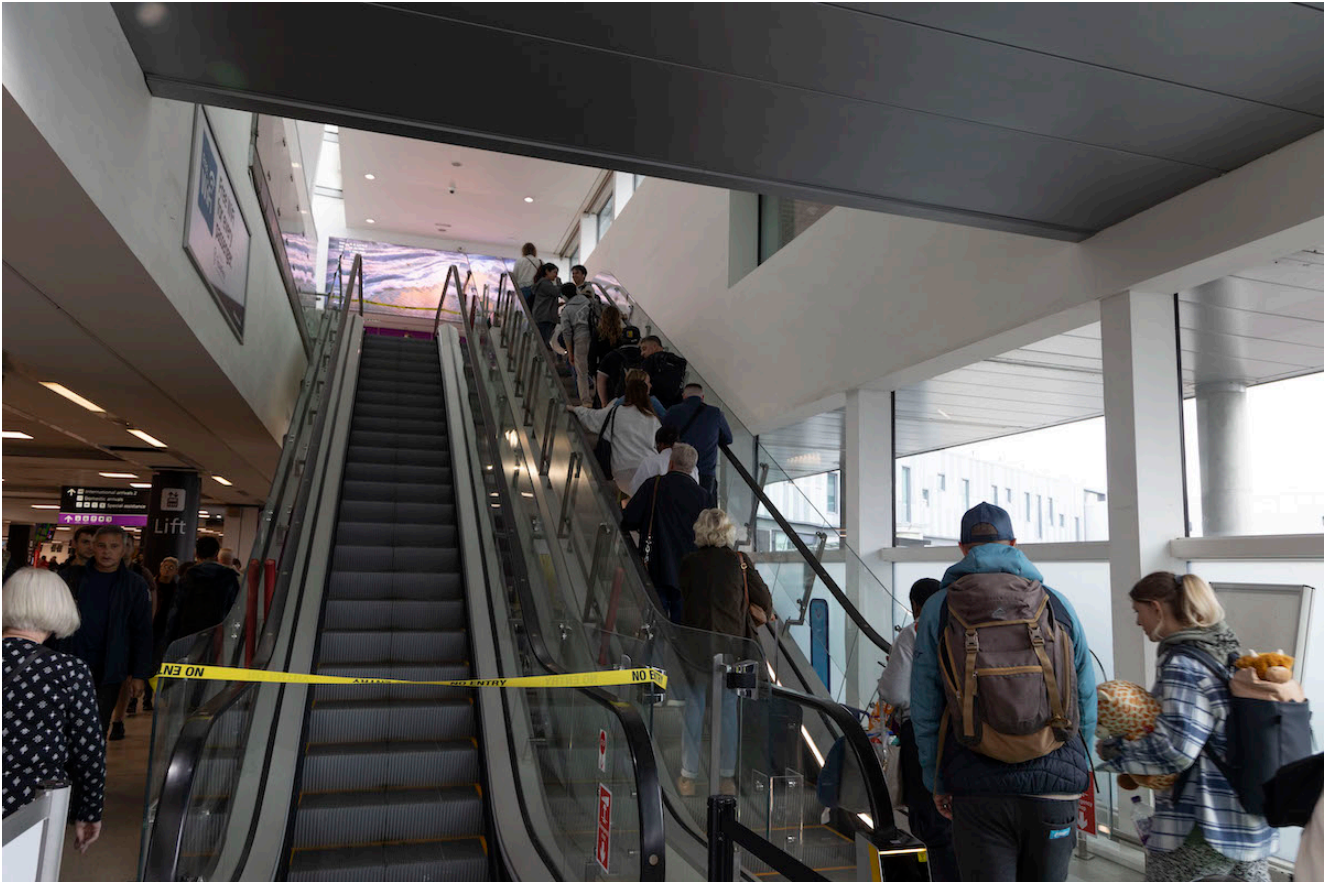
28/08/2023 Edinburgh Airport Air traffic control problems UK wide.