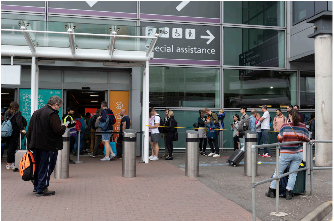
28/08/2023 Edinburgh Airport Air traffic control problems UK wide.