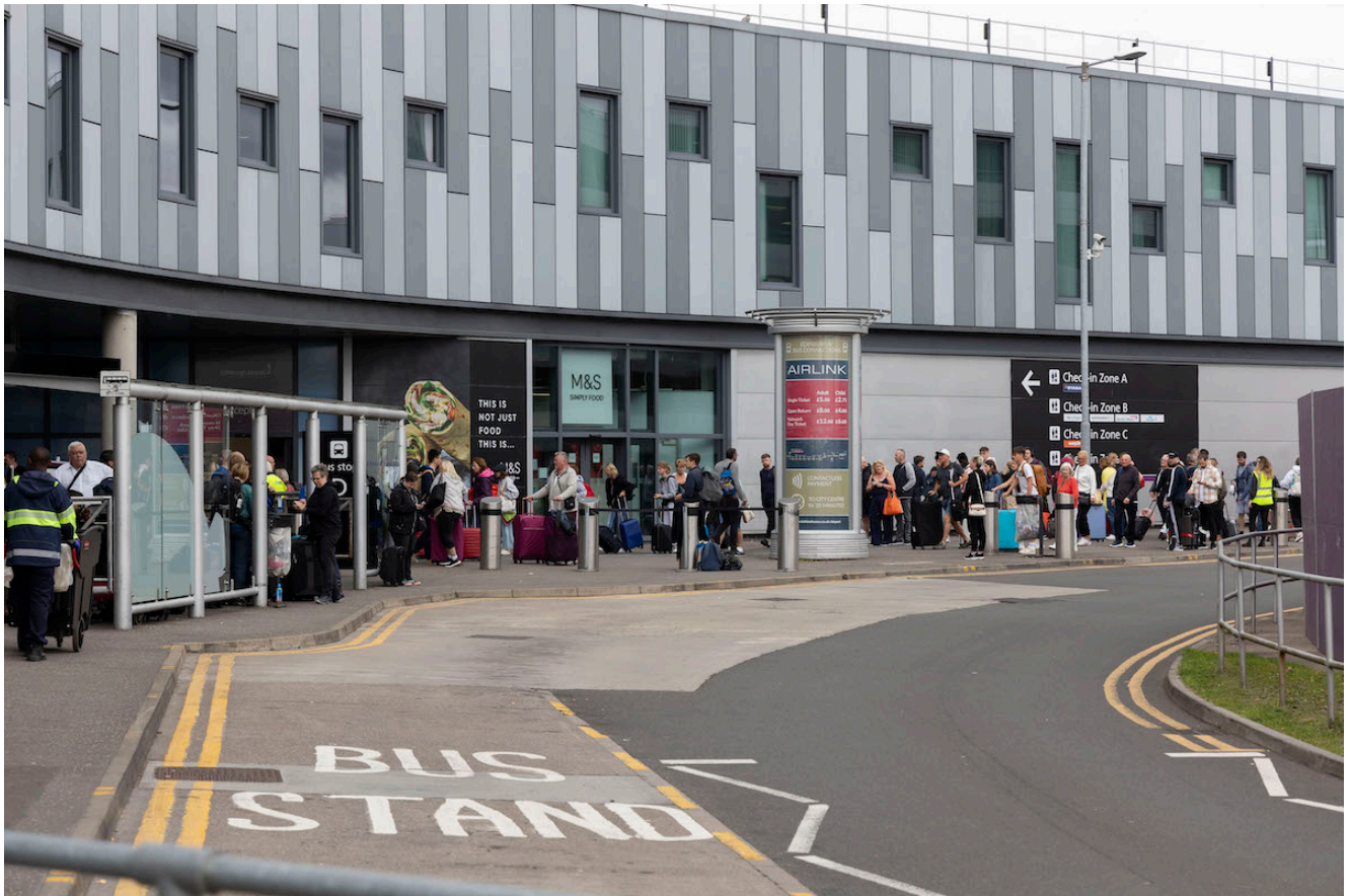
28/08/2023 Edinburgh Airport Air traffic control problems UK wide.