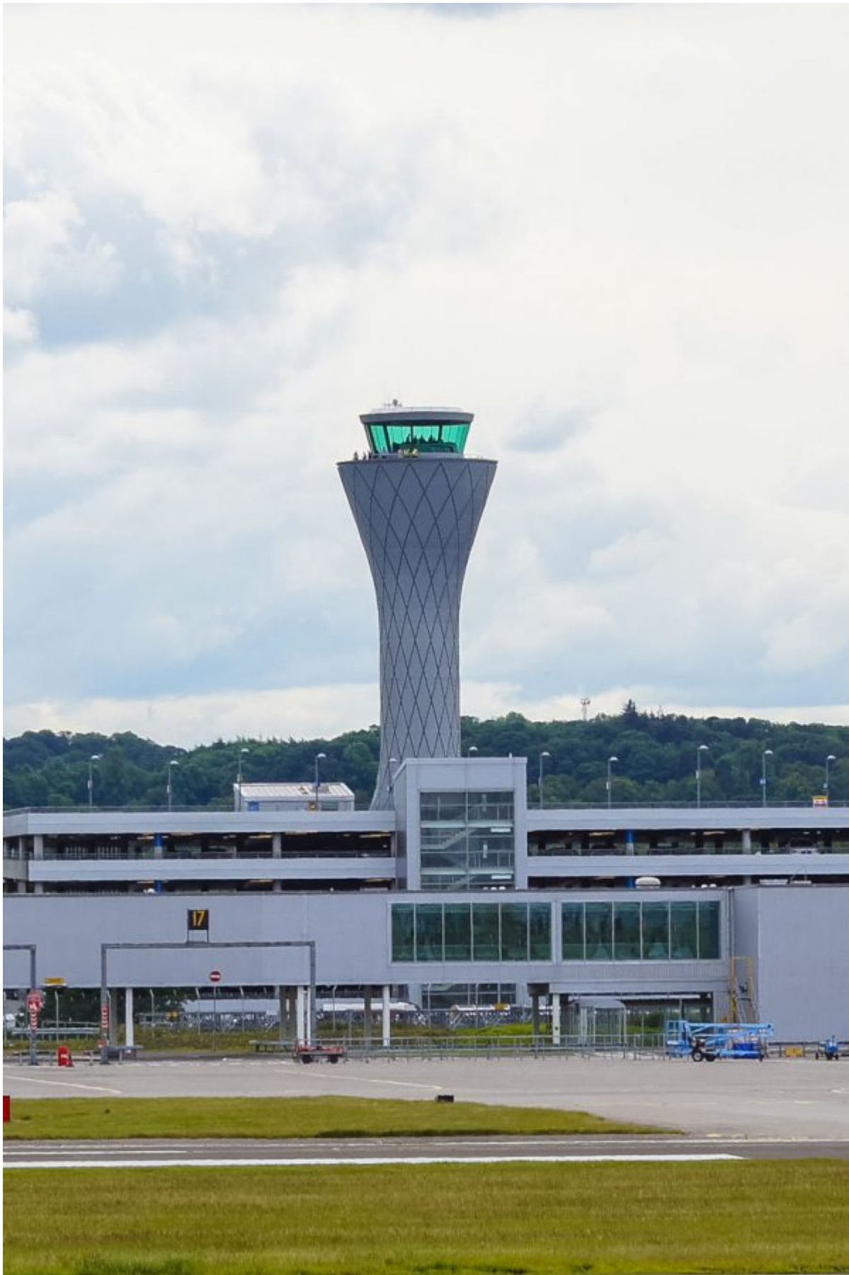
Edinburgh Airport.