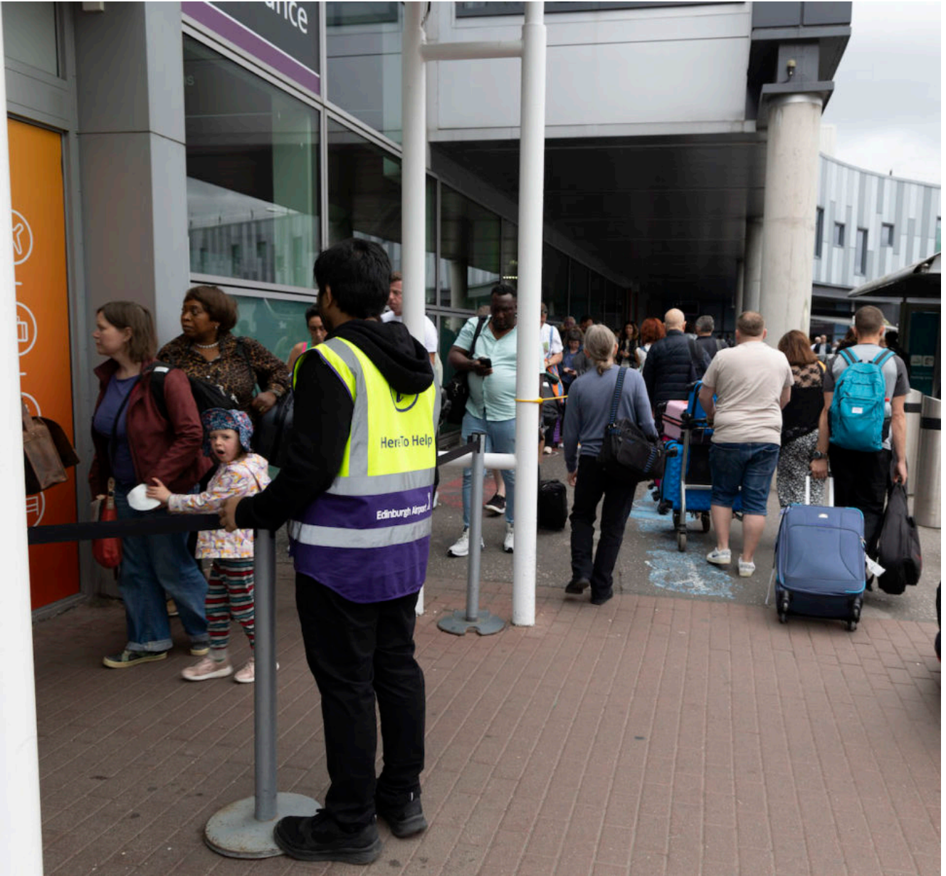
28/08/2023 Edinburgh Airport Air traffic control problems UK wide.