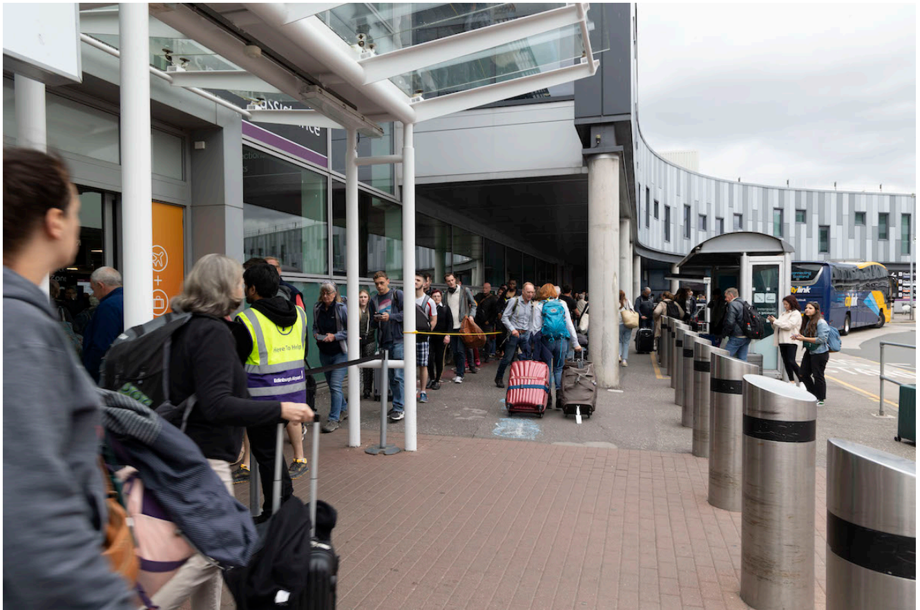
28/08/2023 Edinburgh Airport Air traffic control problems UK wide.