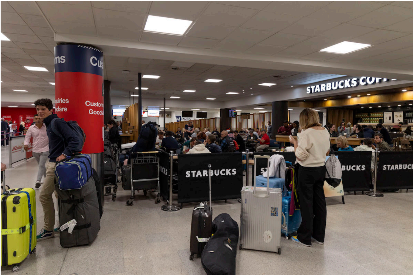
28/08/2023 Edinburgh Airport Air traffic control problems UK wide.