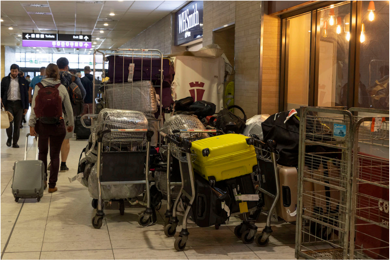
28/08/2023 Edinburgh Airport Air traffic control problems UK wide.