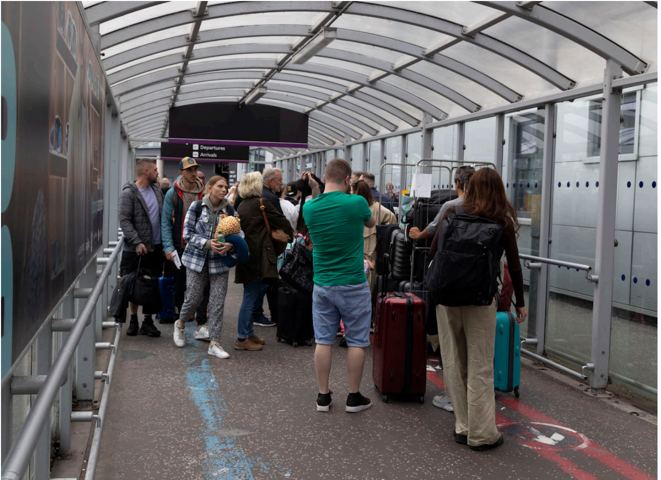
28/08/2023 Edinburgh Airport Air traffic control problems UK wide.