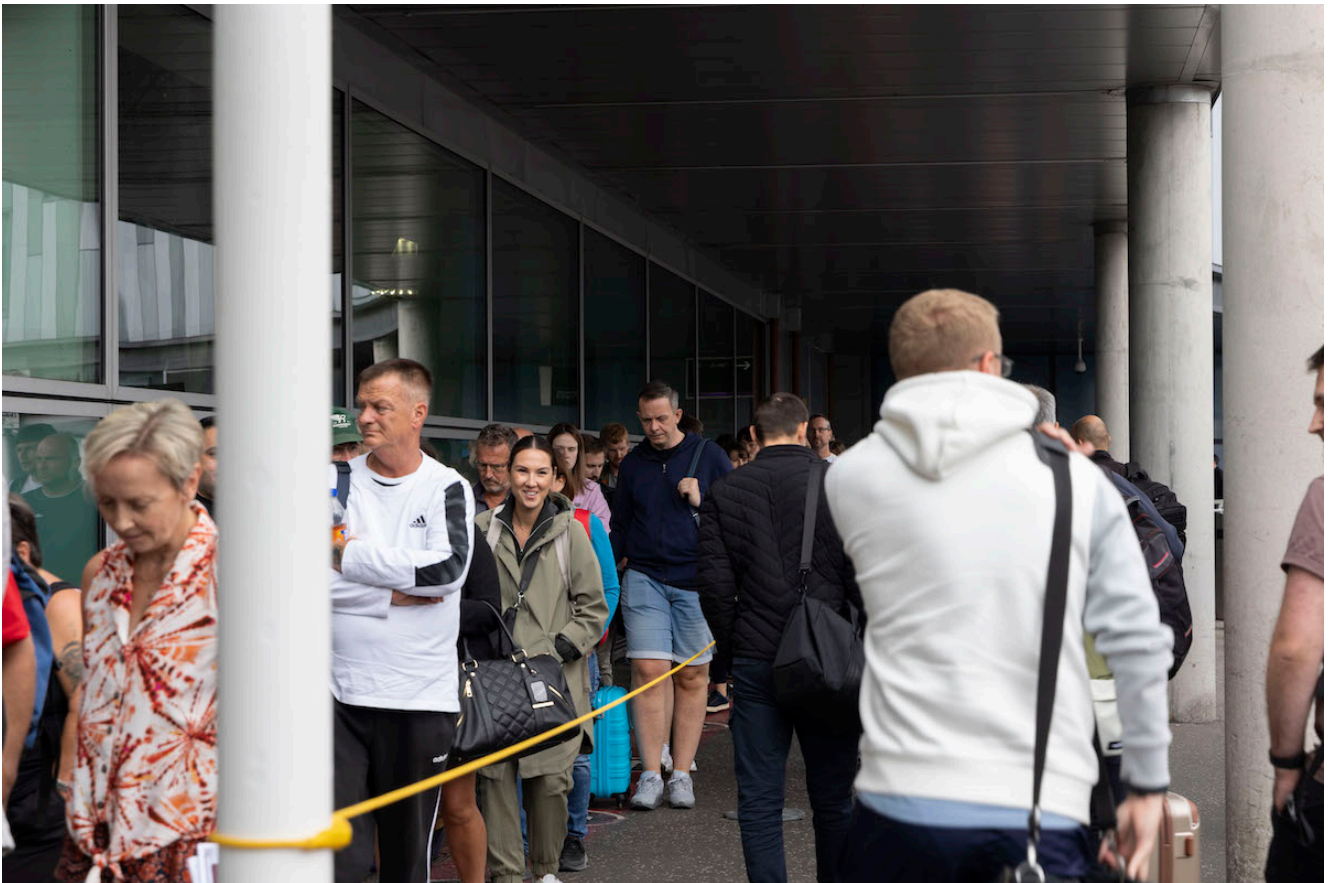
28/08/2023 Edinburgh Airport Air traffic control problems UK wide.