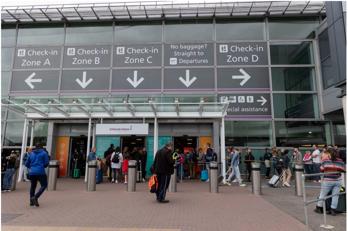
28/08/2023 Edinburgh Airport Air traffic control problems UK wide.