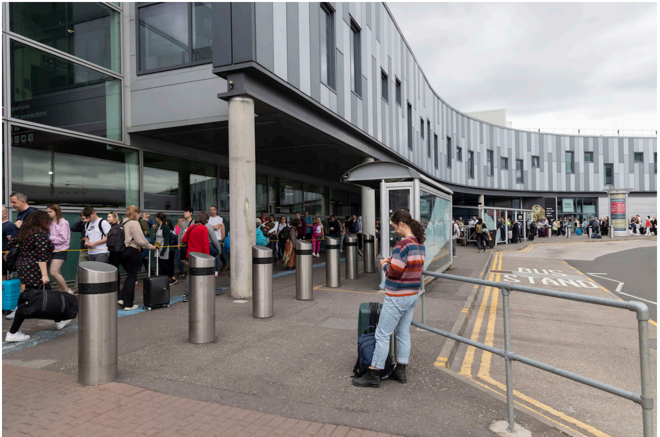
28/08/2023 Edinburgh Airport Air traffic control problems UK wide.