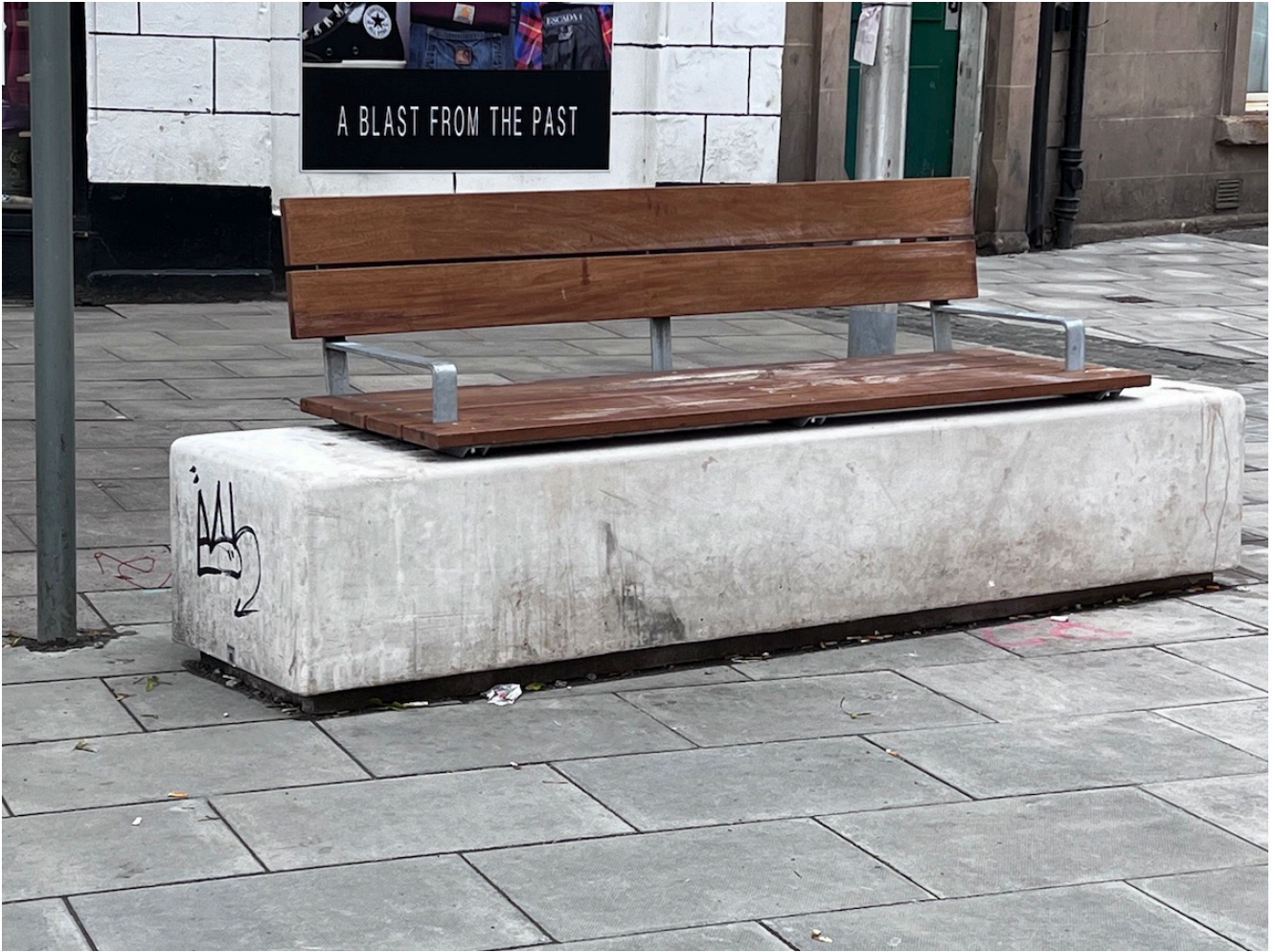
Bench on Iona Street