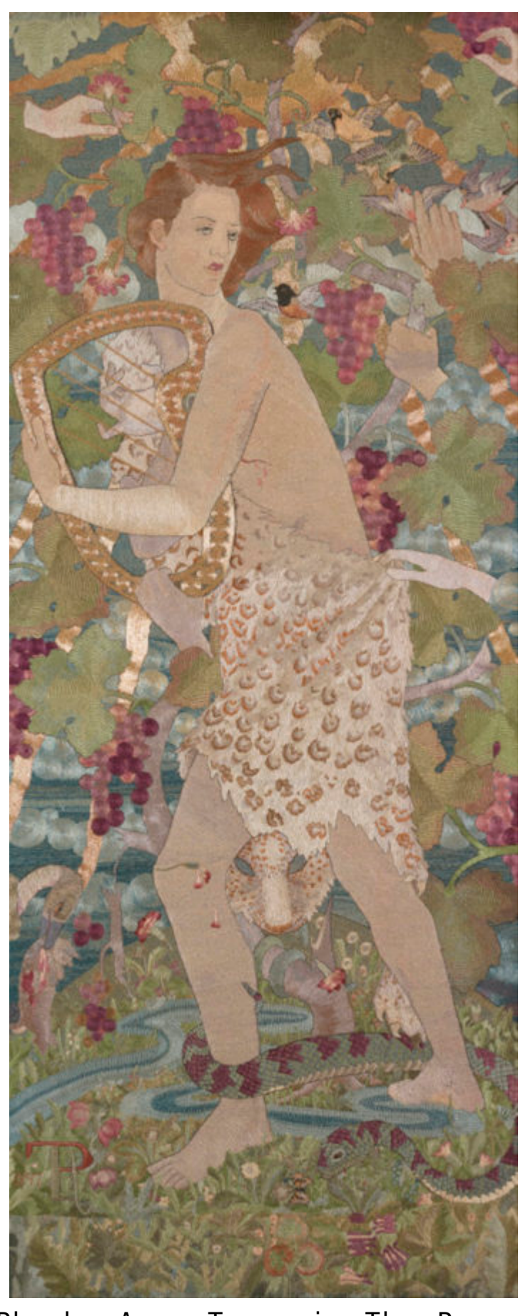
Phoebe Anna Traquair The Progress of a Soul The Stress. National Galleries of Scotland