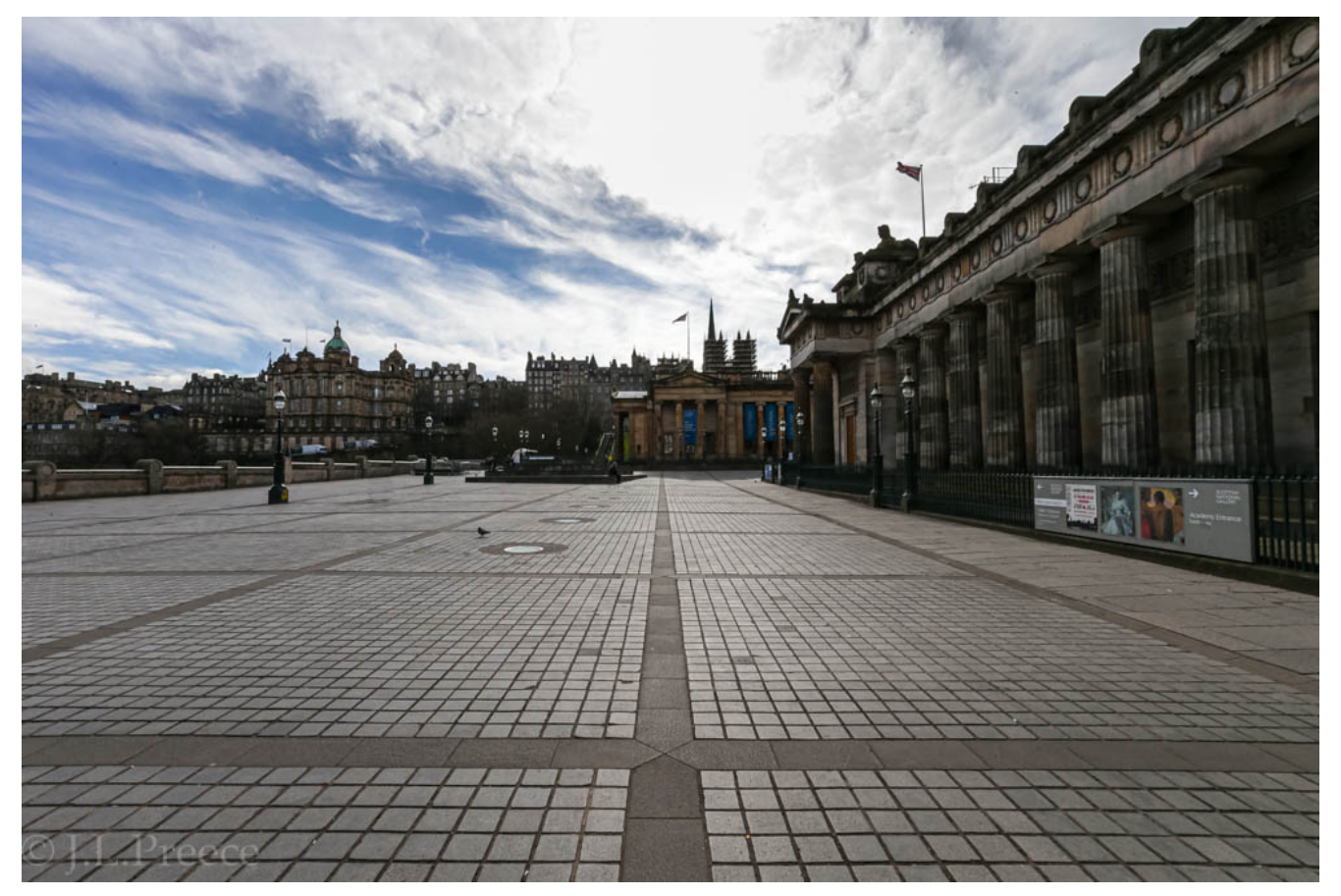
The Mound Precinct off Princes' Street photographed in 2020