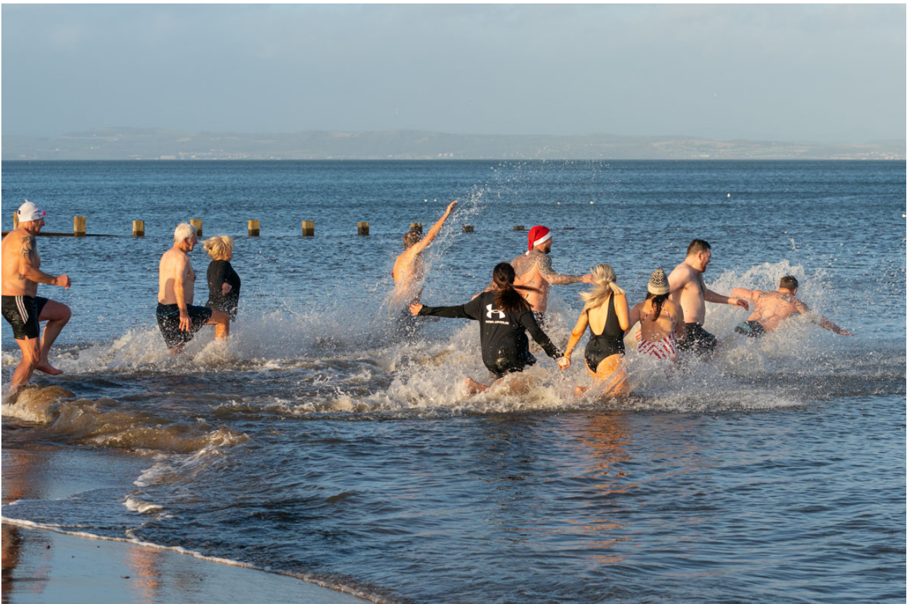
Portobello New Years' Day 2022

SEPA say that they will issue an update on the position about swimming in the sea “as and when necessary” – but no update has been made yet.