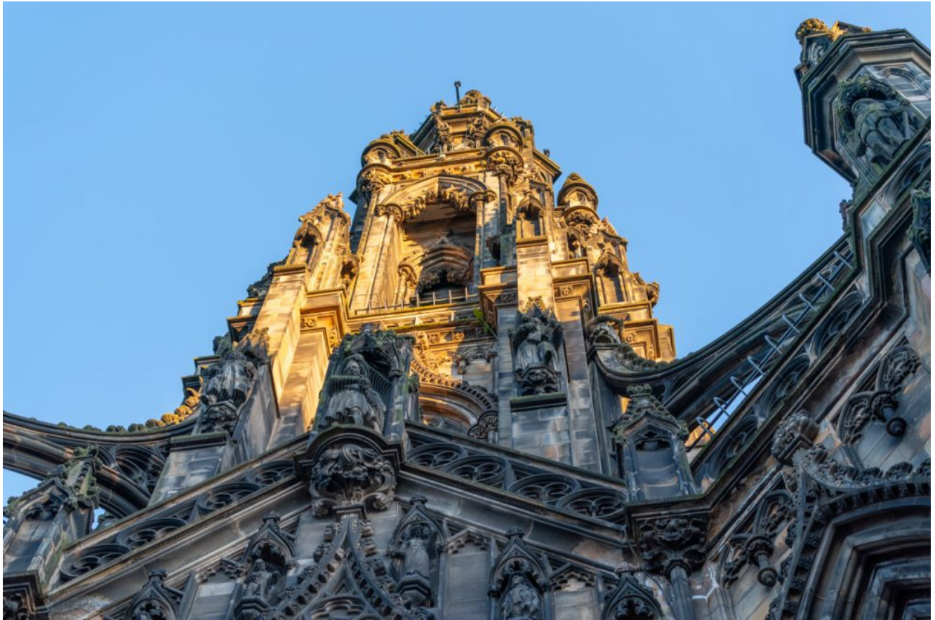
Scott Monument.