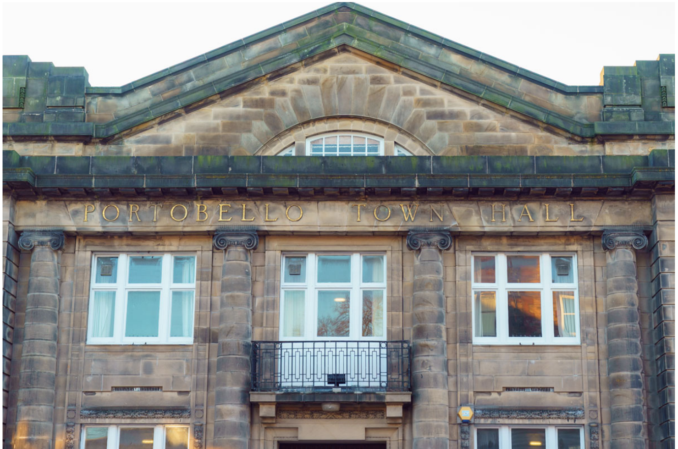
Portobello Town Hall.