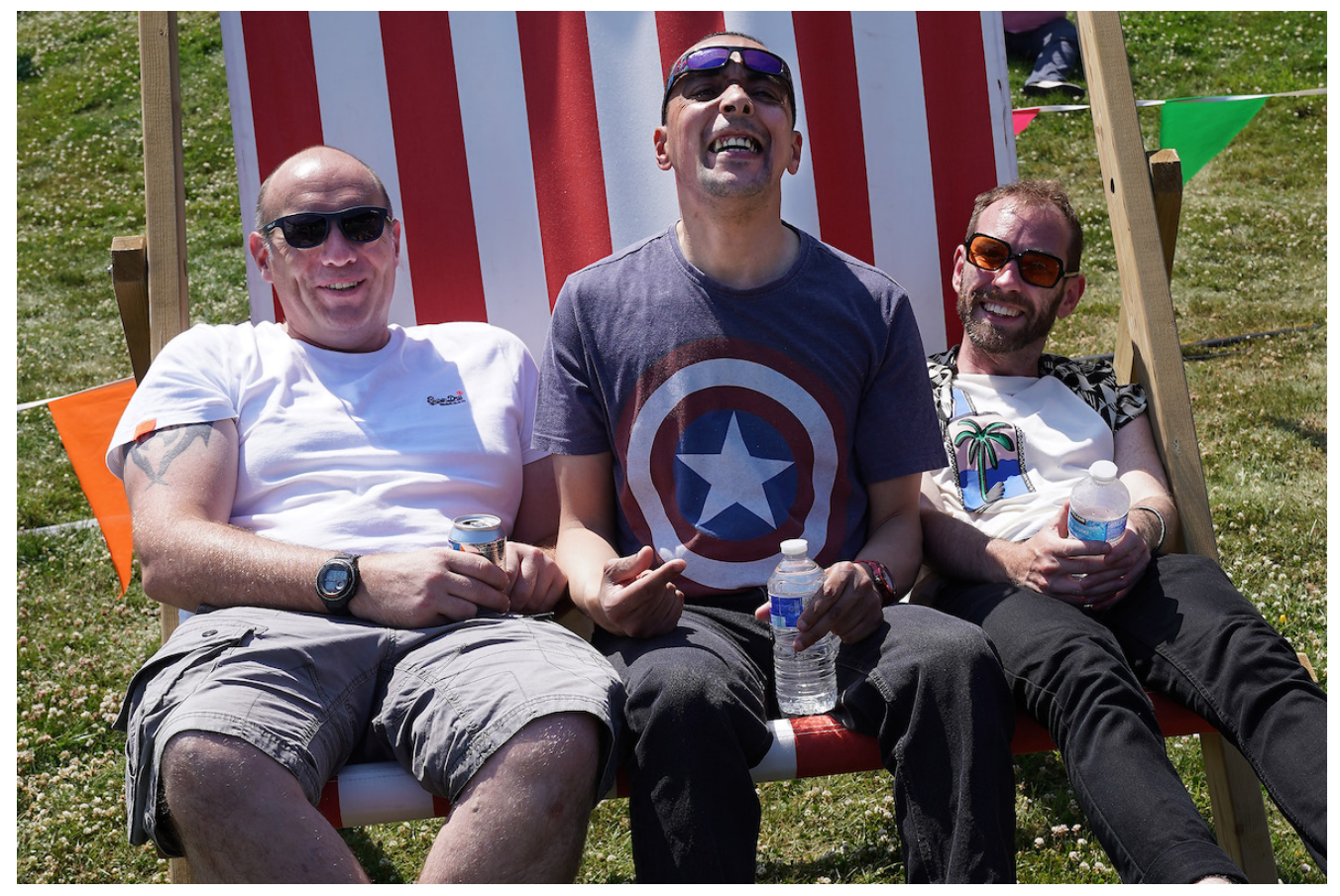
CarrGomm 25th Birthday 1 SA : CarrGomm 25th Birthday Celebrations.