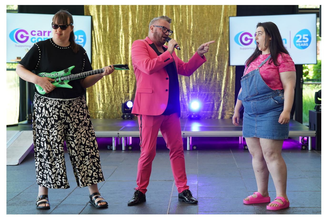
CarrGomm 25th Birthday 1 SA : CarrGomm 25th Birthday Celebrations.

The goal to provide places and opportunities where people can connect with others in their community and feel supported, is the driving force behind their <u>Big Carr Gomm Challenge</u> <u>fundraiser</u>. The charity is over quarter of the way to its £25,000 target to fund activities like music workshops, games groups, days out, and community gardens.