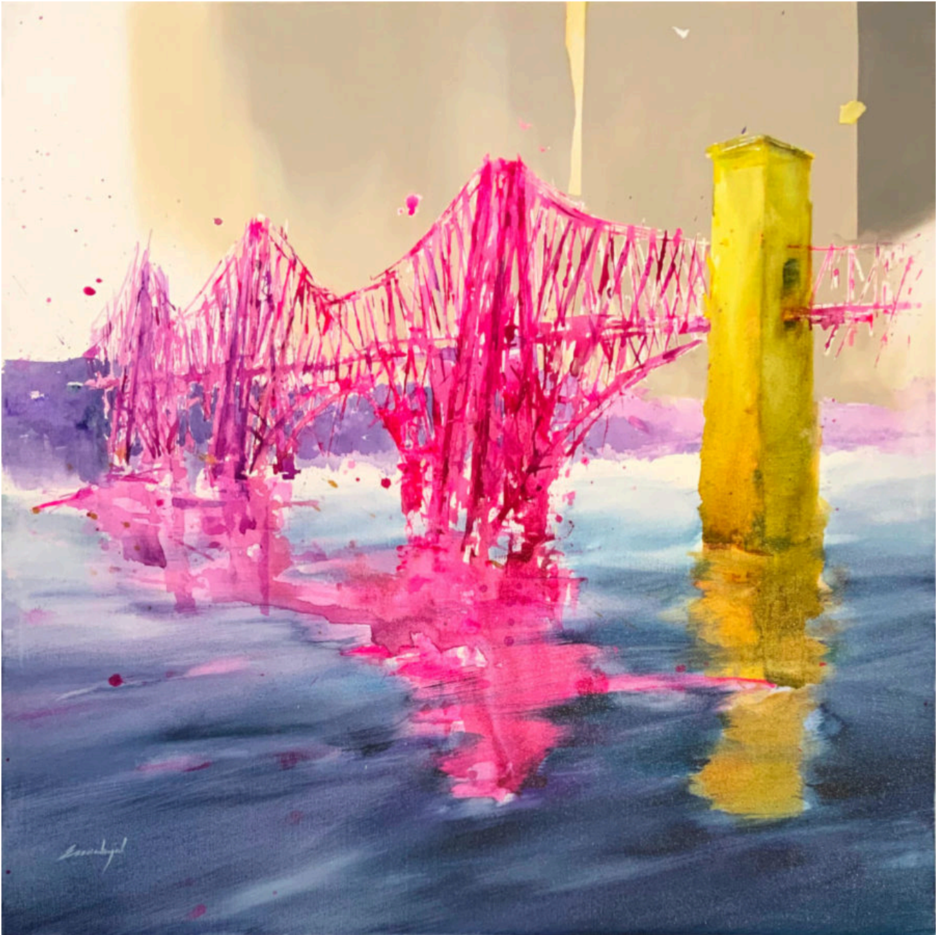
DES Headed Home 120×120 3250