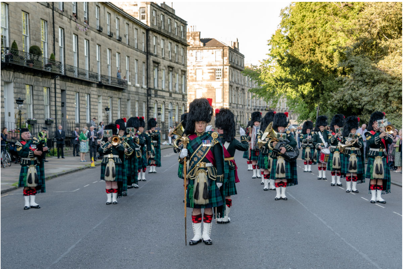
Band of the Royal Regiment of Scotland.

The ceremony is based in the early years of organised warfare when the beating of drums and parading of Post Guards heralded the closing of camp gates and lowering of flags. The ceremony also takes place on Horse Guards Parade each year for two successive evenings in June when the salute is taken by a member of the Royal Family.