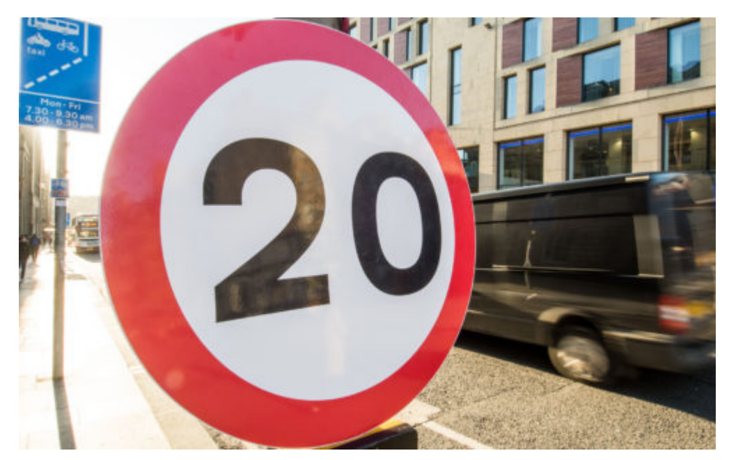
20mph is a part of the transport policy in the city