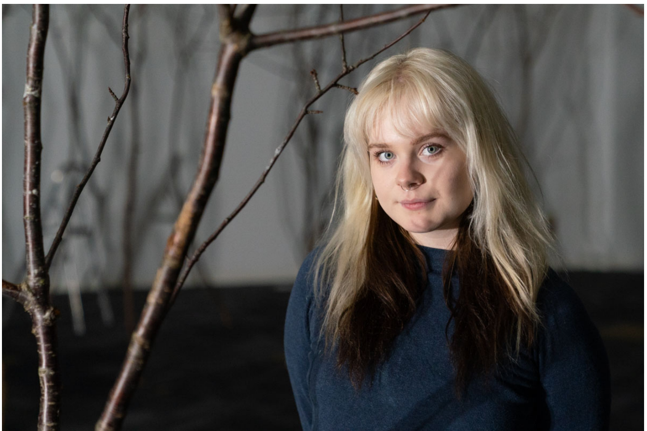
Celeste, Hidden Door 2023.

The developers originally wanted to build 194 flats on the site with 35 per cent, or 68 affordable homes. The plans were then submitted to The City of Edinburgh Council in September 2022 with amendments to the height of the residential blocks, and a reduction in number to 174 homes. The decision is due on 24 May 2023, and the Chief Planning Officer is recommending approval subject to legal agreement.