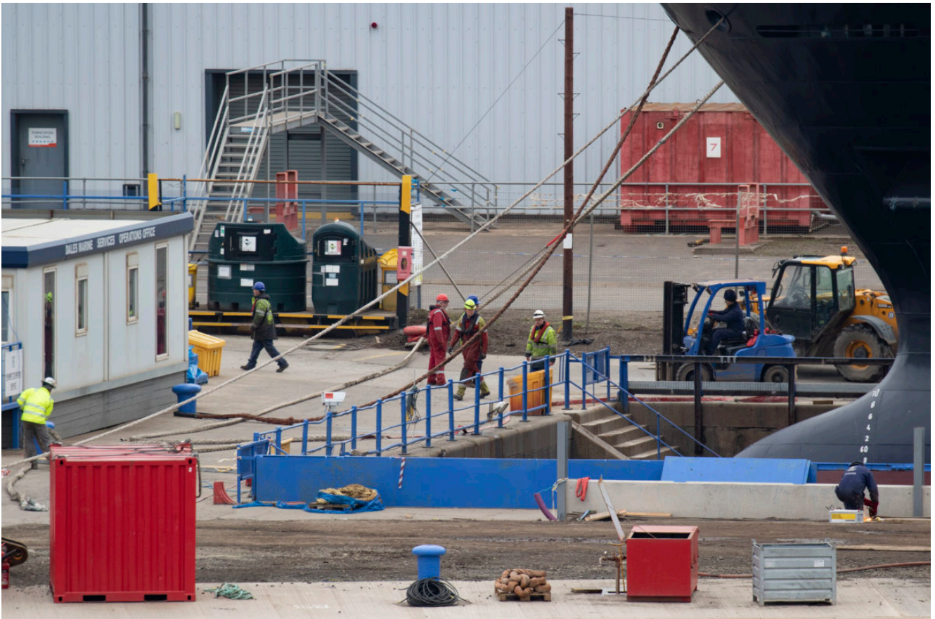
RV PETREL now upright at Leith docks.