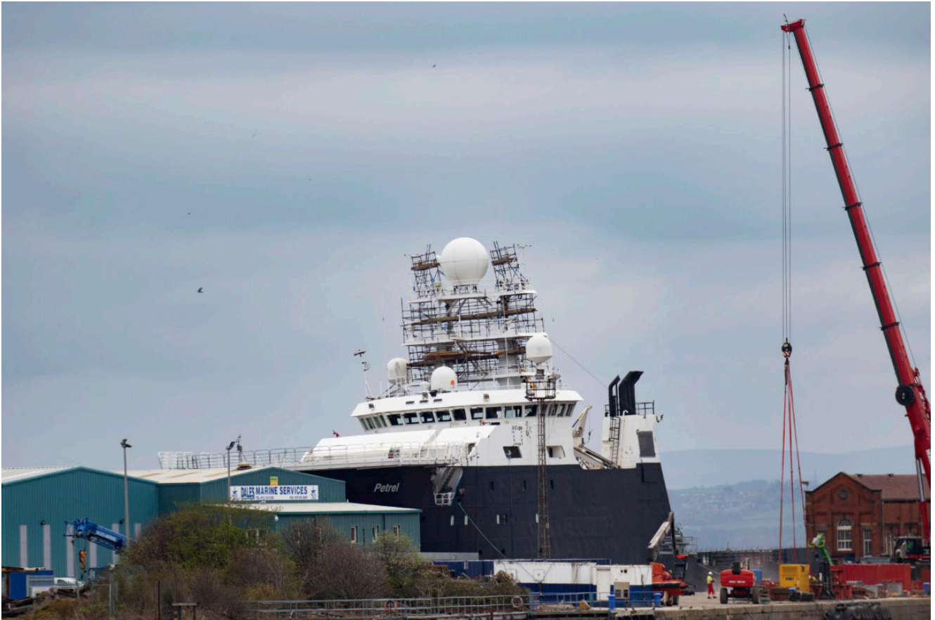
RV PETREL now upright at Leith docks.