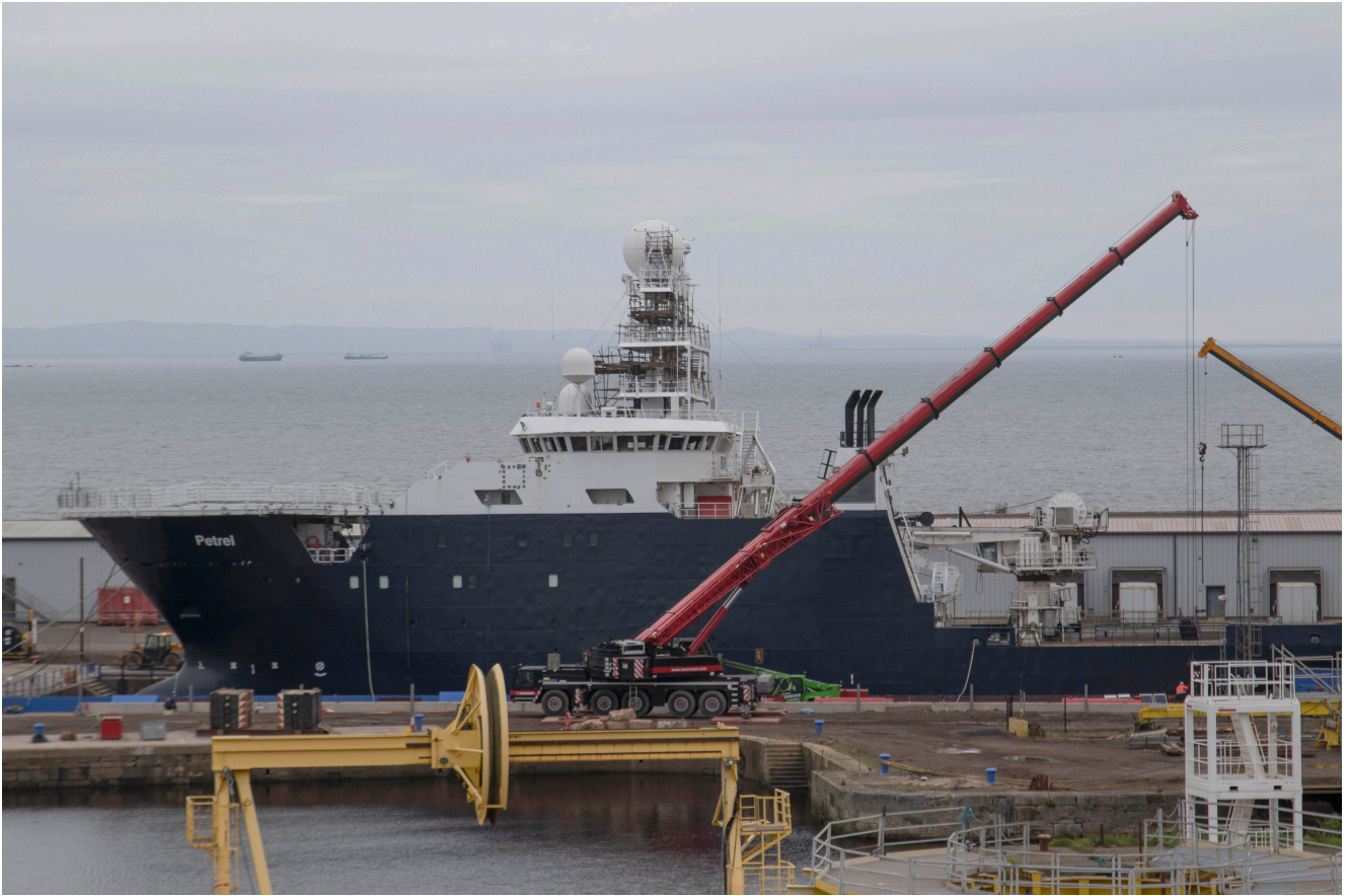
RV PETREL now upright at Leith docks.