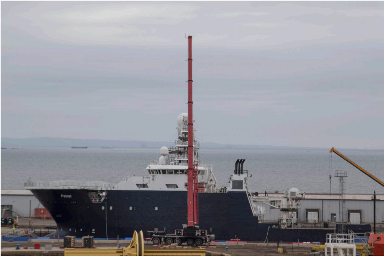
RV PETREL now upright at Leith docks.