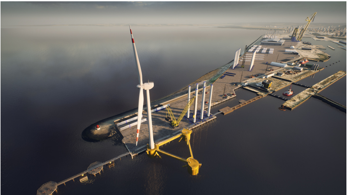
CGI image of the new Leith riverside berth with a floating foundation and turbine.