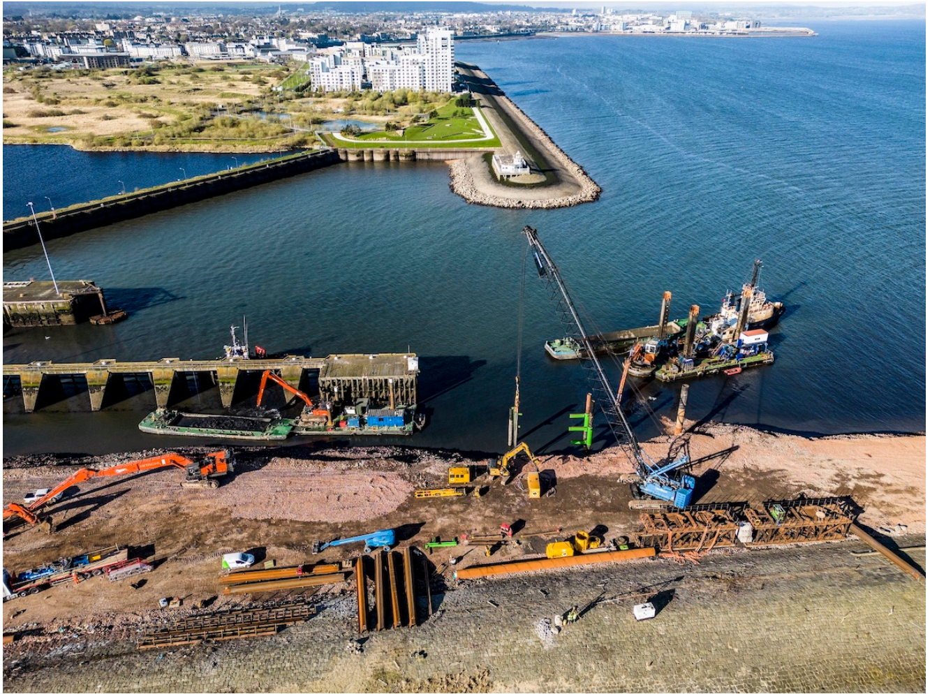
Aerial view of the construction works to create a new riverside berth at Leith Renewables Hub.