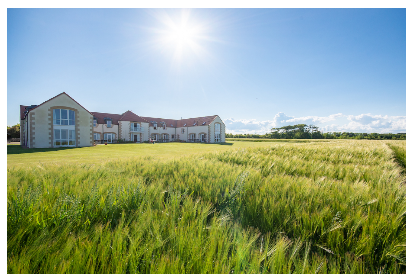
Play — there is a wide range of activities, both indoor and outdoor, including a gym, tennis, billiards, pool, darts, boules, a putting green, a small football pitch and a play area for younger children. All activities can be booked in advance and the majority of them can be used at no cost.

is also a laundry on site. And there is a shop with ready meals and wine, gin from the local distillery, as well as a small stock of essentials that we all seem to forget. There is a hamper service which can be arranged in advance. The resort takes pride in promoting local produce and sells eggs from their own hens. Going forward they are setting up a community garden and will use the crops grown there in the shop and at events, so increasing their sustainability.