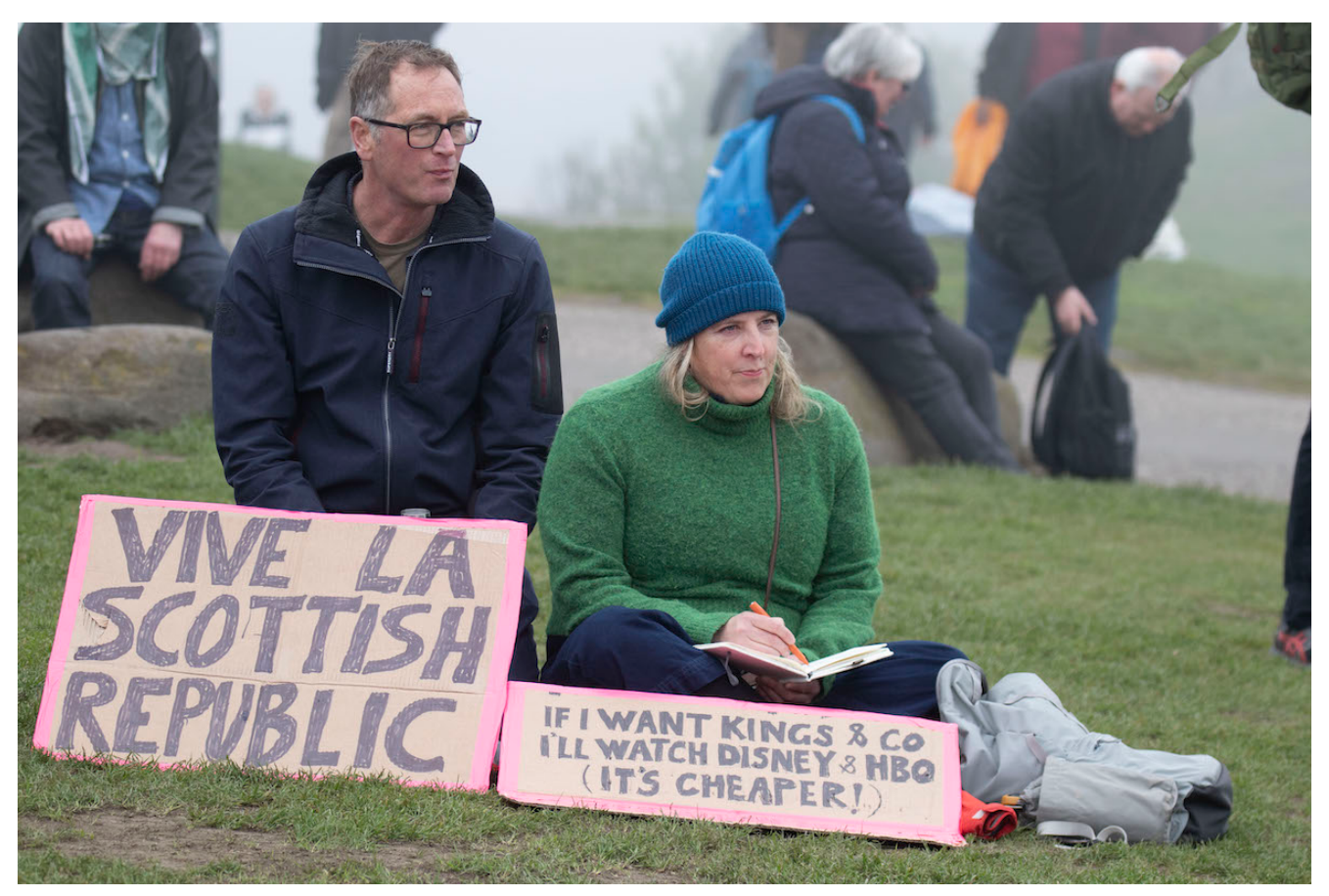
Our Republic demo on Coronation Day at Calton Hill Edinburgh