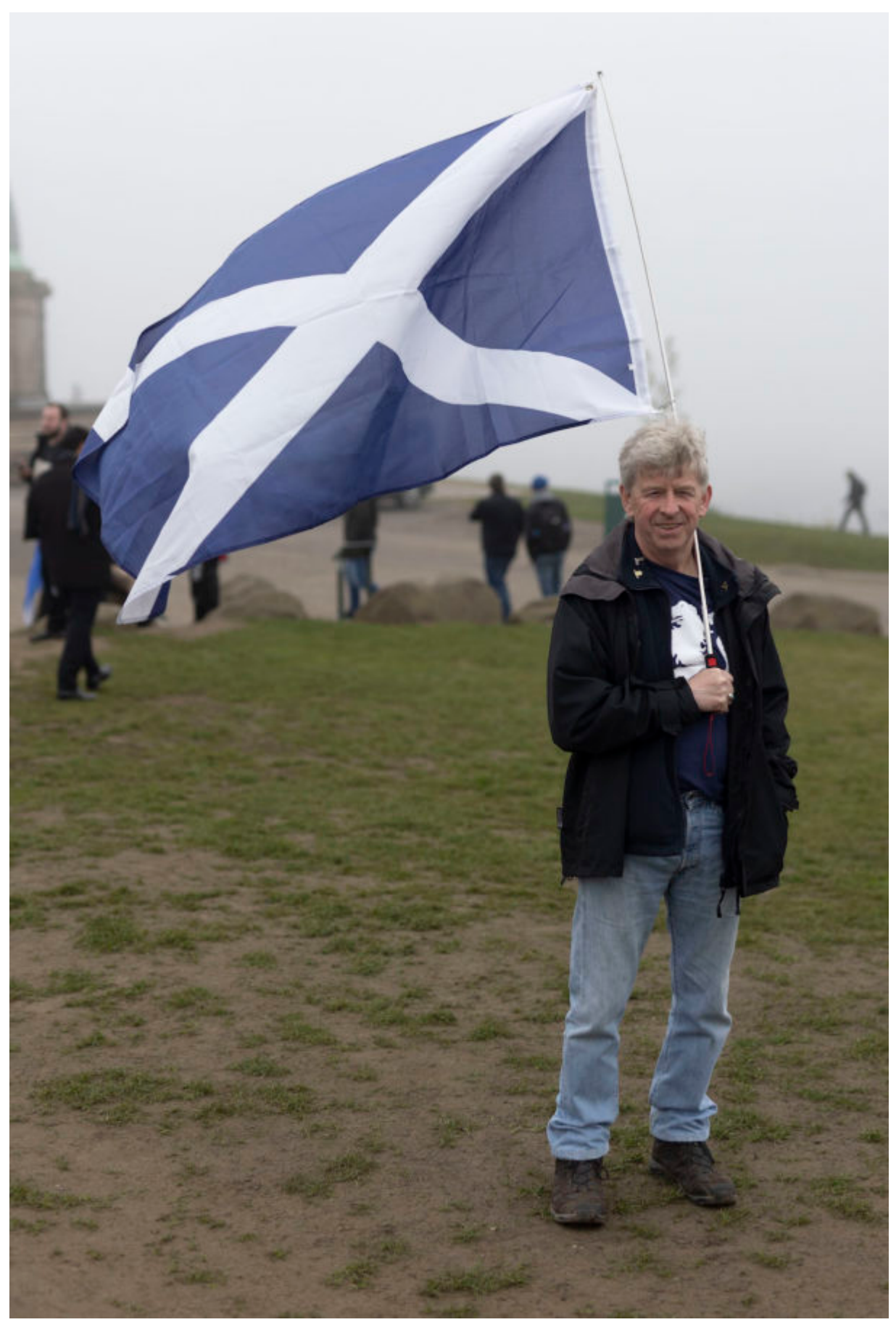
Our Republic demo on Coronation Day at Calton Hill Edinburgh