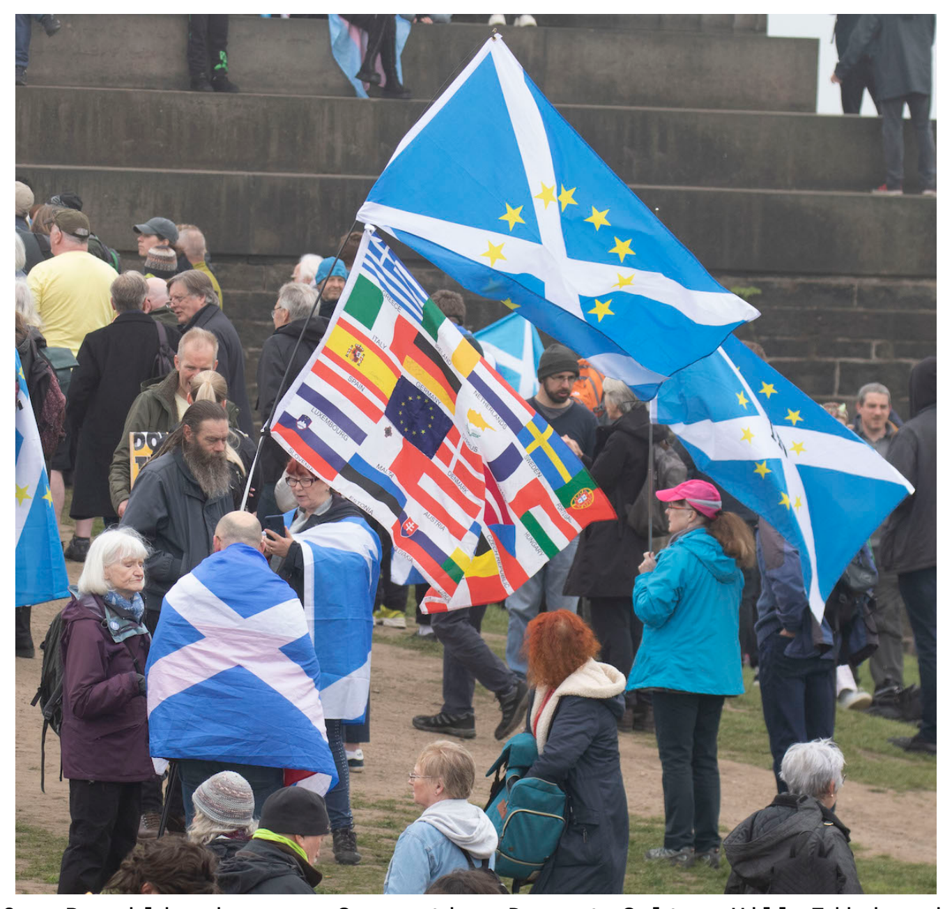
Our Republic demo on Coronation Day at Calton Hill Edinburgh