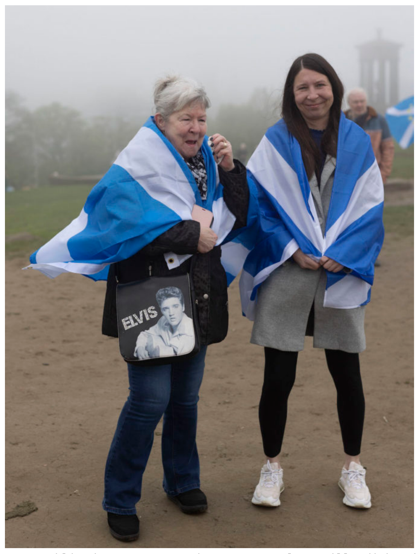
Our Republic demo on Coronation Day at Calton Hill Edinburgh