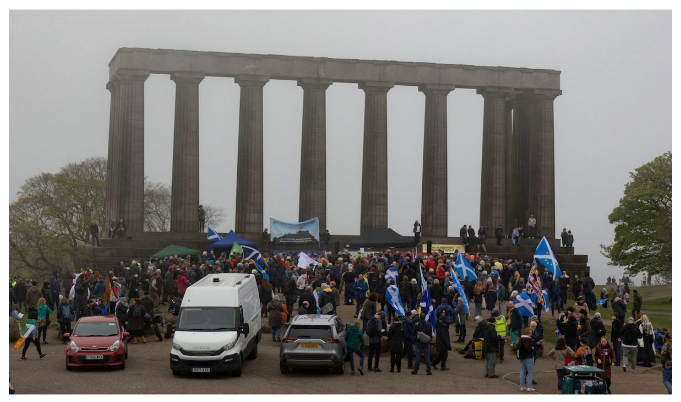
Our Republic demo on Coronation Day at Calton Hill Edinburgh