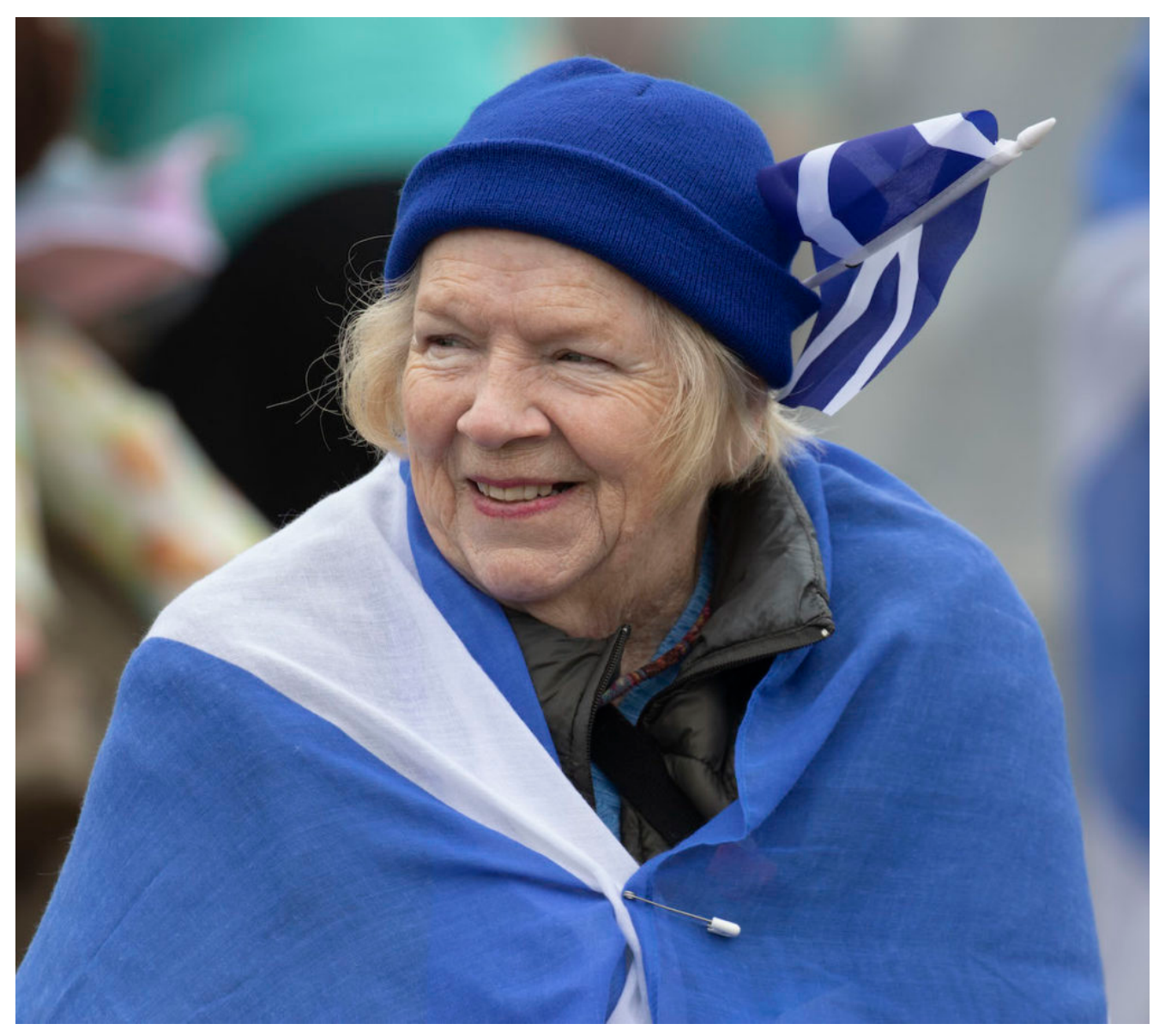
Our Republic demo on Coronation Day at Calton Hill Edinburgh