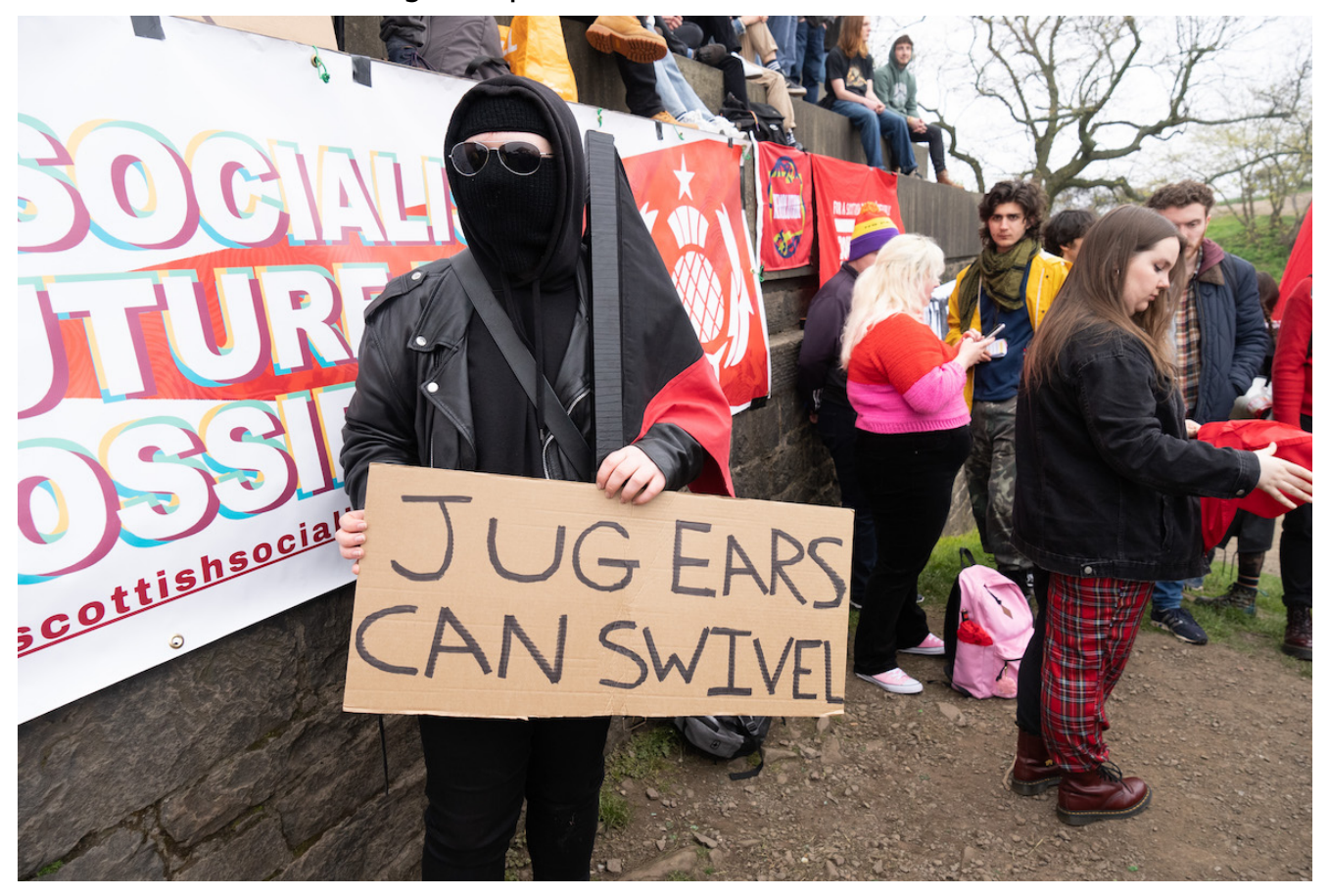
Our republic rally Coronation Day 2023