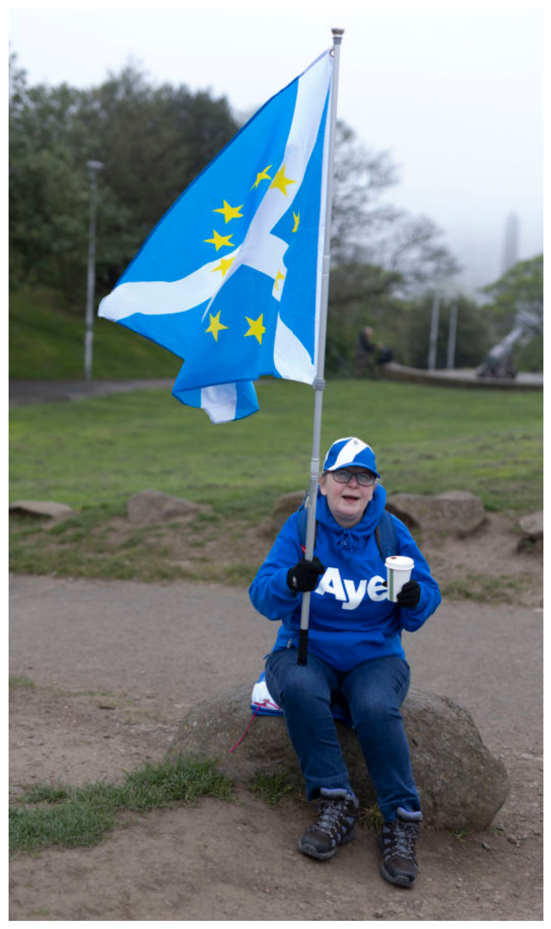
Our Republic demo on Coronation Day at Calton Hill Edinburgh