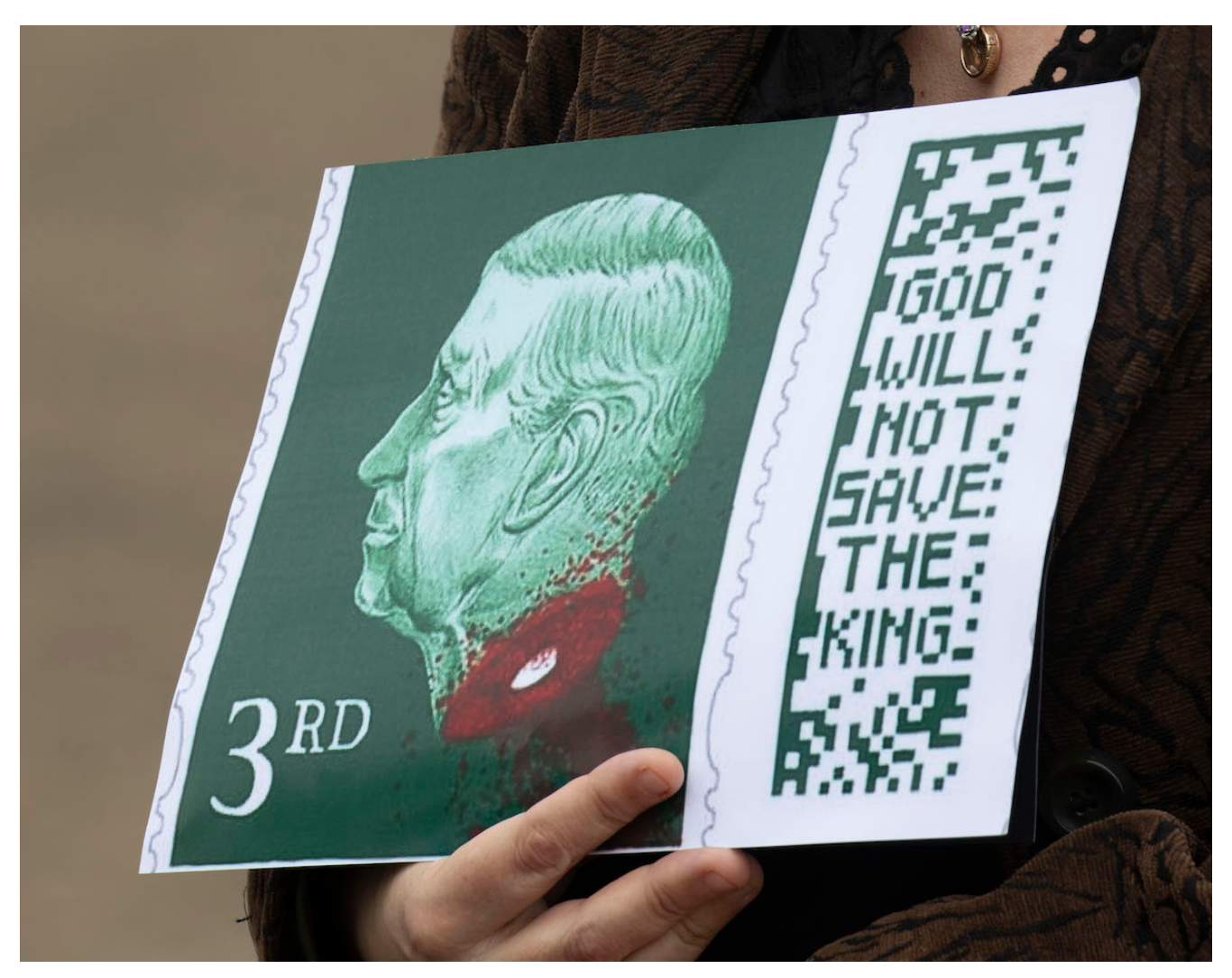
Our Republic demo on Coronation Day at Calton Hill Edinburgh