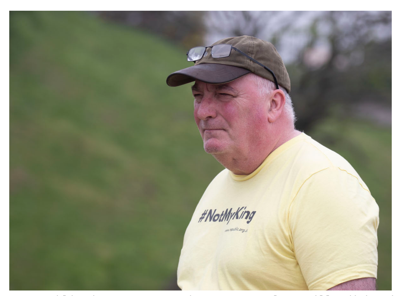
Our Republic demo on Coronation Day at Calton Hill Edinburgh