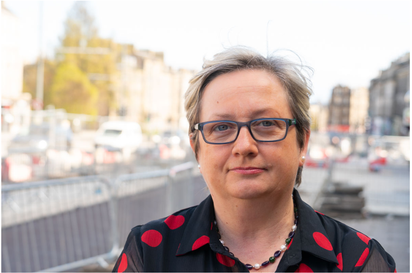
Joanna Cherry, KC,MP.