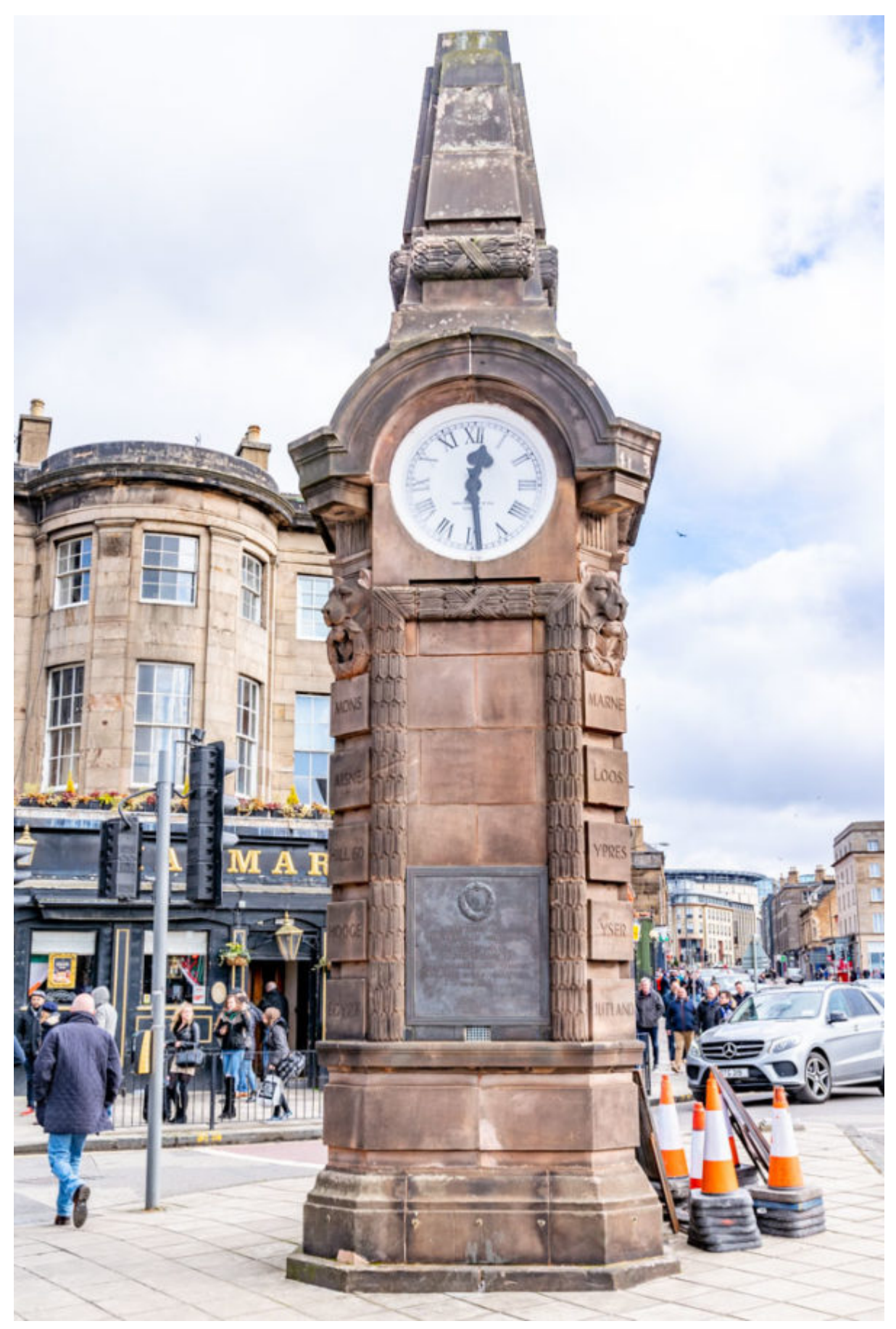
Hearts Memorial Haymarket November 2019.

In anticipation of the anniversary, the Club and the