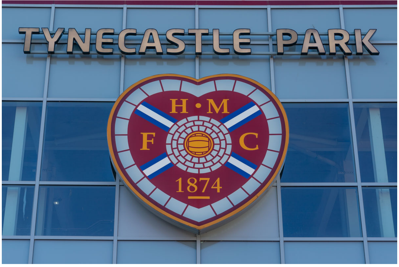
Tynecastle Park.