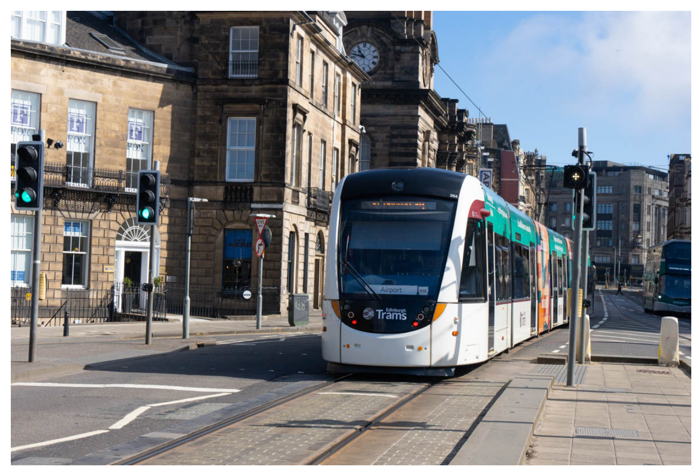
Tram leaving the West End tram stop

With just under two weeks to go before the big day, the trams will continue running on the route to Newhaven to the planned timetable and a frequency of a tram every seven minutes. Works on the Picardy Place island site started during February 2023 and are, we understand, scheduled to be completed by June 2023.