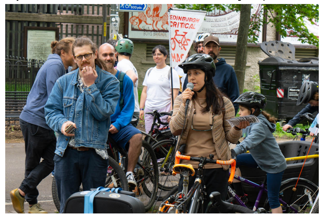
The monthly Edinburgh Critical Mass took a route through the city centre this month