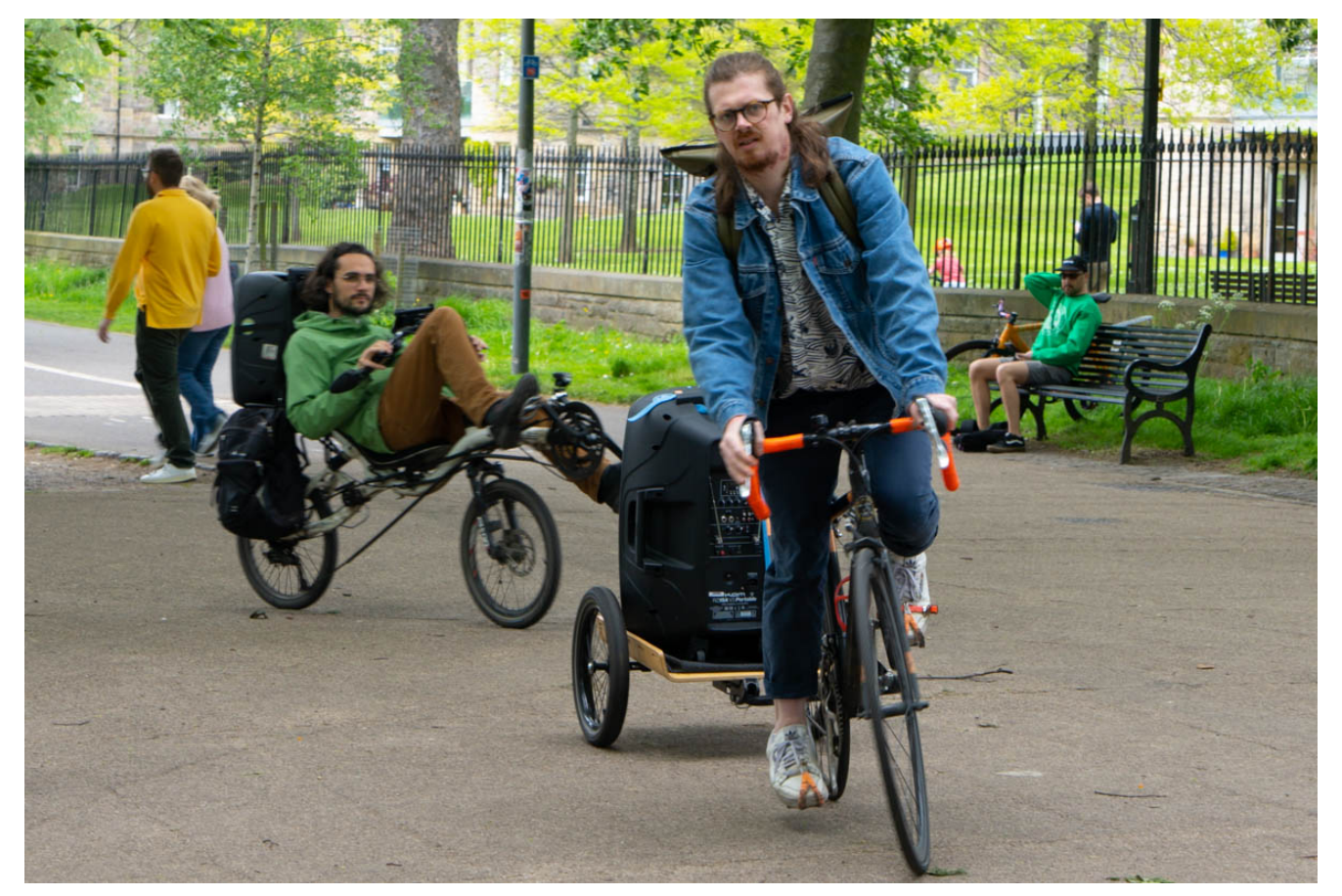
The monthly Edinburgh Critical Mass took a route through the city centre this month