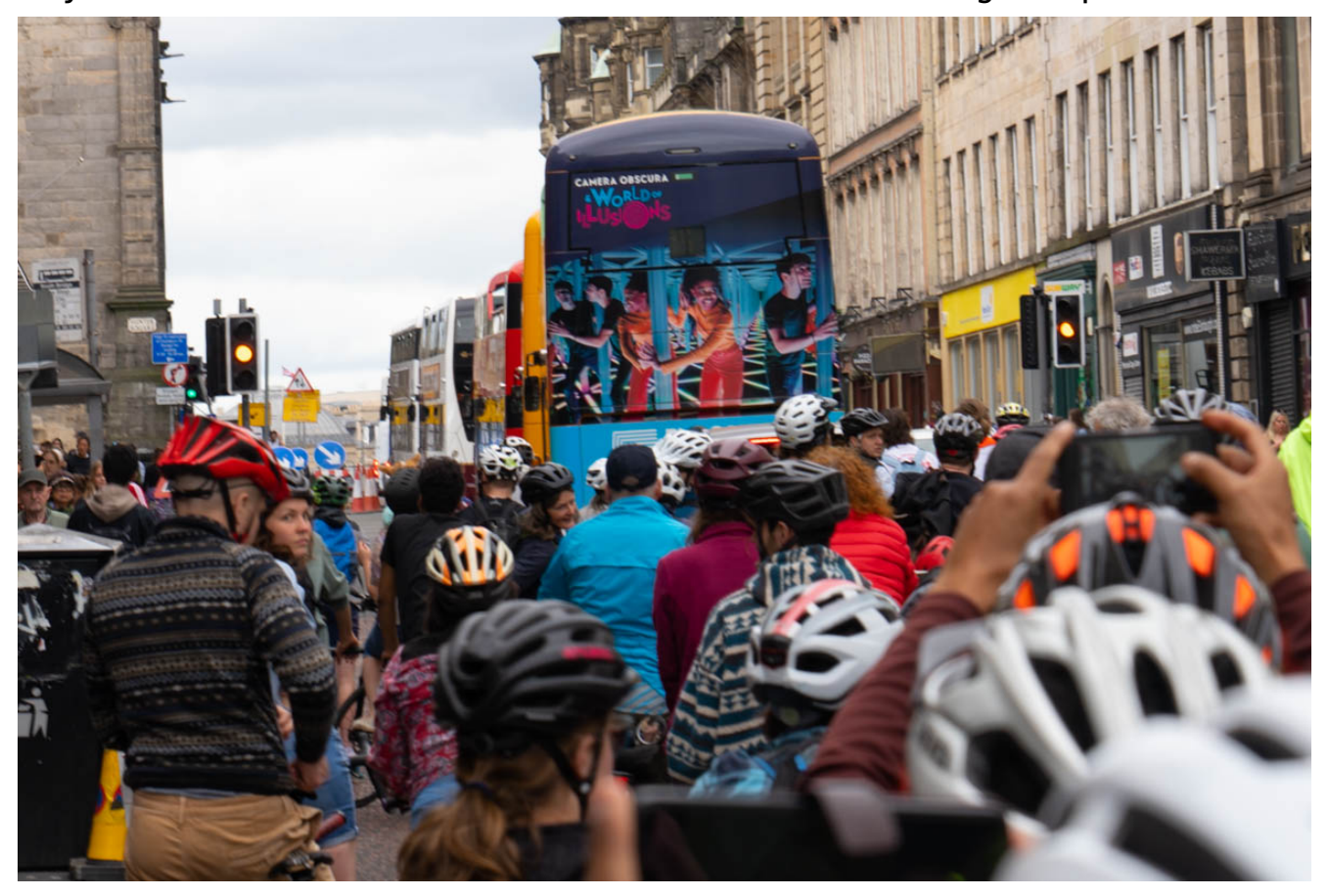
The monthly Edinburgh Critical Mass took a route through the city centre this month