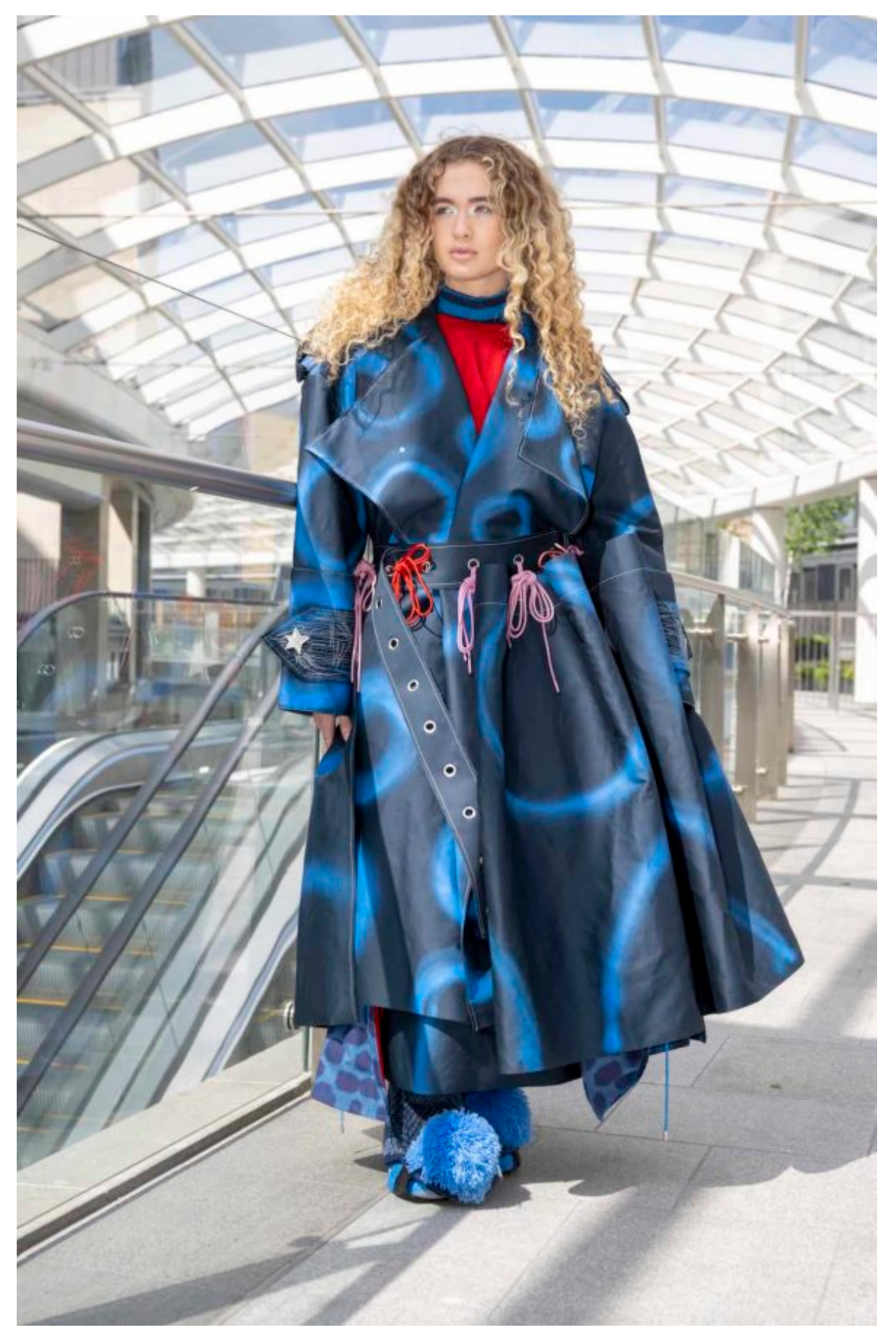
Phoebe Potter's dreamy designs explore the theme of childhood imagination and curiosity.