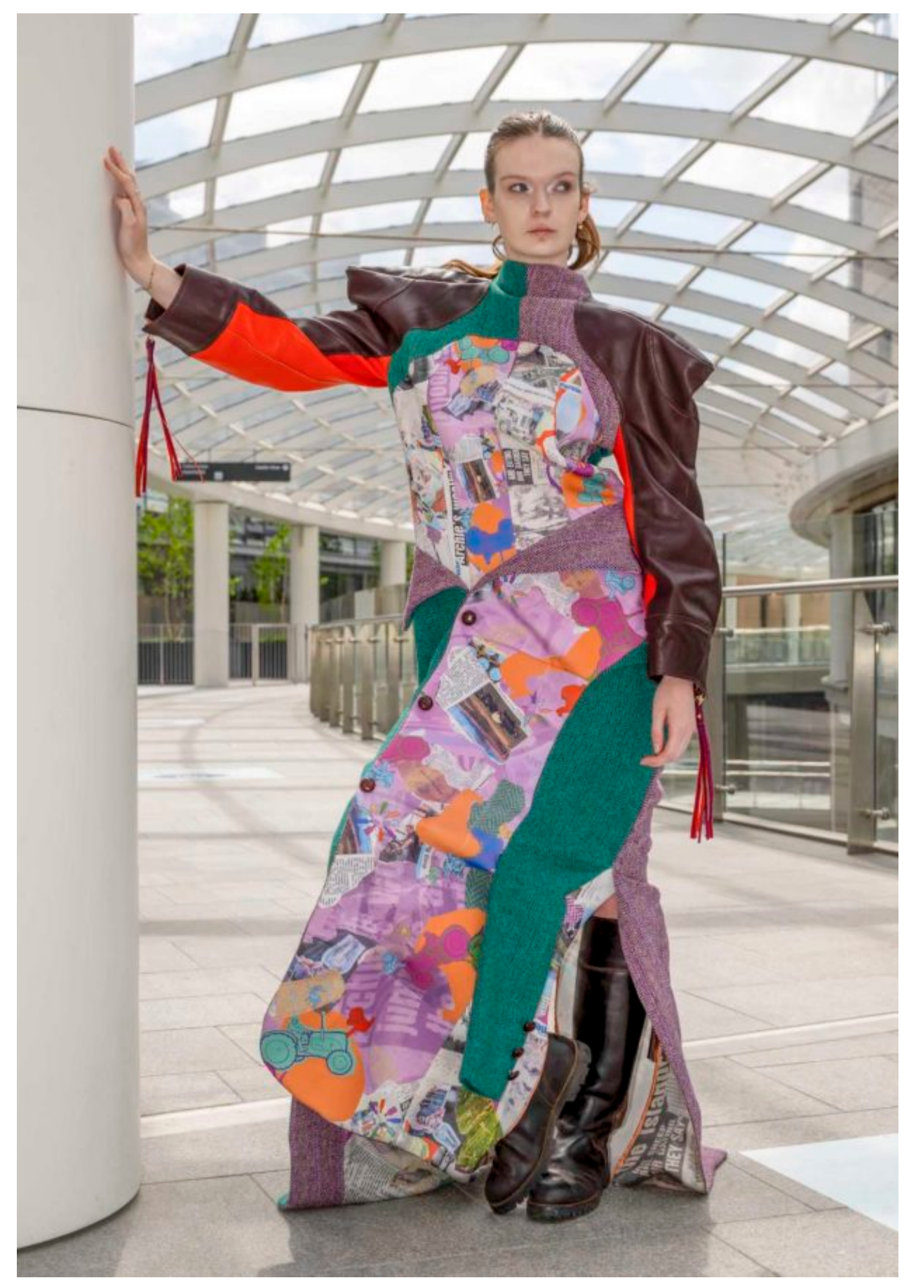
Pic caption: Cairistiona Fletcher's captivating collection 'Mo Innse Gall' (My Hebrides), draws upon her own heritage and childhood.