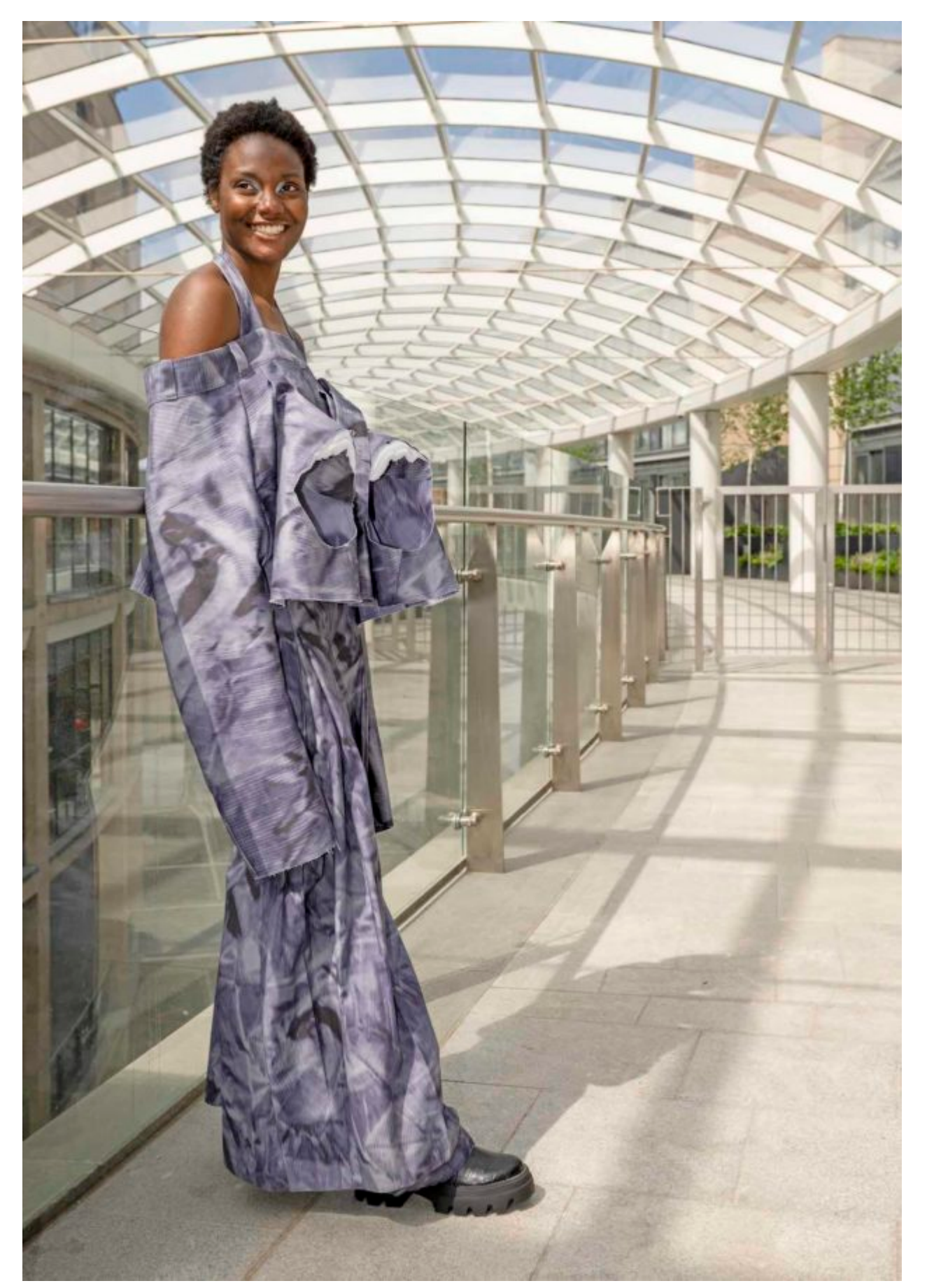
The catwalk will include Irene Chen's collection influenced by the dystopian side of rapid urbanisation