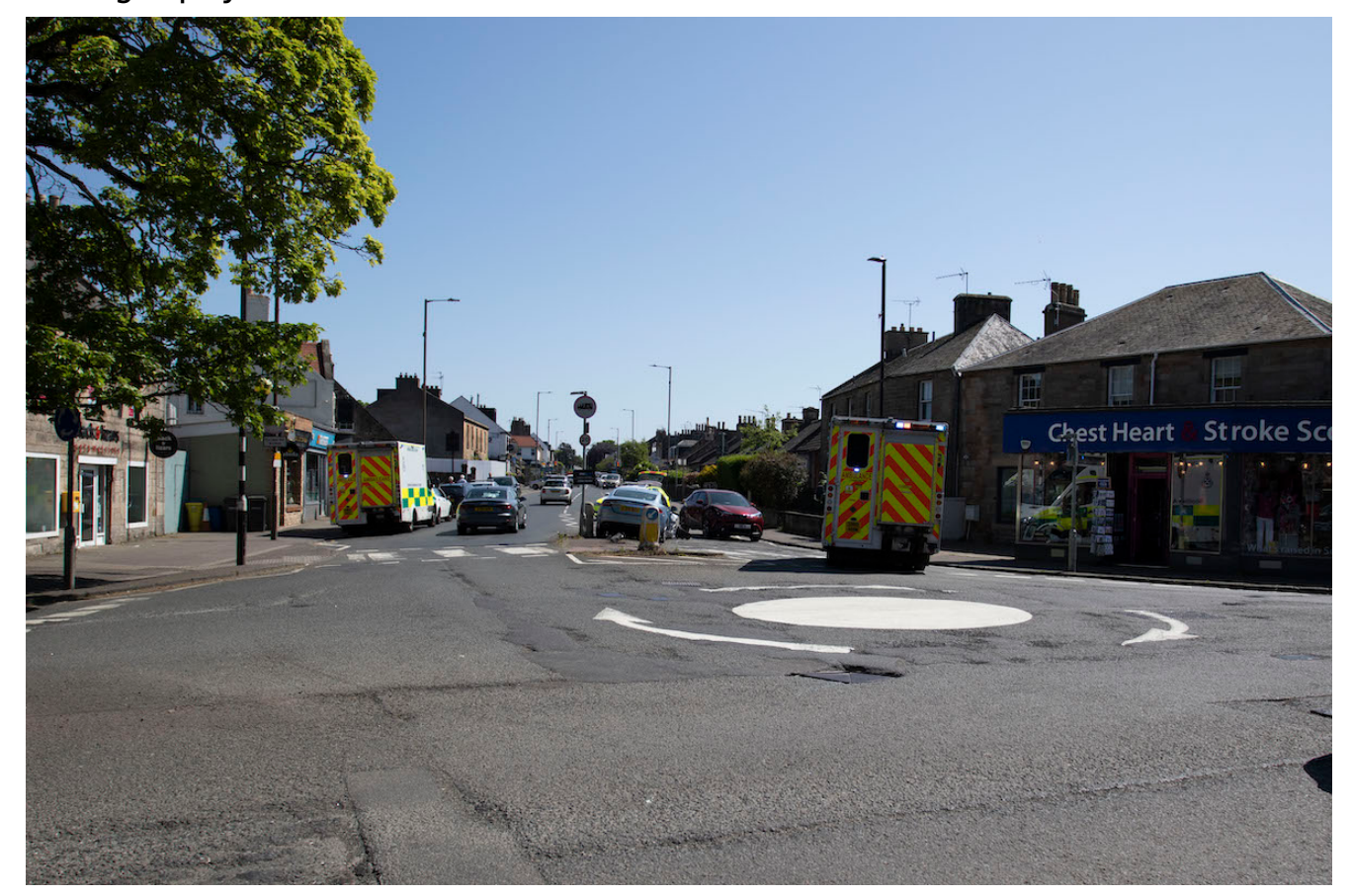
RTA at Davidson's Mains roundabout. The same roundabout Alena Faltyskova was killed by a bus in May 2017. PHOTO Alan Simpson Photography

Faltyskova was killed by a bus in May 2017. PHOTO Alan Simpson Photography