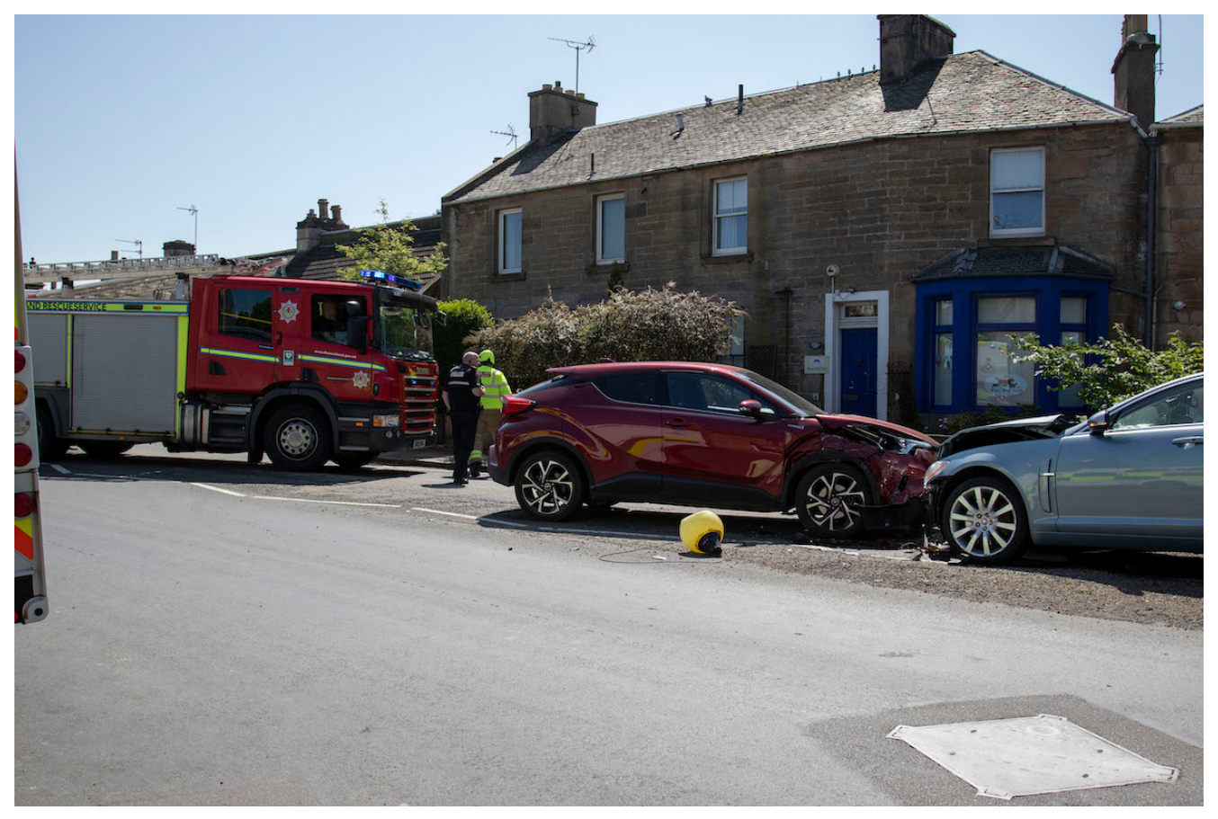
RTA at Davidson's Mains roundabout. The same roundabout Alena Faltyskova was killed by a bus in May 2017.