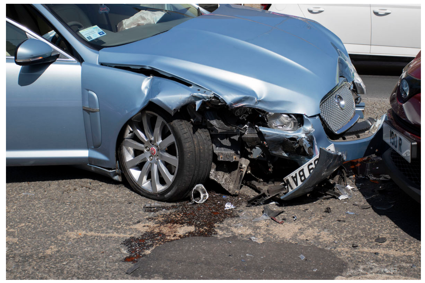
RTA at Davidson's Mains roundabout. The same roundabout Alena Faltyskova was killed by a bus in May 2017.