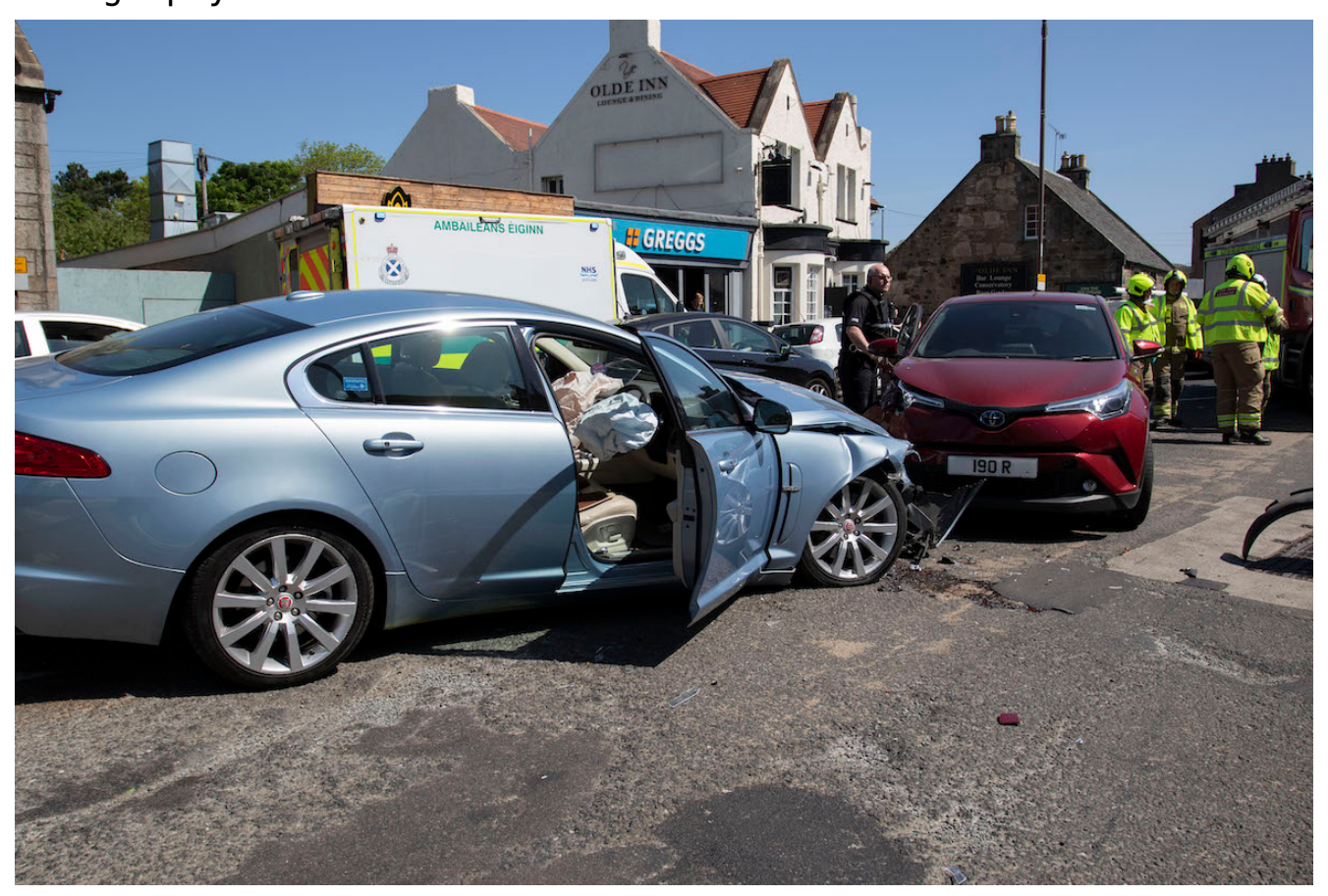
RTA at Davidson's Mains roundabout. The same roundabout Alena Faltyskova was killed by a bus in May 2017. PHOTO Alan Simpson Photography

Faltyskova was killed by a bus in May 2017. PHOTO Alan Simpson Photography