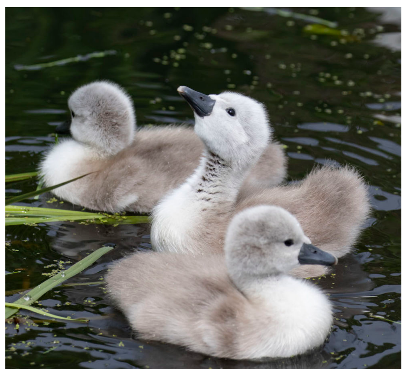
Cygnets at Inverleith Park Edinburgh.