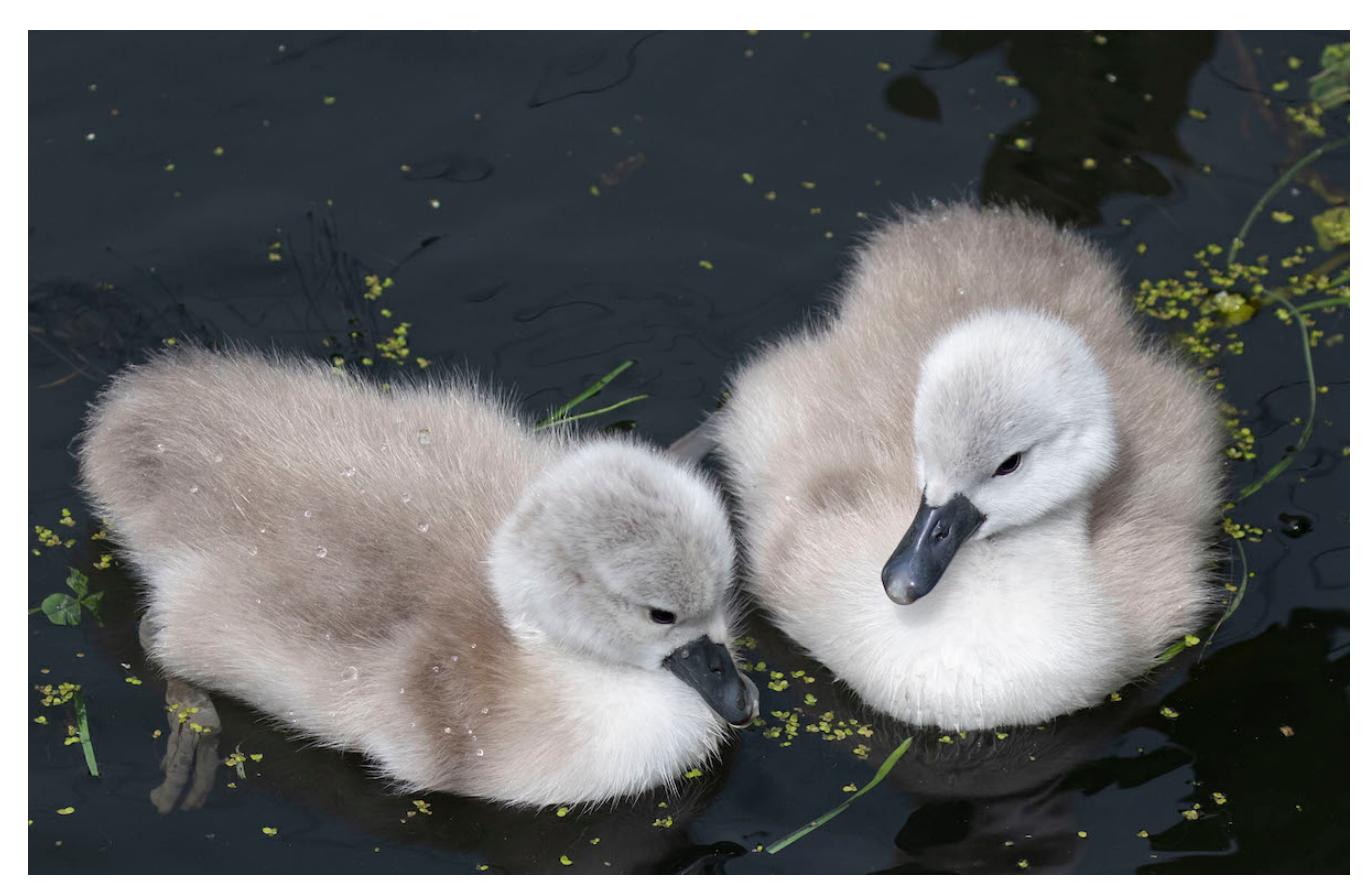
Cygnets at Inverleith Park Edinburgh.