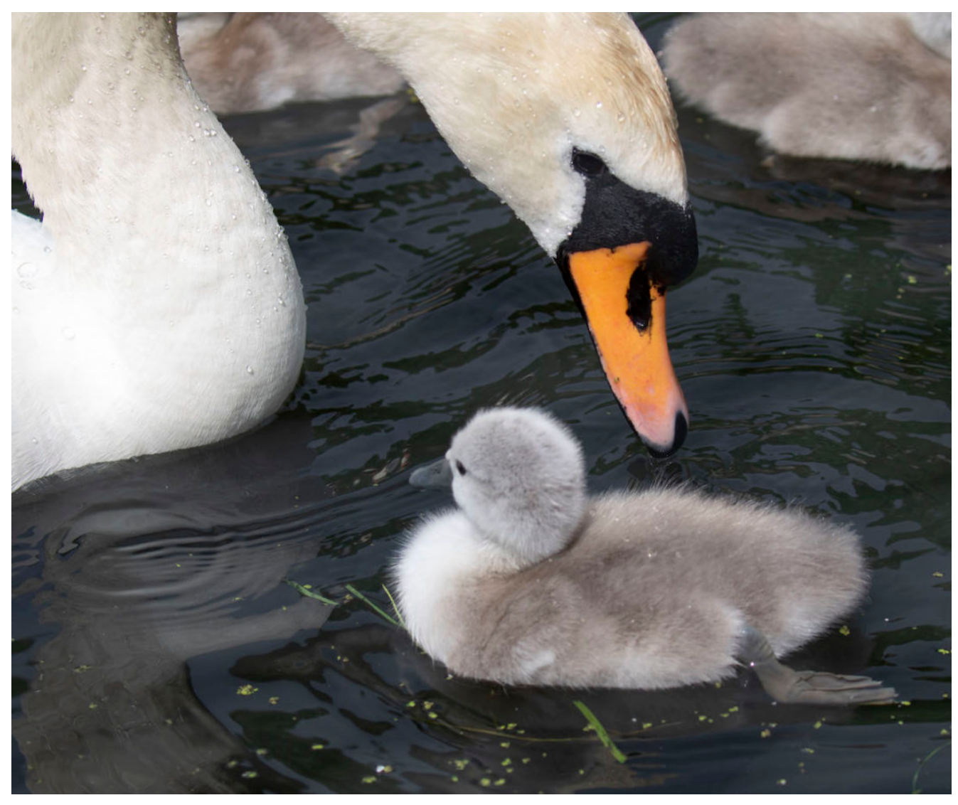
Cygnets at Inverleith Park Edinburgh.